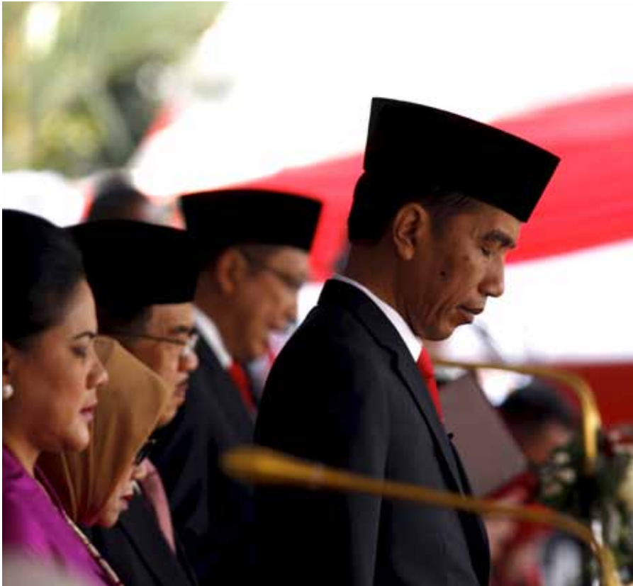
President Joko Widodo prays during Independence Day celebrations at the Presidential Palace in Jakarta. There has been no fundamental shift in the role that Islam plays in politics or foreign policy.

of the Salafist threat to Indonesia taps in to a discourse that has been present since the early 2000s about the spread of violent jihadist groups that are inspired and sometimes directly funded by Middle Eastern sources. Jemaah Islamiyah (JI), the jihadist organisation responsible for the 2002 Bali bombing that killed 202 people, was and remains aligned to al-Qaeda.