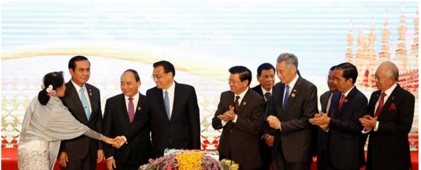
Chinese Premier Li Keqiang greets Myanmar's State Counsellor Aung San Suu Kyi during the ASEAN-China summit in Vientiane in September 2016.

China is now the world's number one trading power and has been since 2014. It is also the world's biggest exporter of manufactured goods. Chinese toothbrushes and detergents arrive safely on African and Latin American shores because the world's oceans are open to freedom of navigation and safe for commercial shipping. The US Navy is inadvertently doing the Chinese economy a big favour by keeping international sea lanes open. This has facilitated the near quadrupling of China's global trade from US$600 billion in 2004 to US$2.2 trillion in 2015.