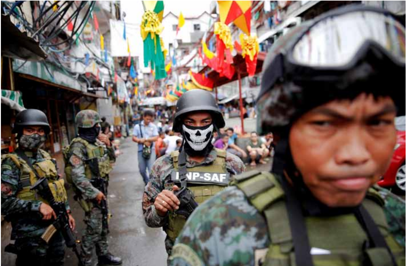
Members of the Philippines' armed forces on a drug raid in Manila in October 2016. Rather than reduce crime, hard-line policies may consolidate drug groups.