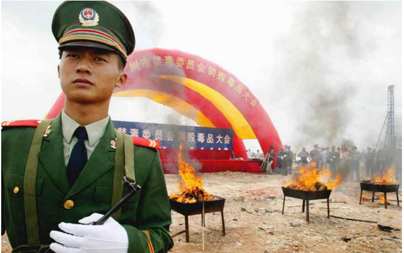
A Chinese policeman stands guard as 600 kilograms of drugs are destroyed in Guangzhou, Guangdong province. The southwestern Chinese province is a gateway for heroin traffickers from Thailand, Myanmar and Laos, who operate across 'a particularly lawless borderline'.

cartels have also been reported. This reflects the impact of the globalisation of trade and the increasing wealth of China, India and the region. Opportunities abound for expanding to new 'blue sky' industries or locations unhampered by existing protection providers.