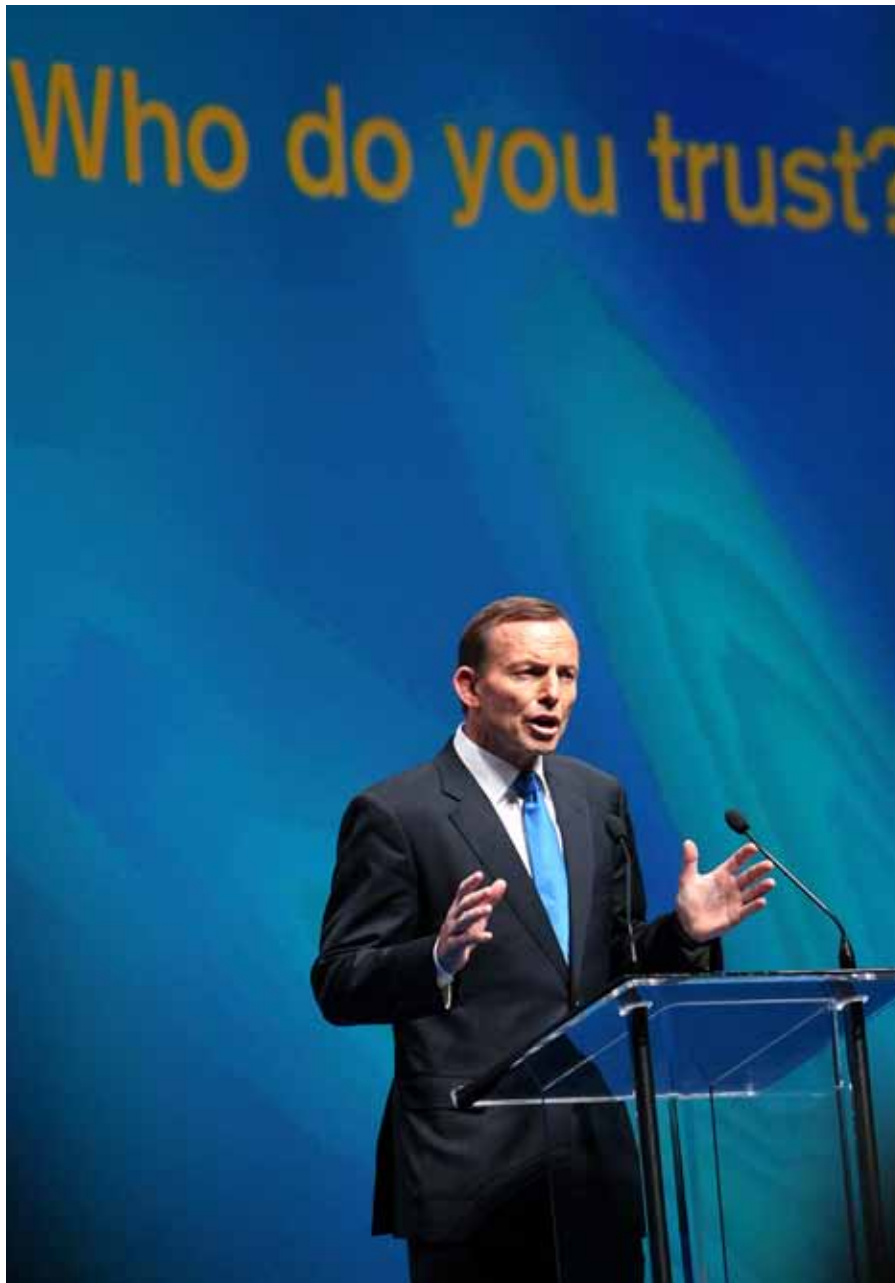
Tony Abbott on the path to the prime ministership in 2013. Australian politicians have come increasingly to rely on slogans, but voters have tuned out and trust across the electorate is at a low ebb.