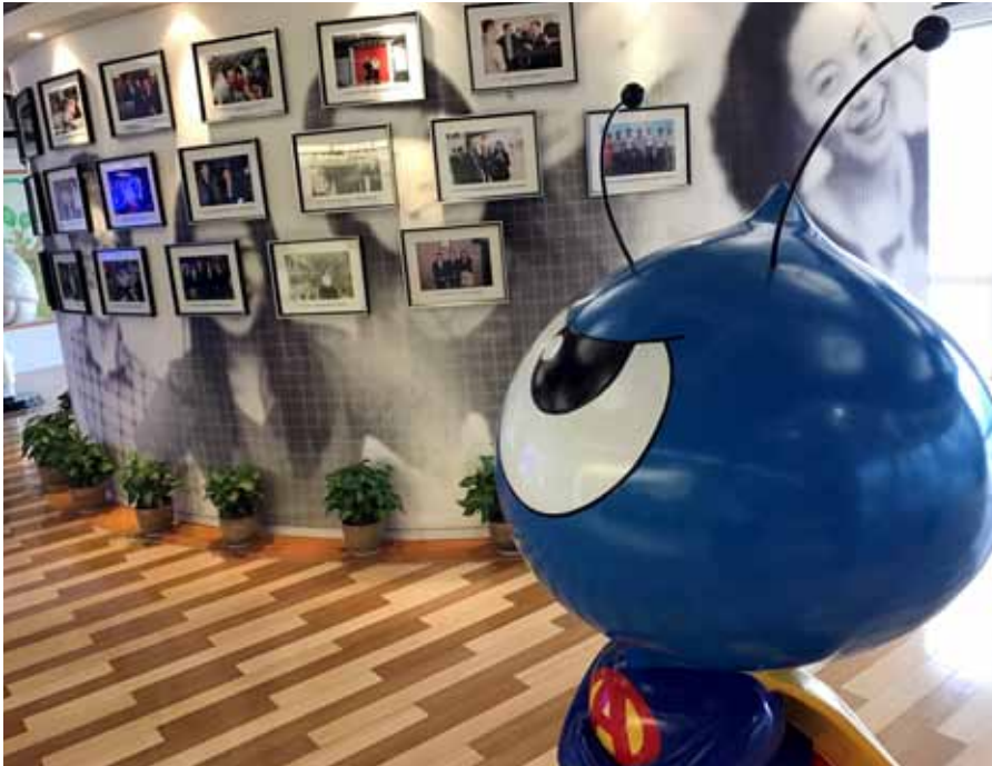
A mascot of Ant Financial at the digital finance firm's office in Hangzhou. Digital finance serves groups of customers that have been neglected by the traditional finance industry.