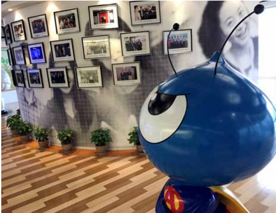
A mascot of Ant Financial at the digital finance firm's office in Hangzhou. Digital finance serves groups of customers that have been neglected by the traditional finance industry.