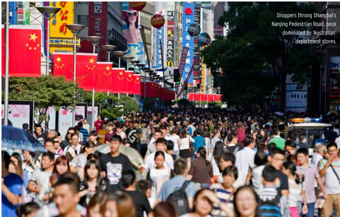
Shoppers throng Shanghai's Nanjing Pedestrian Road, once dominated by 'Australian' department stores.