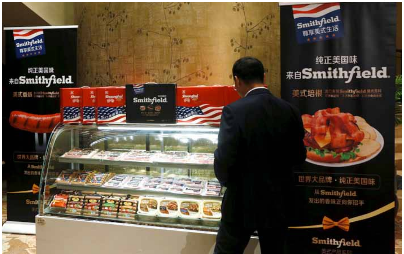
A man looks at Smithfield products at a Shuanghui news conference in Hong Kong in March 2016. The Chinese interest acquired the US meat processor in 2013.