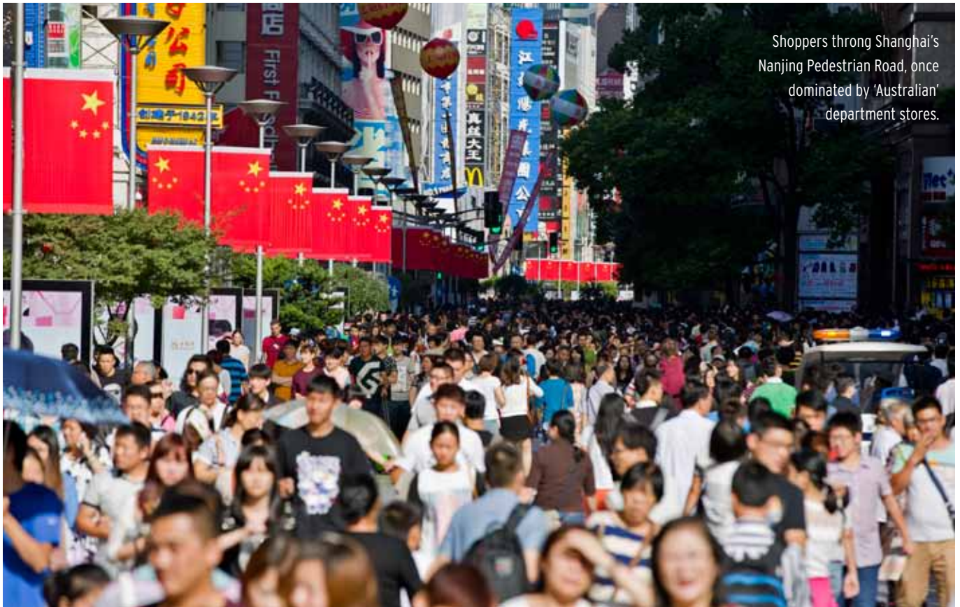
Shoppers throng Shanghai's Nanjing Pedestrian Road, once dominated by 'Australian' department stores.