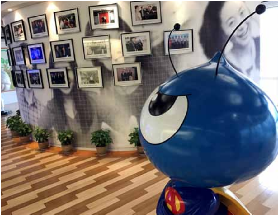
A mascot of Ant Financial at the digital finance firm's office in Hangzhou. Digital finance serves groups of customers that have been neglected by the traditional finance industry.