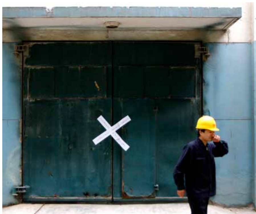
A worker leaves the plant after sealing the doors of a cement factory in northern China. Cement is among the industry sectors with serious overcapacity problems.