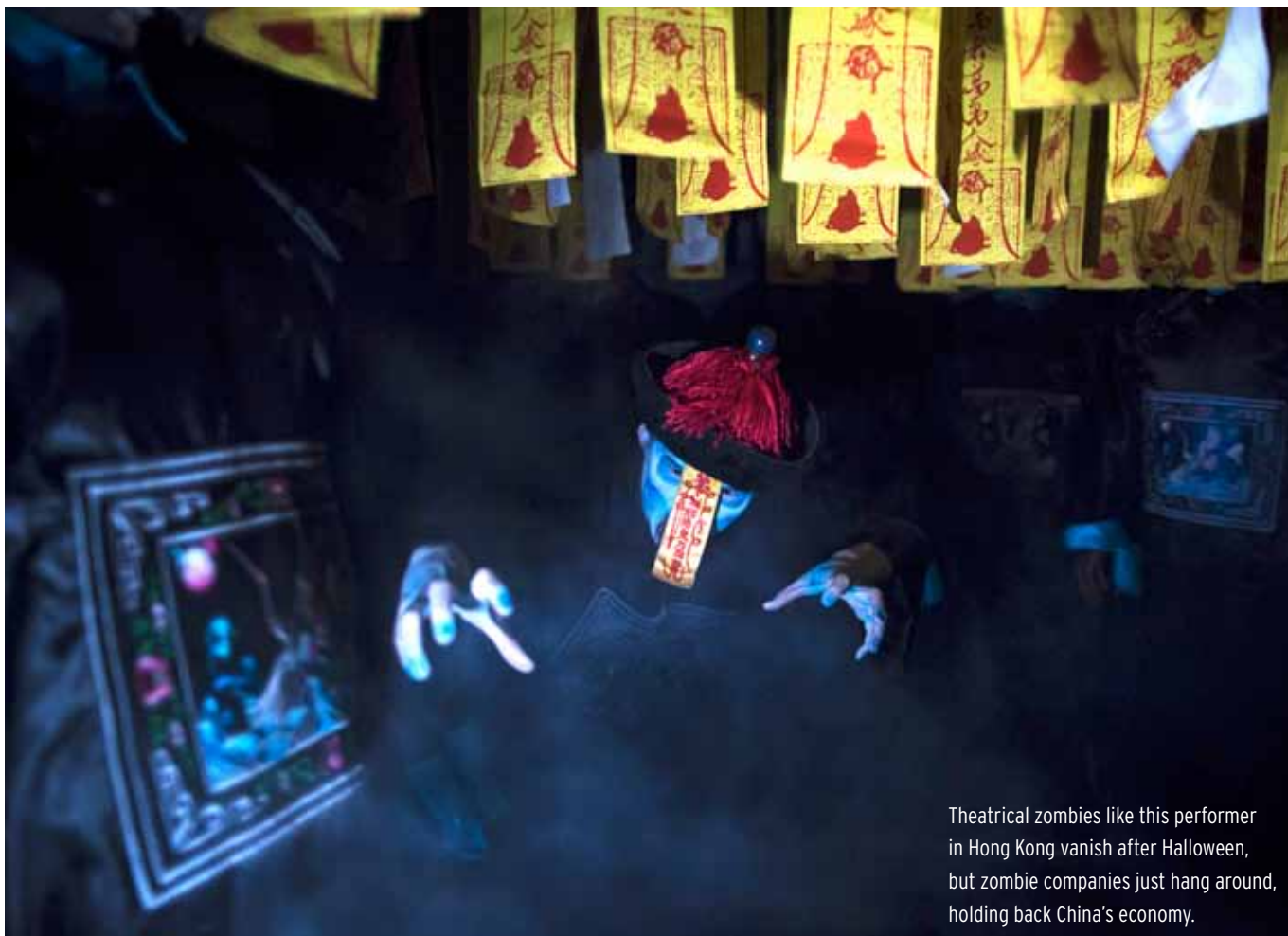
Theatrical zombies like this performer in Hong Kong vanish after Halloween, but zombie companies just hang around, holding back China's economy.