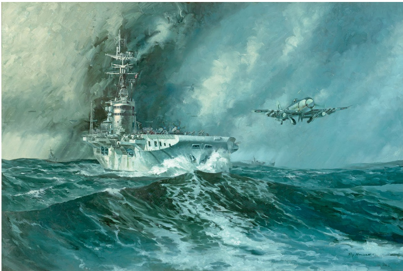
HMAS Sydney (III)'s deployment to Korean waters was the first time a dominion carrier had been deployed on active service. It was the only time Sydney saw active service as an aircraft carrier.