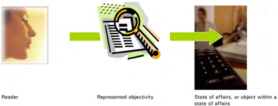
Figure 1: The directional meaning ray.

it may not exist in the real world or may behave differently to such objects within the real world. As a reader reads a passage of words and phrases (meaning units) containing a represented objectivity, he or she relates directly to the state of affairs that the represented objectivity is helping to clarify. Consequently, a particular represented objectivity within a scientific literary work causes us to direct ourselves to corresponding states of affairs. Because we are dealing with a scientific work rather than a literary work of art, this directional ray passes through the content of these represented objectivities so that they refer to objectively existing states of affairs, or to objects contained within them rather than to some fictional creation (Ingarden, 1965). See Figure 1 for a representation of this. It is through this directional meaning ray that the represented objectivities claim to determine objects in the real world as they are in themselves and thereby claim to be genuine judgements (Ingarden, 1968).