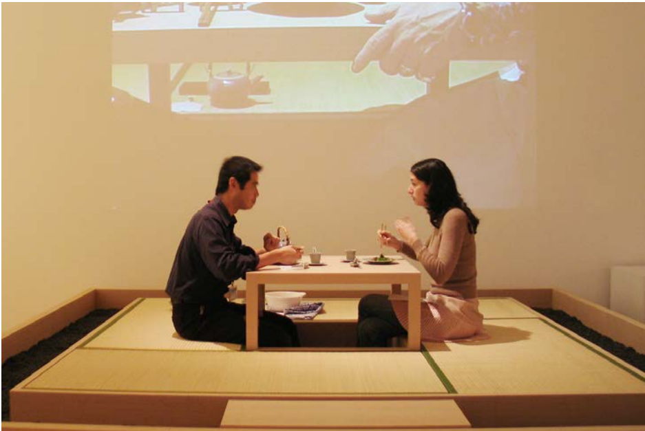
Lee Mingwei, The Dining Project 1997–present; installation view at Mori Art Museum, Tokyo, Japan, 2005; mixed media interactive installation; wood, tatami mats, tableware, beans, projection; 323 x 323 x 85 cm.

evinced by his other 'relational' works including The Letter Writing Project (1998), The Sleeping Project (2000), The Living Room Project (2000) and The Mending Project (2009). In The Dining Project , the conversation occurs in the context of the presentation and eating of food, wherein the host and guest enter into a shared communion, performatively enacting hospitality through dialogue and commensality. On one level, Lee's work may be understood as exemplifying the form of practice that Kester refers to as 'dialogical aesthetics'. 41 For Kester, dialogical practices are participatory and interactive, involving conversational exchanges through situational encounters between the artist and the participant that are often performative. 42 On this basis, he argues that art needs to be viewed as a 'process of communicative exchange rather than a physical object'. And yet, while Lee's work may be viewed as sharing some of the features of 'dialogical aesthetics' through the communicative interactions it stages between the artist and the participant, the quality of these conversations and reciprocal exchanges hinges on the multi-sensorial, material and affective aesthetic of Lee's performance installation.