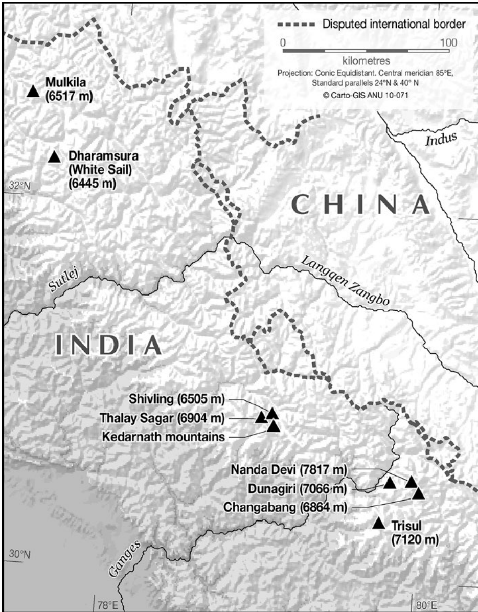
Map 2. The Indian Himalaya