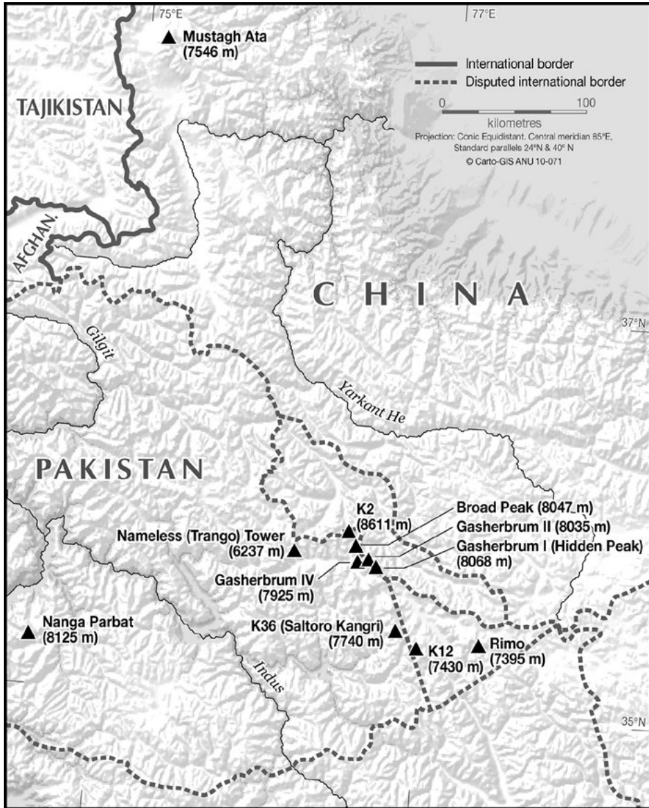
Map 1. The Pakistani Himalaya