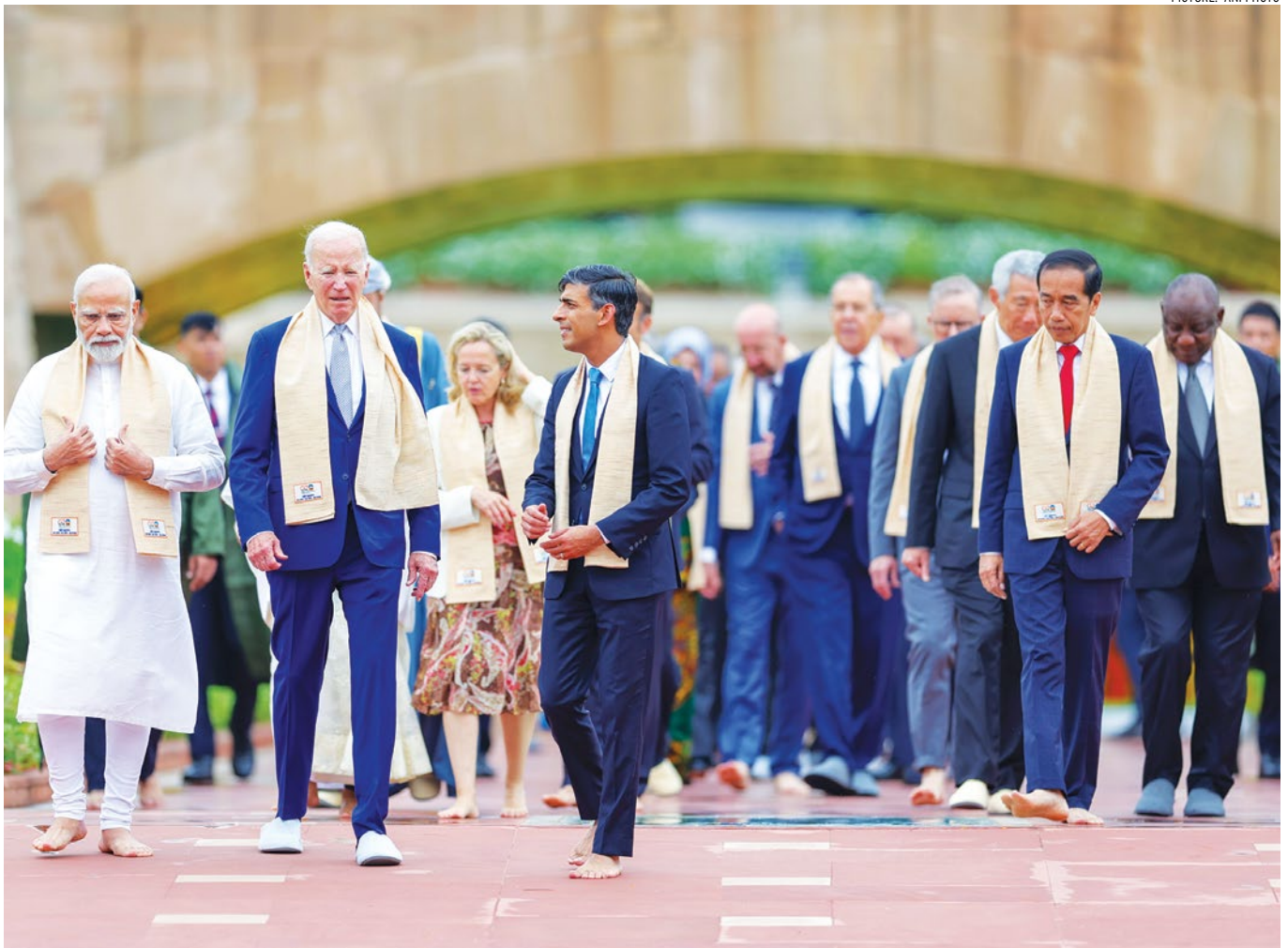
Prime Minister Narendra Modi, US President Joe Biden and UK Prime Minister Rishi Sunak walk ahead of G20 leaders at Raj Ghat, New Delhi (September 2023).