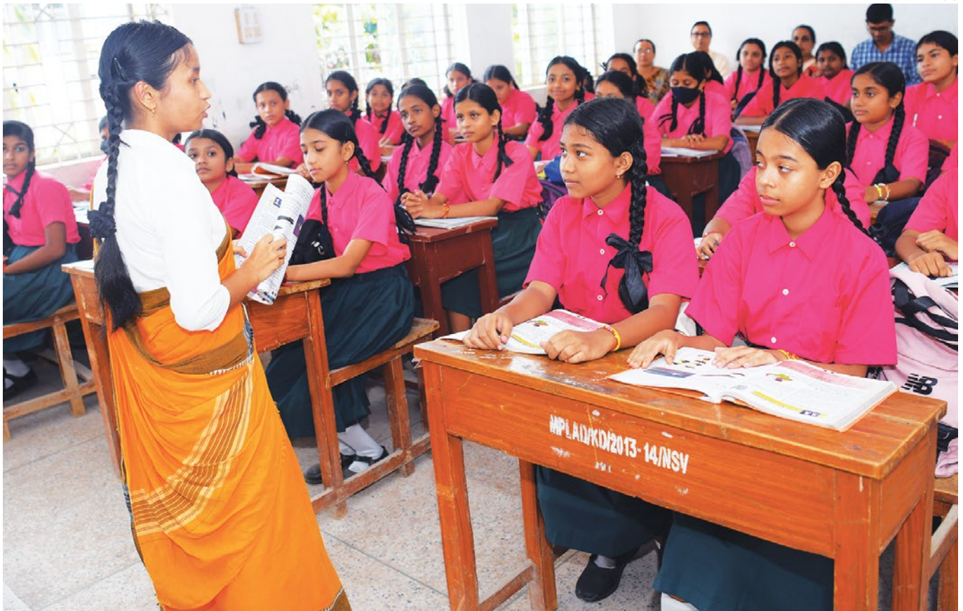
A senior student dressed as a teacher instructs junior students on the eve of Teachers' Day at a higher secondary school in Agartala, Tripura.