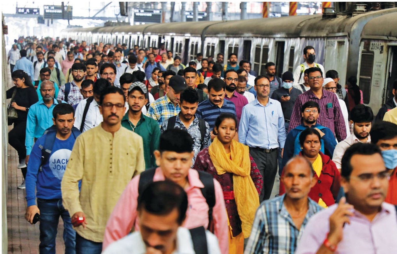
Commuters walk on a platform after disembarking from a suburban train at a railway station in Mumbai.