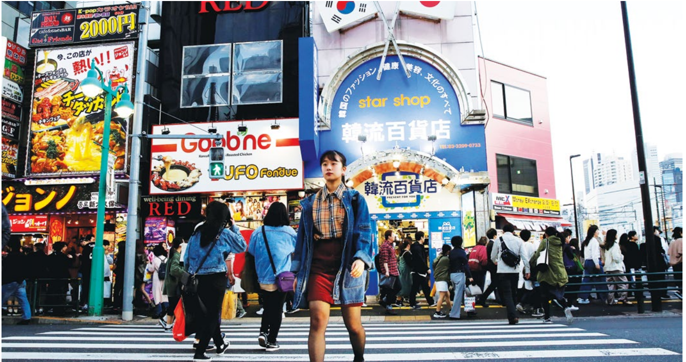
Pedestrians walk through Tokyo's Shinjuku district, which is known as Tokyo's Korea Town.