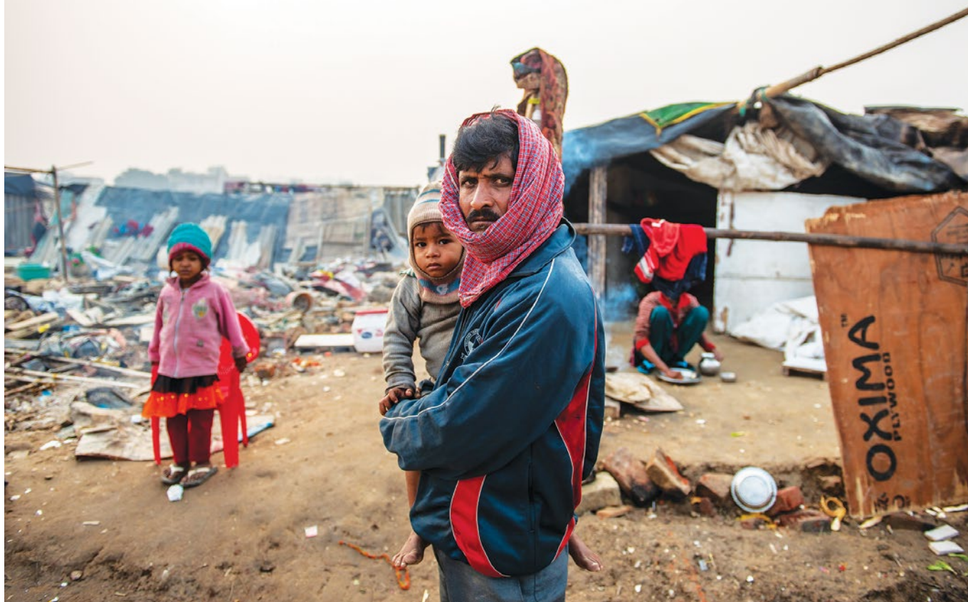
A man and his child are photographed in a slum area of Ghaziabad, Delhi NCR.

India (NITI-Aayog) reported that multidimensional poverty fell from 24.85 per cent to 14.96 per cent, while 2022–23 consumption expenditure data suggests a near eradication of poverty at purchasing power parity of US$1.90 per day.