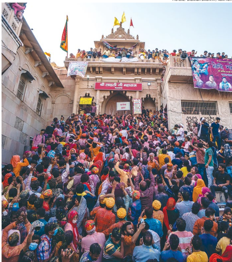
Devotees gather at the Ladliji Temple in Barsana.