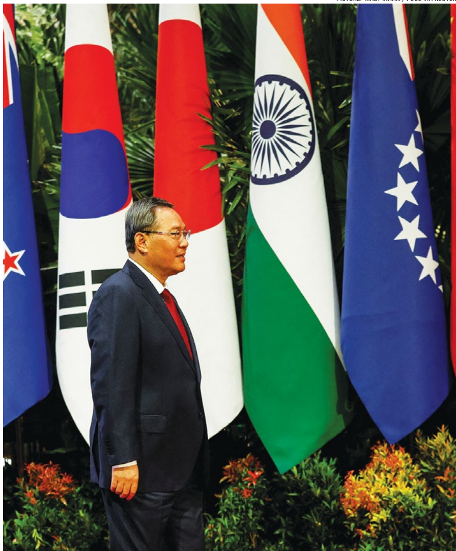
China's Premier Li Qiang arrives at the ASEAN Summit in Jakarta (September 2023).