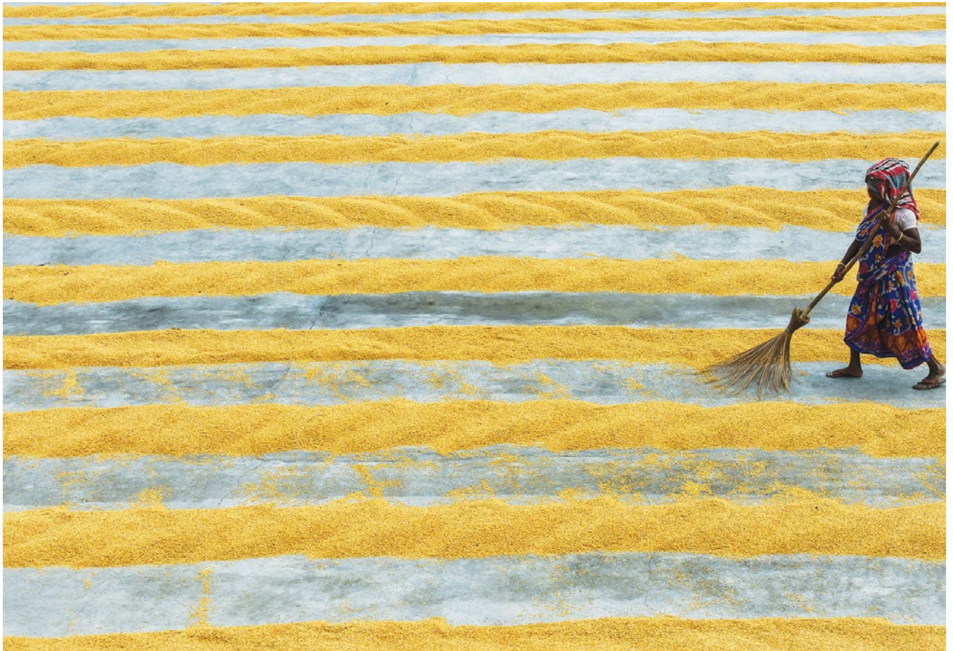
Harvesters dry rice grains in the sun at a rice mill outside Kolkata.