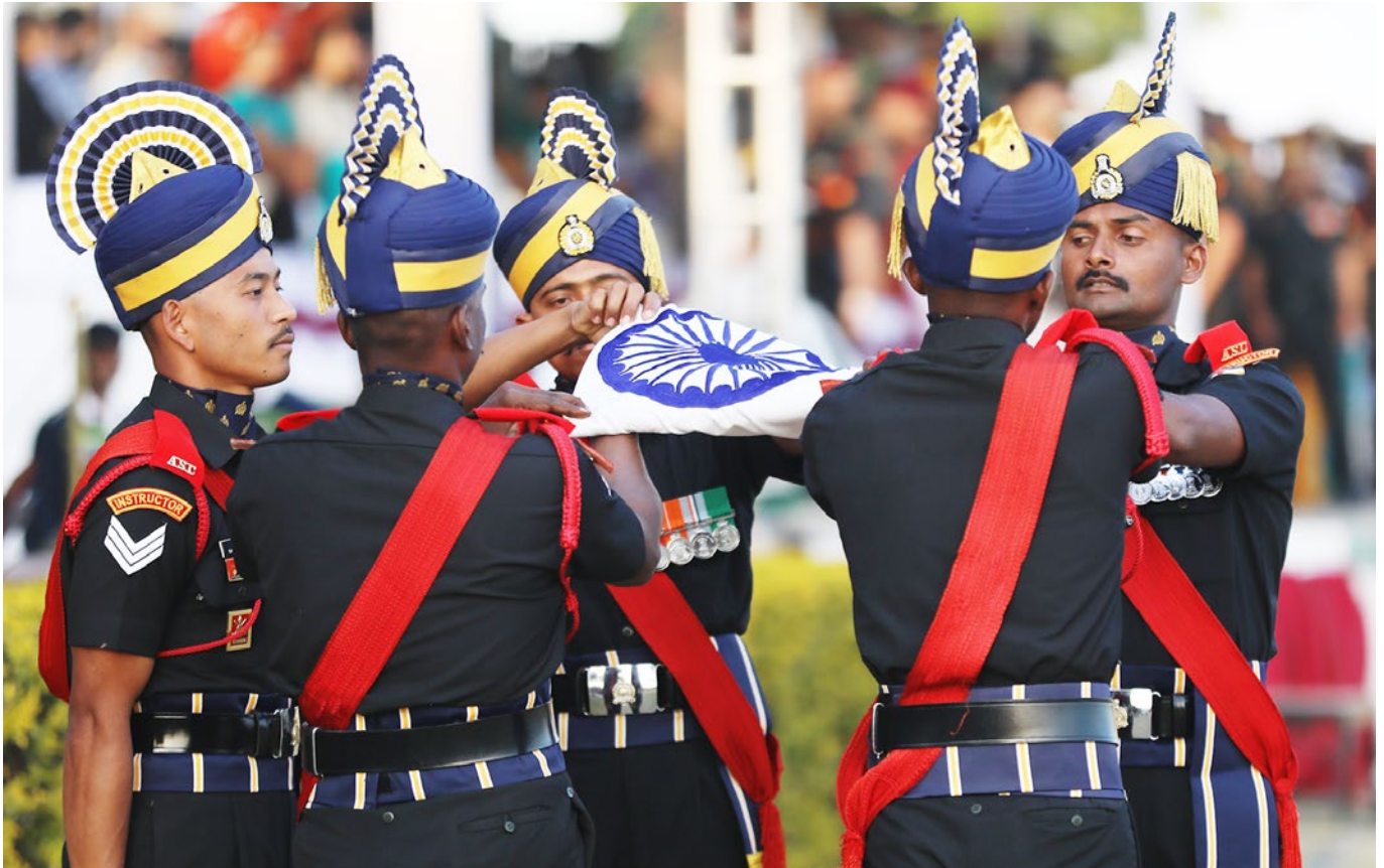
Indian Army personnel perform the Ceremony of Beating Retreat at Army Day celebrations in Bengaluru, Karnataka (January 2023).