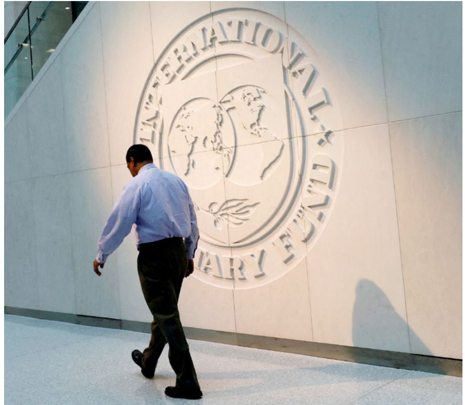
A man walks past the IMF logo at its headquarters in Washington DC.

These dynamics play out in the international development financing domain. To explain China's engagement in debt restructuring, the outlooks and interests of China's mammoth policy banks, the Export–Import Bank of China (Exim Bank) and the CDB, are particularly important. These banks are responsible for nearly all of China's non-concessional sovereign loans, which make up the vast bulk of its overseas lending. While broadly committed to supporting the international expansion of Chinese business and the party leadership's policy goals, these banks' overall