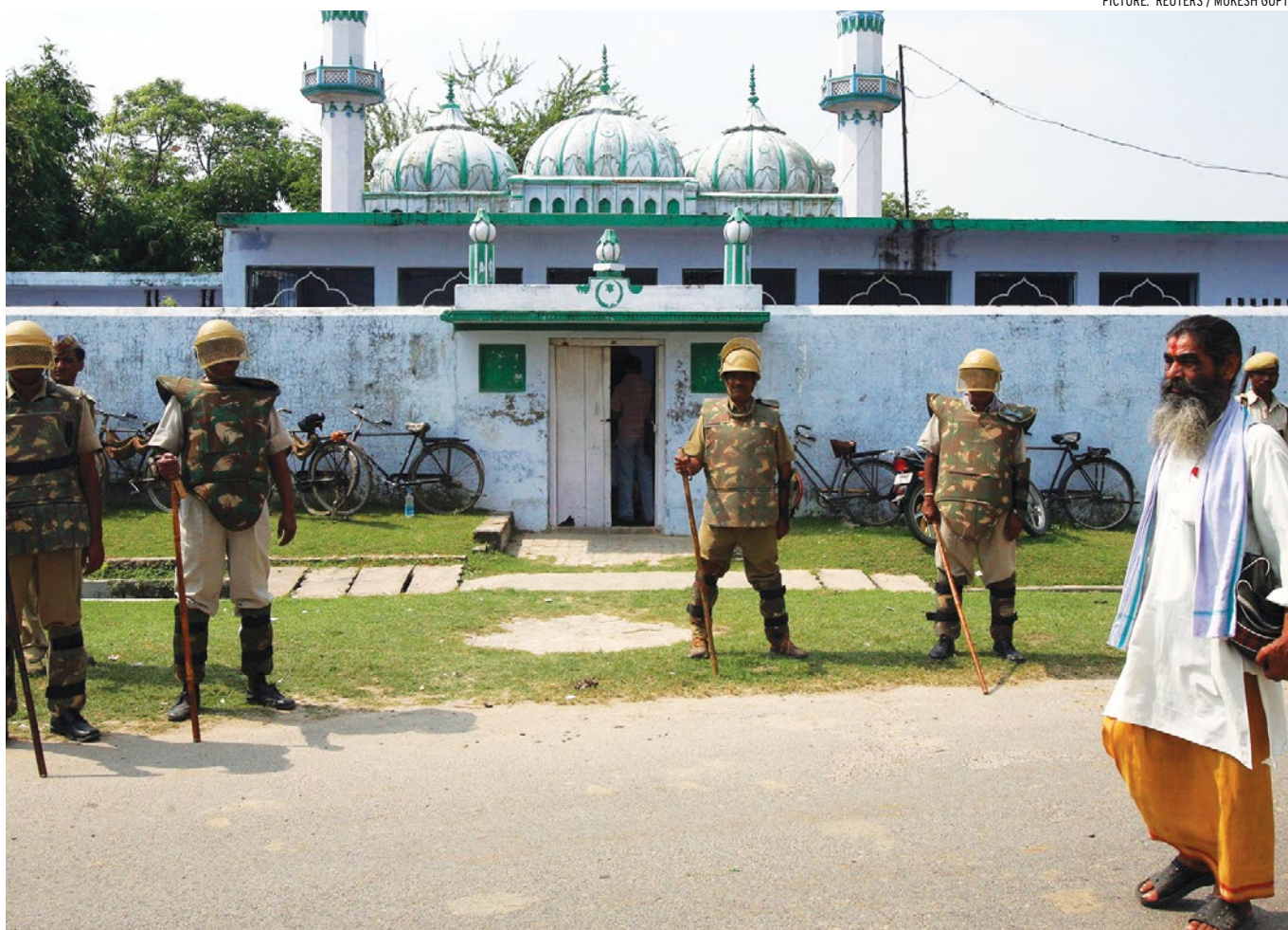
A Hindu priest walks past paramilitary troopers guarding a mosque as Muslims offer Friday prayers in the northern Indian town of Ayodhya (October 2010).