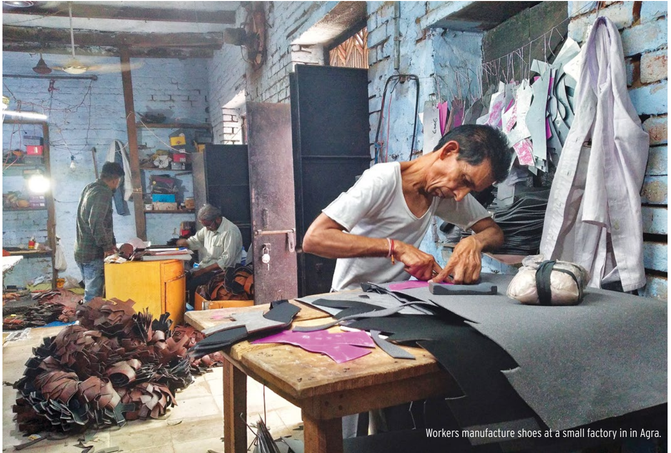
Workers manufacture shoes at a small factory in Agra.