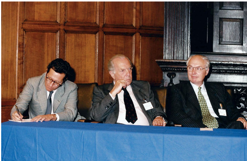
Figure 17: At the Fiftieth Anniversary Conference of the IISS, Oxford, 1998.