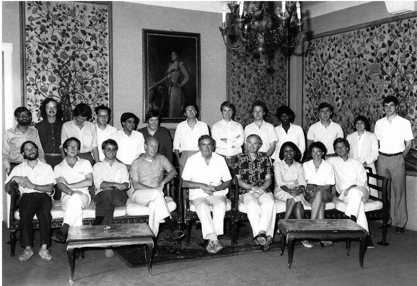
Figure 6: IISS/ACA 'New Faces' Conference, Bellagio, Italy, July 1984.