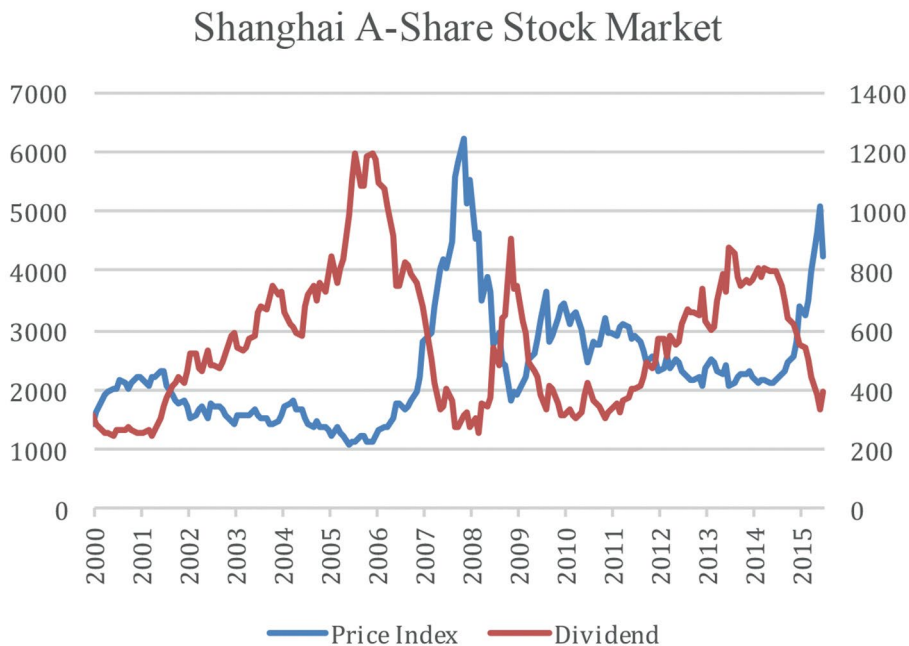
Figure 11.1 Time series of the price index (left axis) and dividend yield (right axis) of the Shanghai A-share stock market

The empirical data employed are the price index of the Shanghai A-share stock market and the dividend yield of the 1,061 listed companies in the Shanghai A-share stock market. The frequency of our data is monthly. Before 2000, most companies listed on the Shanghai A-share stock market did not pay out dividends, so these data are unavailable. Hence, the sample period starts from January 2000 to July 2015. Specifically, the monthly dividend yield time series of the Shanghai A-share stock market is calculated by summing the dividend yields of 1,061 listed companies. Then, the price–dividend ratio time series is calculated to reflect the relationship between the asset price and market fundamentals. All data are downloaded from Datastream .