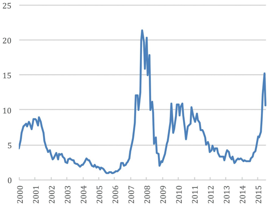
Figure 11.2 Price-dividend ratio of the Shanghai A-share market

period of relatively stable fluctuation for six years, and began to enter another period of rapid increase in October 2014. The red line represents the dividend yield and shows a pattern that is generally opposite to that of the blue line. When the stock price increases, the dividend yield decreases, and vice versa.