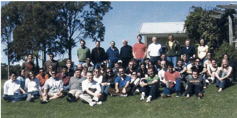
Plate 42 SDSC staff with the GSSD students, Kioloa, April 2006