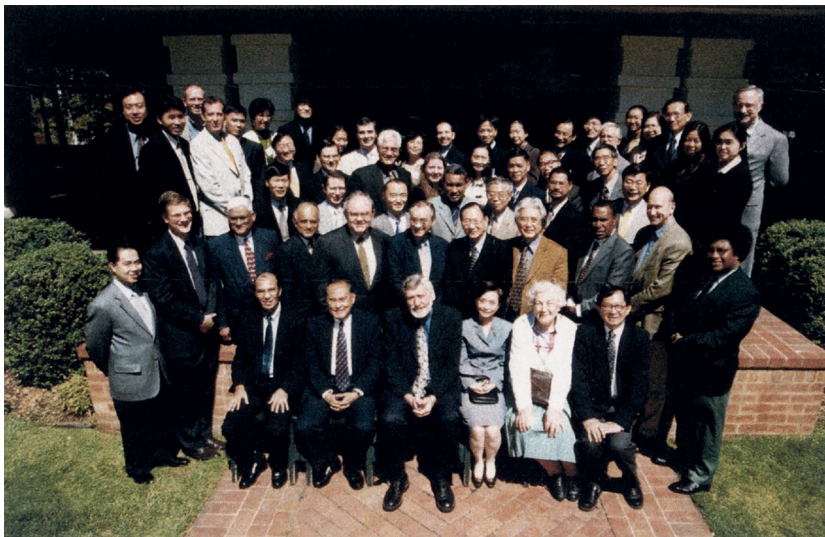
Plate 33 16th Council for Security Cooperation in the Asia Pacific (CSCAP) Steering Committee meeting, Canberra, December 2001