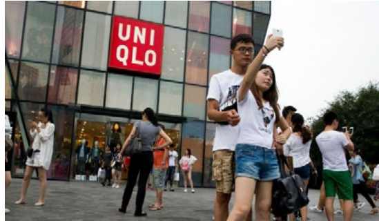
Uniqlo in Beijing’s Sanlitun Shopping Village, where a couple filmed themselves having sex in one of its changing rooms

its latest ‘anti-porn’ campaign. (Only three months later, a couple uploaded a video of themselves having sex in a changing room in a branch of popular clothing chain Uniqlo in Beijing’s Sanlitun Shopping Village: by the following day, some 2.5 million searches and posts made the amateur porn video the top-trending item on WeChat.) In June, the censors proscribed thirty-eight Japanese anime including titles such as High School of the Dead and Psycho Pass as well as others with anti-authoritarian themes. The following month, the authorities cancelled a Shanghai concert by the American band Maroon 5, reportedly because one of the band members had tweeted a happy birthday message to the Dalai Lama. In August, the Ministry of Culture banned 120 songs from the Internet on grounds of promoting obscenity, violence, crime or harm to social morality, including Taiwan pop singer Chang Csun Yuk’s 张震岳 comedic ‘Fart’. In September, it axed Bon Jovi’s September tour to Beijing and Shanghai—five years earlier, Bon Jovi had displayed the Dalai Lama’s picture while playing in Taiwan. Taylor Swift, scheduled to visit China as part of a global tour in November, gave the authorities a