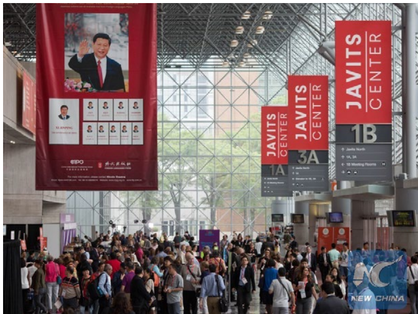
BookExpo America, June 2015