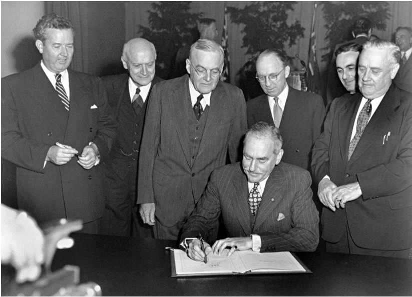
US Secretary of State Dean Acheson signing the ANZUS Treaty in San Francisco, 1 September 1951, watched by John Foster Dulles (left), who would succeed Acheson from 1953 to 1959

Source: National Archives of Australia, A13307, 50/1