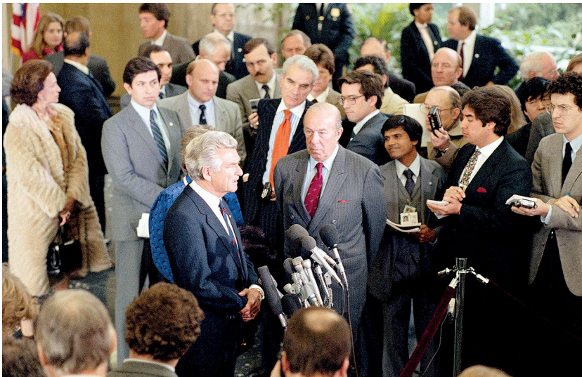
Australian Prime Minister Bob Hawke speaks at a press conference in Washington DC, in 1985, watched by US Secretary of State George Shultz