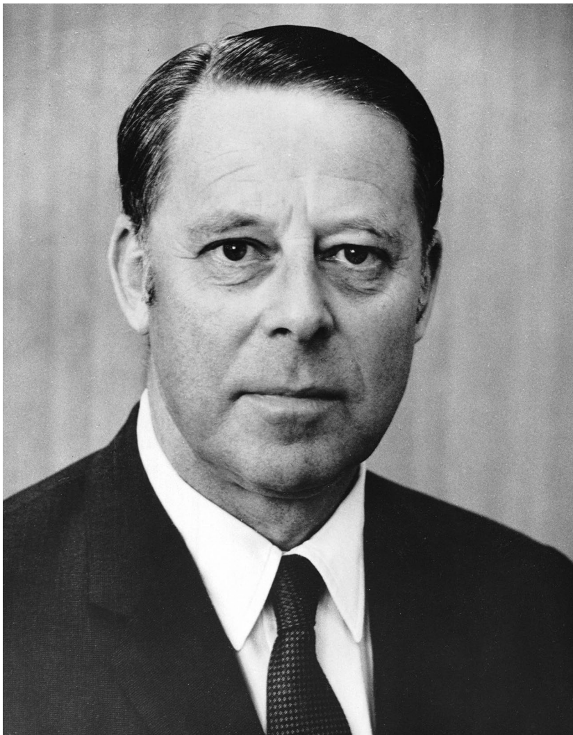
Sir Patrick Shaw, Australian Ambassador to the United States from 1974 to 1975, pictured in 1960