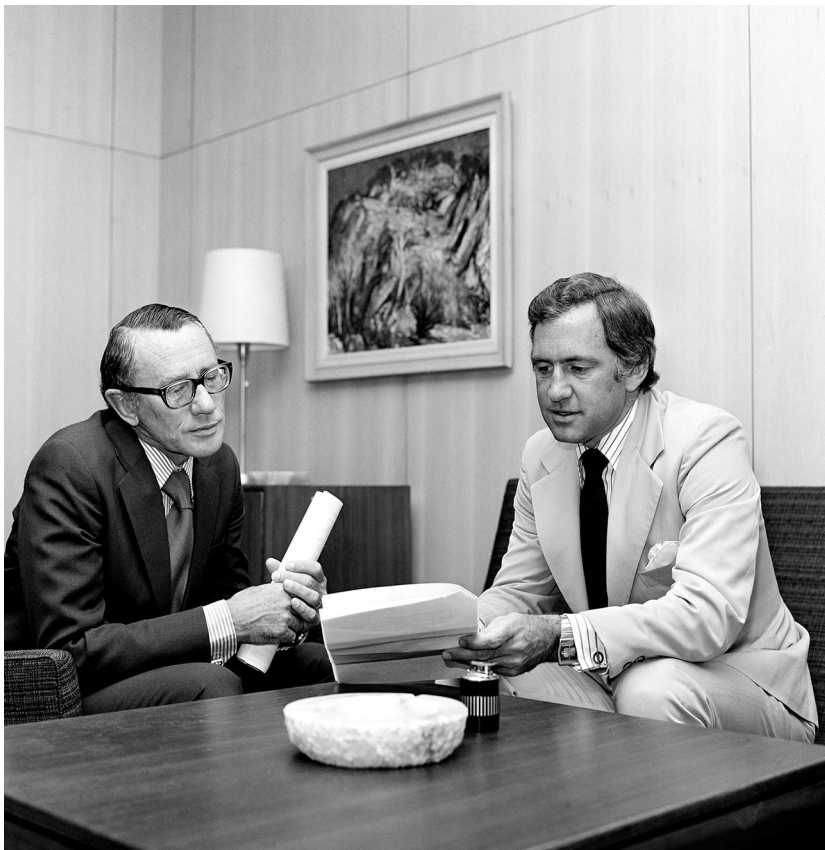
Alan Renouf, Secretary, Department of Foreign Affairs, talking with Australian Minister for Foreign Affairs Andrew Peacock in January 1976, a year before Renouf's appointment as Ambassador to the United States