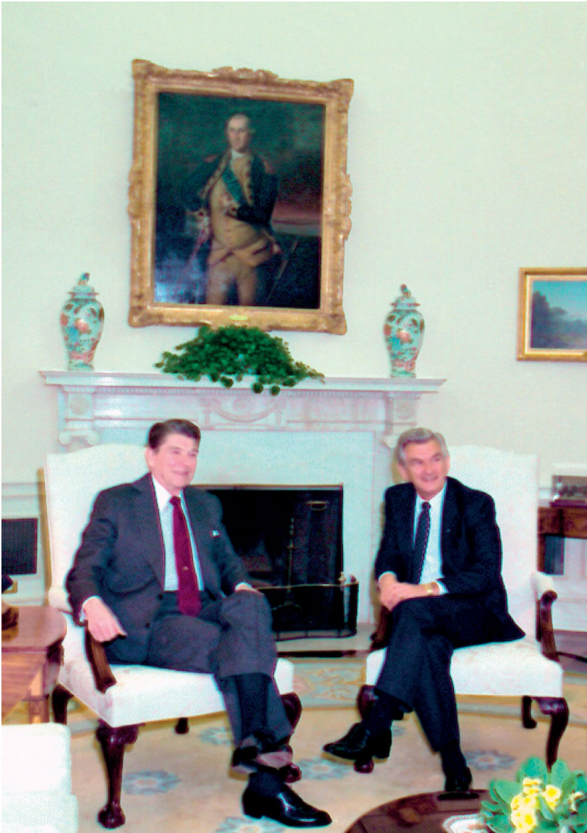
US President Ronald Reagan and Australian Prime Minister Bob Hawke at the White House, during Hawke's visit to the USA in 1986