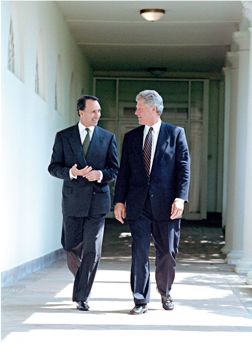
Australian Prime Minister Paul Keating and US President Bill Clinton in 1993