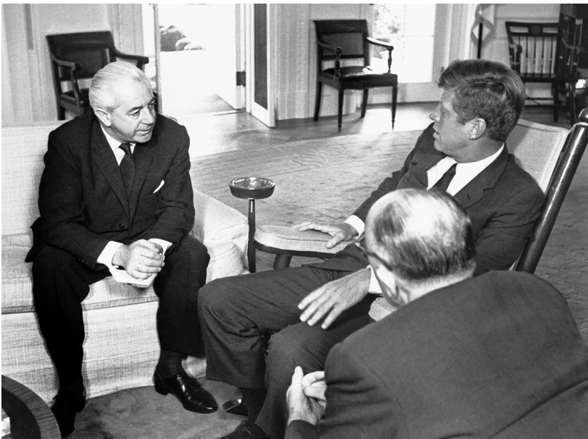
Australian Treasurer Harold Holt with US President John F Kennedy, 5 July 1963

Source: National Archives of Australia, M151, 51