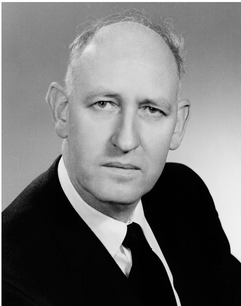
Sir James Plimsoll, Australian Ambassador to the United States from 1970 to 1973, pictured in 1965