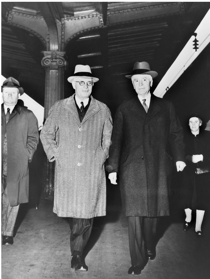
Australian Prime Minister John Curtin with US Secretary of State Cordell Hull, Washington DC, 1944 (Elsie Curtin in background)