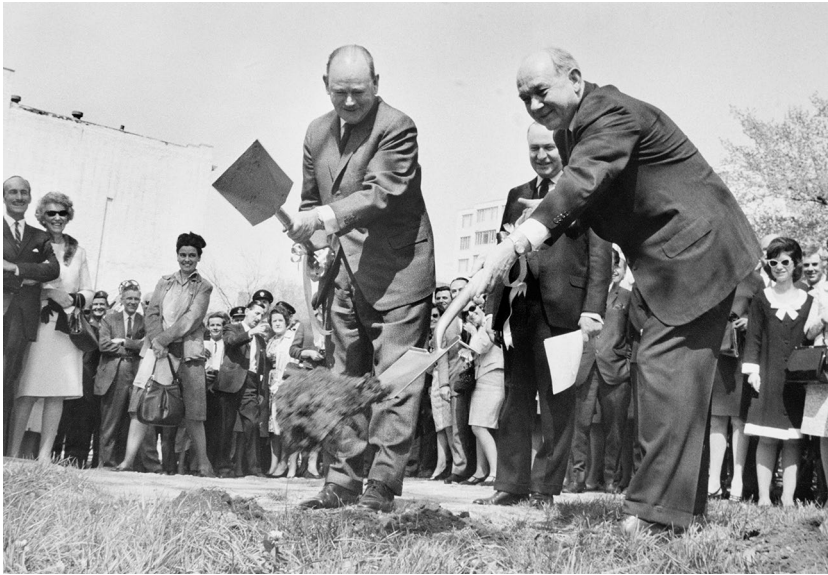
Australian Minister for External Affairs Paul Hasluck and US Secretary of State Dean Rusk break ground for the new Australian Chancery in Washington, 1967