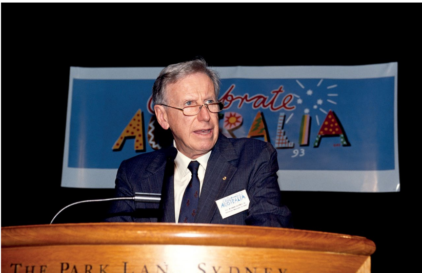
Rawdon Dalrymple, Australian Ambassador to the United States from 1985 to 1989, speaking in 1993