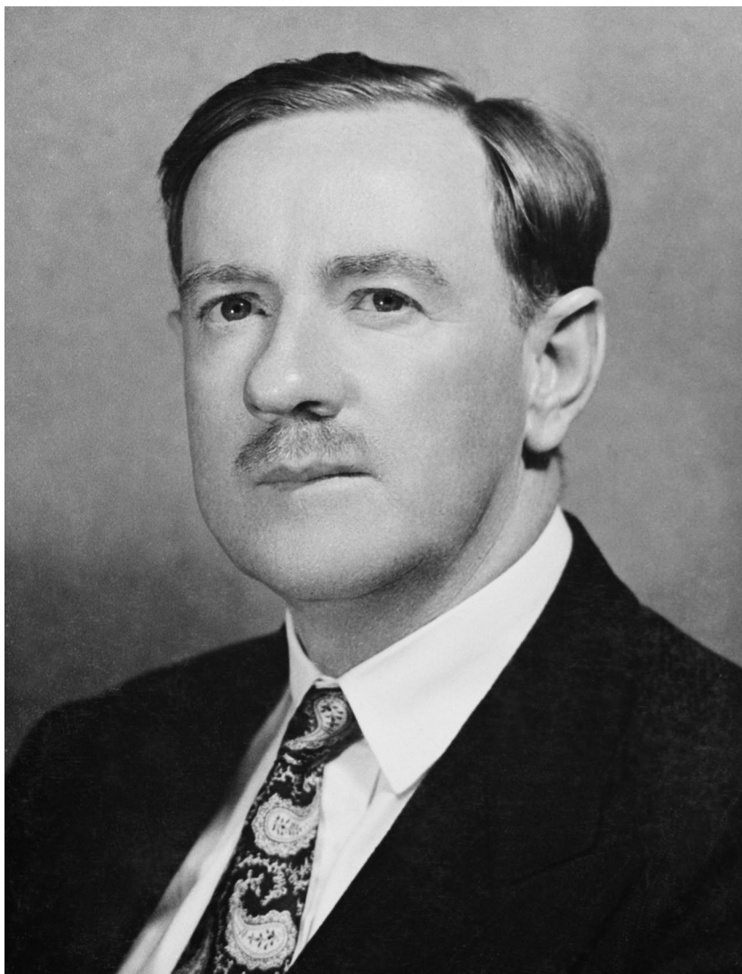
Percy Spender, Australian Minister for External Affairs, in 1949, two years before being appointed Ambassador to the United States