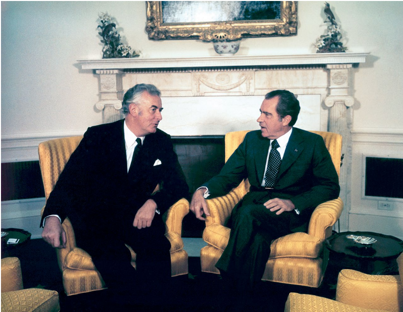
Australian Prime Minister Edward Gough Whitlam and US President Richard Nixon, Washington DC, 30 July 1973