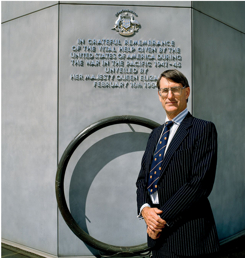
Australian Ambassador to the United States Michael Cook in 1989