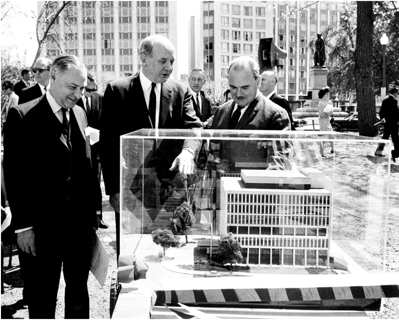
From left: Australian Ambassador to the United States, Keith Waller, US Secretary of State Dean Rusk and Australian Minister for External Affairs Paul Hasluck at the breaking of ground ceremony for the Australian Chancery in Washington, 1967