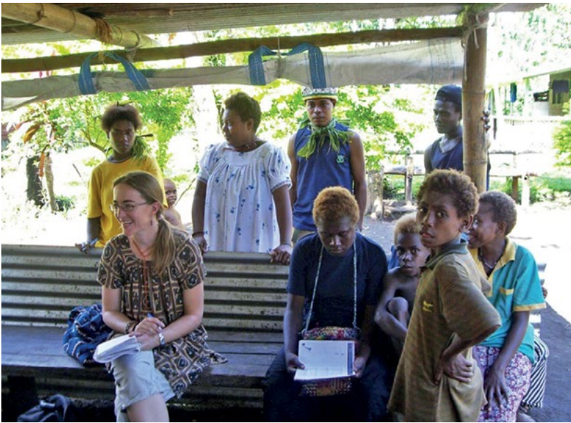
Figure 8. Young people engaging with the documentation while the author collects comments