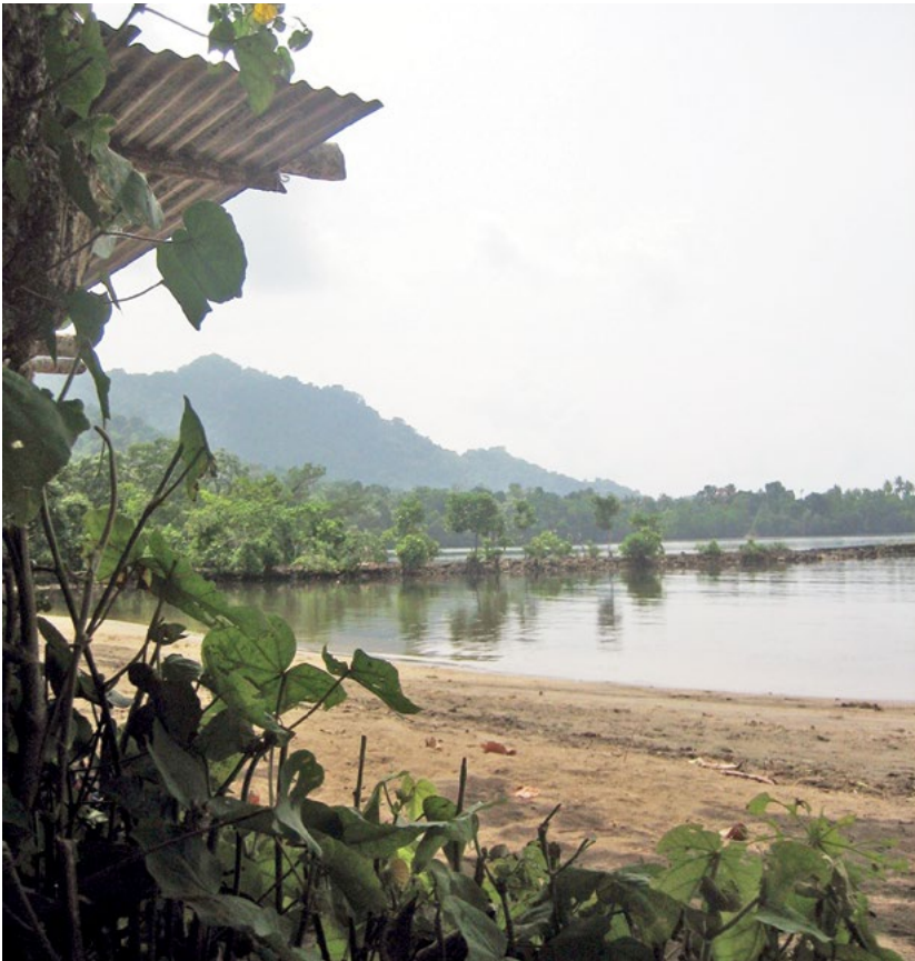
Figure 1. The shore of Leo (Aniolum, Lihir), the area where Schlaginhaufen arrived in 1908

In 1907, Otto Schlaginhaufen left Germany with the Deutsche Marine-Expedition (Germany Navy Expedition), one of their destinations being the islands of the Bismarck Archipelago, off the northeast coast of the mainland of Papua New Guinea. By 1908 they had reached Leo, Lihir, a quiet little bay in the south of Aniolum, the southernmost island in the group (Figure 1). 2