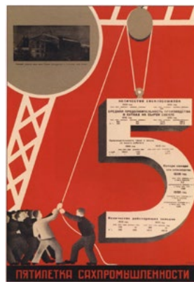
Soviet five-year plan propaganda

Five years was considered long enough to allow for the construction of factories and other infrastructure, and to average out good and bad harvests in the agricultural cycle. At the same time, it was not so long as to endanger the state's capacity to steer the economy through unexpected turbulence, adjust targets as necessary, and introduce corrections to the structural aspects of economic development — in other words, to adapt flexibly to changing circumstances. Despite the shortening of production cycles in more recent times, the ancient Roman concept of lustrum (the five years between censuses) still holds its ground today as the ideal planning period. Mikhail Gorbachev oversaw the preparation of the USSR's Twelfth and Thirteenth Five-Year Plans, although the latter was rendered irrelevant by the demise of the USSR in 1991.