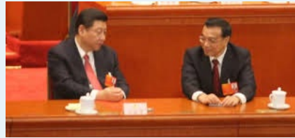
Xi Jinping (L) and Li Keqiang (R)

Business as usual would see Li confirmed for an additional five-year term as premier at 2017's National Party Congress, and serve until his retirement in 2022. But speculation is rife that Li may be the first premier ousted from the role since Deng Xiaoping saw off Hua Guofeng 华国锋 in 1980. A major Party conclave in October indicated that rules around retirement age might be eased at the 2017 Party Congress, thus paving the way for sixty-nine-year-old Wang Qishan 王岐山, a key Xi ally and head of the formidable Central Commission for Discipline Inspection, to step into Li's role rather than step down into retirement. 11