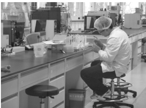
Chinese investment in R&D has reached two percent of GDP

The state still also directly controls education, and funds most academic and scientific research. Through these means it is increasingly betting on the creation of an ideas- and innovation-based economy. Investment in research and development (R&D) has grown steadily, even if there is not yet a concomitant increase in high-quality patents. A recent article in the journal Nature 7 showed that despite Chinese investment in R&D already reaching two percent of GDP (higher than that of the European Union and behind only the US), only five percent of that investment goes to basic science, compared to experimental and applied research. Also, while the total number of researchers in China surpasses that of the US and is second only to the total of the twenty-eight EU countries, in per capita terms China still has only two researchers per thousand people, versus eight in the US. Its scientific publications, while gaining influence in the last decade, are still under the world average in terms of impact (measured in the frequency of citations of scientific articles in a particular year).