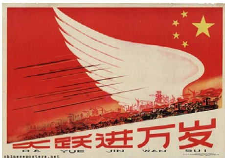
Long live the Great Leap Forward

As it does with all of its major, central documents, the Party-state has woven a powerful and unequivocal narrative through the pages of this