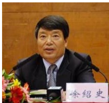
Xu Zhaoshi, incumbent Chairman of the NDRC

The NDRC’s army of researchers typically consults with academics and scientists for two years before drafting the national blueprint. It also