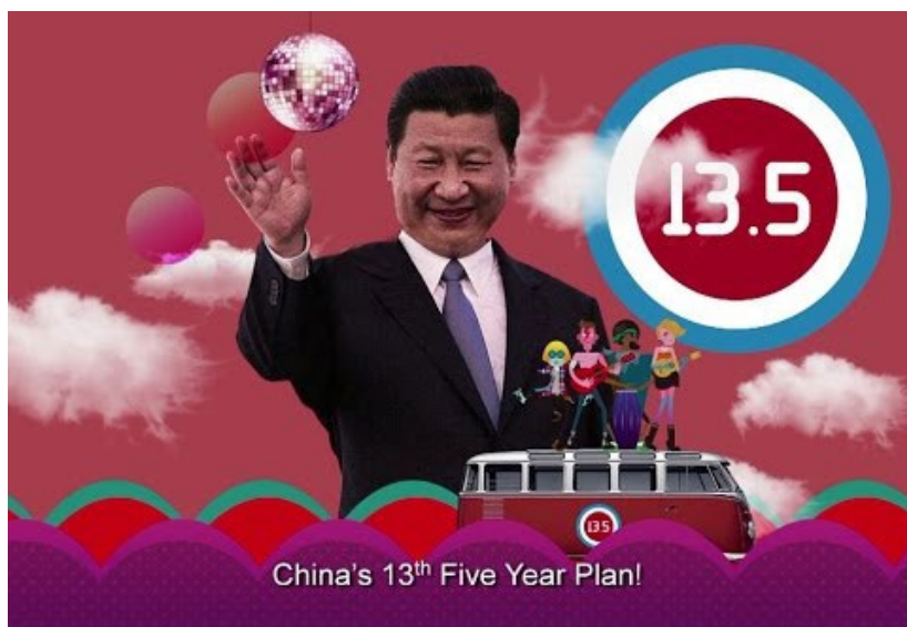
A still from the animated musical video explaining the Thirteenth Five-Year Plan

China shows no sign of abandoning the practice of five-year plans. In recent years, however, the nature of the plans has changed along with China's evolving economy. Earlier plans provided rigid targets for a developing economy dominated by agriculture and industry — one which, with the nationalisation of industry in 1956 and the collectivisation of the agriculture around the same time, had become the responsibility of the state alone. With the end of the Maoist era, the expansion of the market economy, the growth of consumer and services sectors, and the opening