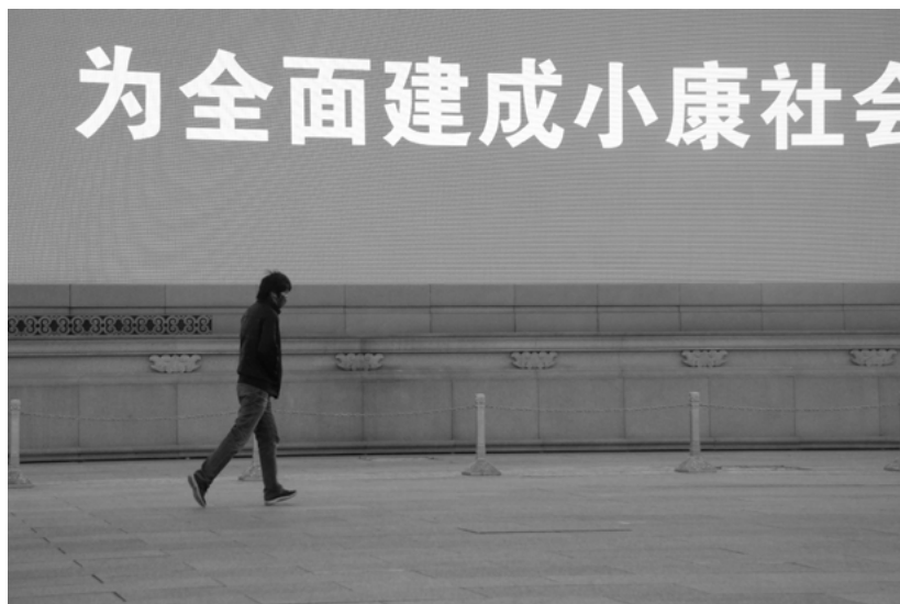
Electronic billboard, Tiananmen Square: 'Build a moderately wealthy society for all'

While the latest Five-Year Plan promises universities greater autonomy and internationalisation, it also allows the government to prioritise scientific disciplines or institutions in parts of the country that struggle to produce, retain, and attract academic talent, such as some of the central and western provinces. But a top-down approach to funding has proven less efficient than innovation that comes from the grassroots. The risk remains that where a notoriously inefficient and predatory bureaucratic system is in charge of directing research funding, the money will not go to the most interesting, effective or innovative projects.