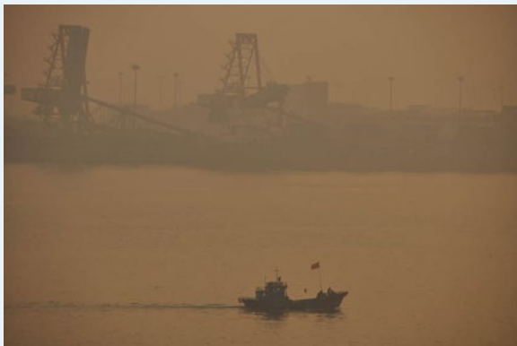
Air pollution at Tianjin port

5. Poverty reduction: One of the few non-environment related mandatory quotas in the Plan is for poverty reduction. Building on the momentum of the Twelfth Five-Year Plan the government intends to raise 55.75 million people out of poverty by 2020. The Chinese government defines rural poverty as living on less than 2,300 renminbi a year (or 6.3 renminbi per day). That is still less than the World's Bank's global poverty standard of US$1.25 a day. 6