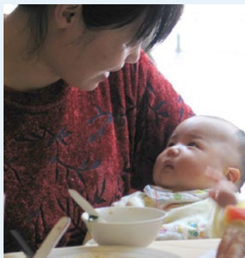
A yuesao looking after her ward