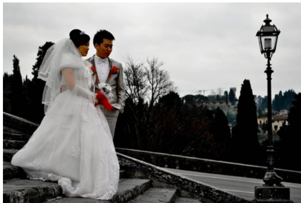
Will it become increasingly difficult for Chinese men to find a wife?