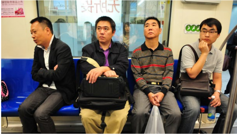
China's unbalanced sex ratio: 106 males to 100 females