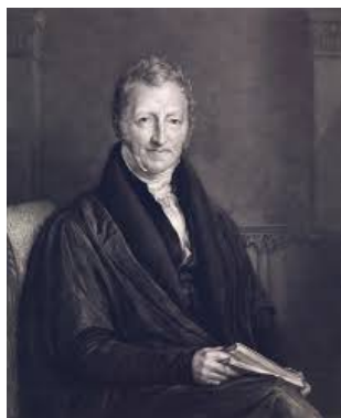
Thomas Malthus

China's exceptional economic growth performance over the last four decades has coincided with equally remarkable demographic change. There is now plenty of evidence to suggest that the potential demographic 'dividend', 'gift' or 'bonus' associated with a country's demographic transition towards slower fertility and population growth, and, therefore, a growing share of the population engaged in — rather than depending on — the workforce, can be substantial. In China's case, according to some estimates, this demographic dividend can explain as much as one quarter of its per capita income growth since the 1980s. As the world's fastest growing economy during this period, this has amounted to a substantial gift indeed.