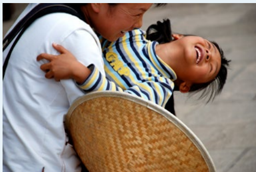
Mother and daughter

According to the National Health and Family Planning Commission 国家卫生和计划生育委员会, the amendment to the Law of the People's Republic of China on Population and Family Planning 中华人民共和国人口与计划生育法 encouraging married couples to have two children rather than one child will allow an additional ninety million couples in China to have a second child. Of these prospective parents, sixty percent are estimated to be older than thirty-five years, and fully half over forty. This has raised questions about how effective this policy shift will be in boosting China's fertility rate. It also raises questions about the impact it will have on the health and status of Chinese women in general and older women in particular.