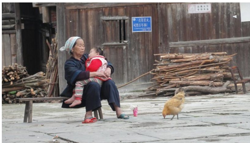
Little is likely to change in rural China

that the share of the working population will continue to rise — whether the fertility rate is high or low.