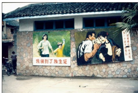
One-Child Policy propaganda

Even more consequential is the contribution of the One-Child Policy to the rapid rise in gender imbalances in China in favour of males. 7 Other immeasurable costs result from the emotional fallout from not being allowed to determine the size of your family, forced abortions, and penalties for having an unauthorised second child, including their inability to enrol in school or to access the health care system.