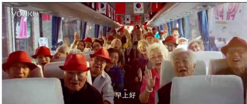
Still from the promotional trailer for My War