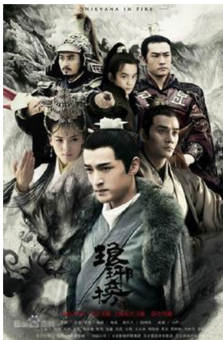
Nirvana in Fire

The introduction of new markets is good news for the Chinese television industry. As the Global Times reported in September, there is so much over-production of television drama in China that of 15,000–19,000 episodes filmed over