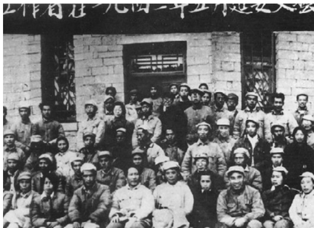
Mao Zedong (sixth from right in the first row) at the Yan'an Forum on Literature and Art

Yet ever since Deng Xiaoping introduced market-based reforms, beginning in the 1980s and accelerating in the 1990s, the Party has been slashing the subsidies that once made every theatre and film studio a state enterprise and every artist and writer a state employee. The introduction of market forces into the cultural economy had the unintended effect of limiting the Party's ability to force art to serve as a conduit for propaganda. It also enabled the growth of independent theatre, and commercial and artistic filmmaking, as well as the contemporary art scene. This hasn't ended the Party's attempts to control the direction of culture, including through censorship, but it has limited its efficacy. Over the years, a de facto compromise was reached: the Party implicitly acknowledged that not all artistic practice had to serve ideology, while those working in the arts understood that they were not to directly challenge it either. But Xi appears determined to put the arts under control once more.