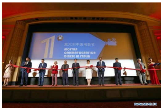
First Chinese film festival in Milan