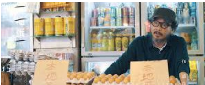
Still from the film Ten Years

By the time Chan Tsz-woon's 陳梓桓 documentary on Hong Kong's pro-democracy Umbrella Movement, Yellowing 亂世備忘, premiered in Hong Kong in September, it was unable to get any commercial distribution and screened only at 'guerrilla screenings'. Even the Asia Society cancelled a planned screening, saying that it was a 'non-partisan' organisation and only pro-democracy speakers had accepted invitations to speak at an as-