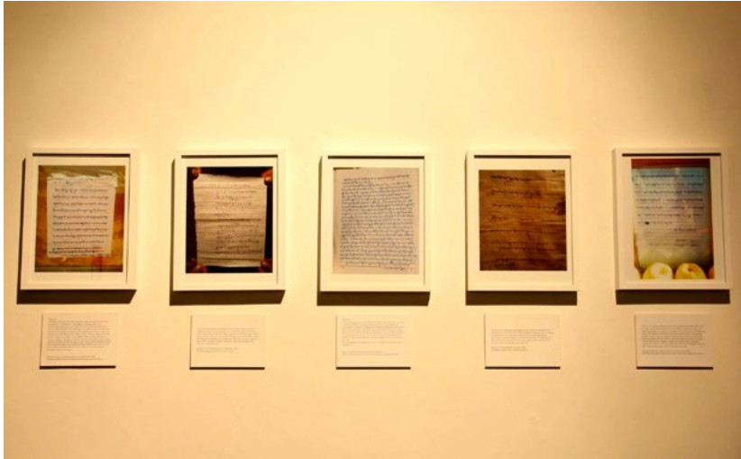
The artwork Last Words