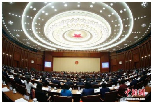
The Film Industry Promotion Law was passed in November 2016

In November 2016, the National People's Congress passed a new law to regulate China's film industry. The Film Industry Promotion Law 电影产业促进法 is China's first 'film law', and it proscribes the fraudulent reporting of box office takings