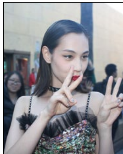
Kiko Mizuhara

The contest was a joke, but had it been real, it would conceivably have no lack of future contestants, especially as the careers of filmmakers, actors, singers, and other artists from the greater Chinese world become ever more dependent on the mainland market. A subsequent report in the Hong Kong tabloid Apple Daily 苹果日报 claimed that the Chinese government was forcing actors and other performers to pledge not to undermine the ‘one China’ policy before being allowed to work in the mainland. The panic stirred by the report was such that the State Council’s Taiwan Affairs Office felt compelled to issue a formal statement of denial.