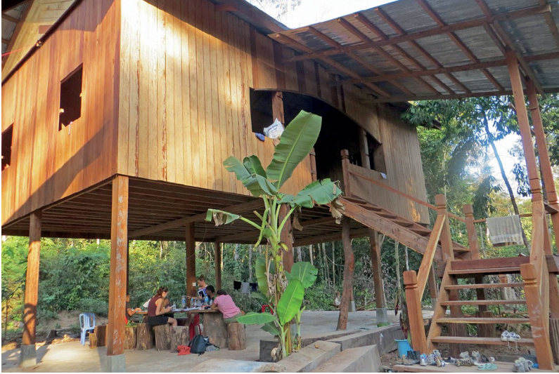
Figure 1: Raised student share house at Veun Sai-Siem Pang Conservation Area base camp with open-air study area below