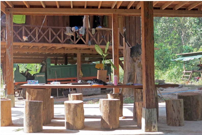
Figure 2: Student study space at Veun Sai-Siem Pang Conservation Area