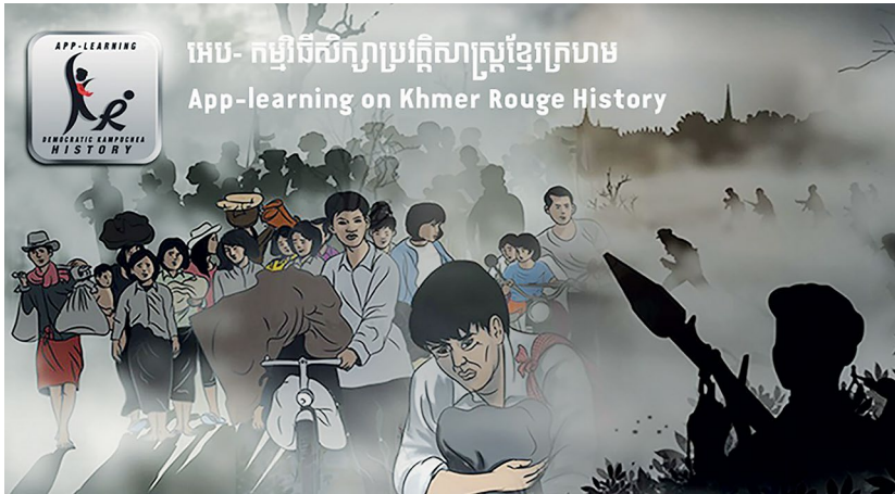
Figure 5.4: Website image advertising the KR-app.