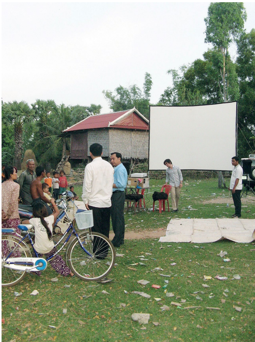
Figure 5.1: Bophana technicians and PAS staff setting up for an outdoor ECCC Memory Night in Kompong Chhnang, Cambodia.

events, including gender-based and sexual violence in the form of forced marriage, are remembered or uncovered in the films as these women participate in cases before the ECCC.