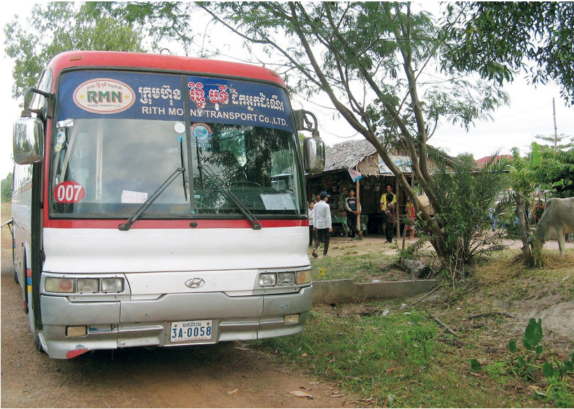
Figure 5.2: Free ECCC outreach bus taking villagers from Kompong Chhnang to Phnom Penh.