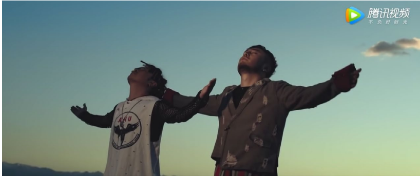
Still from the music video, 'Fly', by ANU

and dance; they raise their fists in the air as they crest a mountain, the city lights glowing below them. Importantly, we see a city that is at once unashamedly modern and exciting and also Tibetan. Stupas and prayer flags perch above the metropolis, where Tibetans have tattoos featuring traditional iconography such as the Buddhist 'endless knot' and breakdance to Tibetan hip hop in nightclubs.