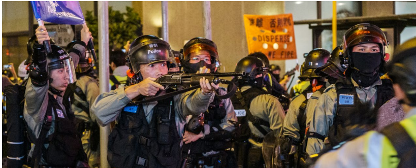
Hong Kong police at protests