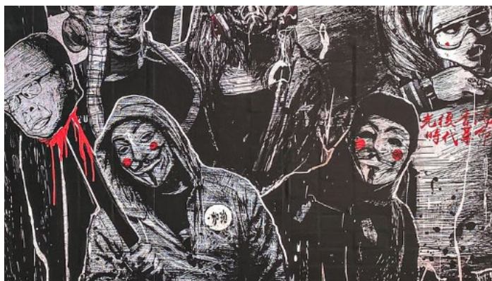
A poster inspired by V for Vendetta

The CCP’s identification of protestors as antagonists with links to ‘hostile forces’ gives local authorities limited political space to show tolerance toward protestors. Sympathizers risk being accused of disloyalty. It also discourages local officials from experimenting with conflict-sensitive social and economic policies lest they be accused of stoking Tibetan ethnic consciousness or nationalism. This has also resulted in decreased cooperation between local governments and local and international NGOs [nongovernmental organisations], further limiting the space for public debate and policy influence. 3