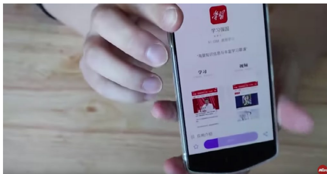
The 'Study Xi-Strong Nation' app

Yet in the wake of a humiliating defeat for pro-Beijing candidates in Hong Kong's district elections, which left pro-democracy candidates controlling seventeen of Hong Kong's eighteen district councils, Beijing is more likely to favour rectification over concessions.