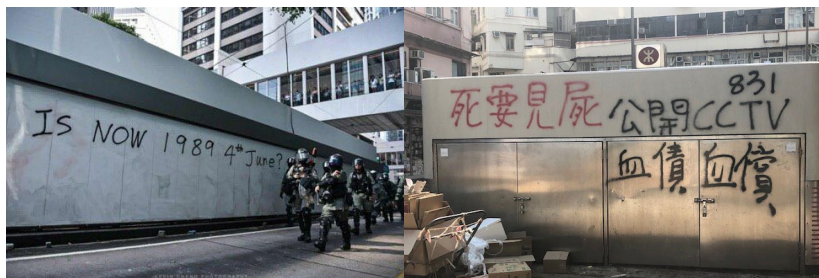
'Is now 1989 4th June?' and 'Blood Debts will be Repaid in Blood' graffitis