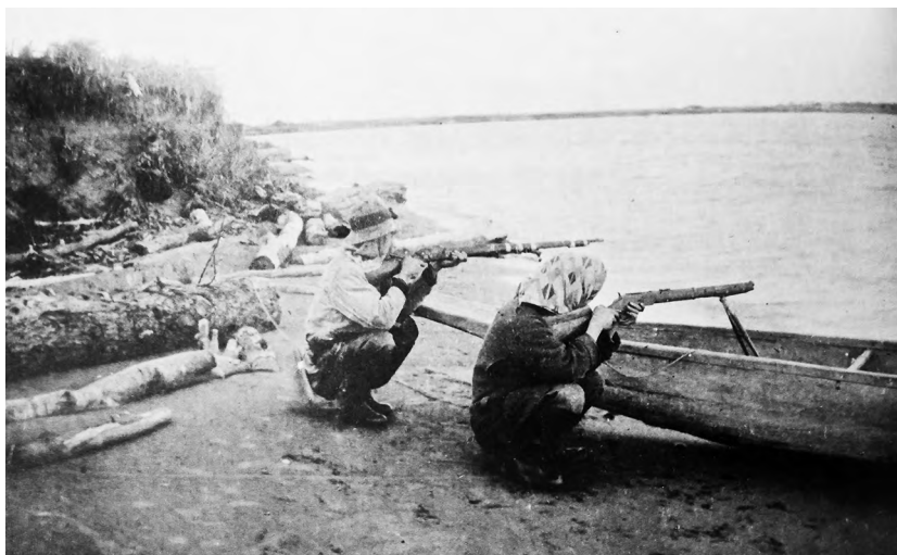
Figure 7.6. Indigenous people hunting marine mammals near Otasu.

a job with Shisuka city administration, who employed him as a ferry-boat ticket collector and as a clerk before promoting him to captain the ferry between Shisuka and Otasu. 64