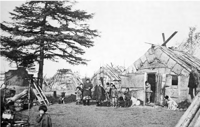
Figure 7.1. Traditional Uilta summer houses on the outskirts of Otsu.

Otsu was not a 'traditional' indigenous village, but a unique colonial artefact. That fact itself, together with the village's location and history, made it a particularly revealing embodiment of some important facets of colonial policy. Here I want to consider how the design of the village represented the structures and aims of imperial rule, but also the ways in which that design was experienced and reinterpreted both by people who visited Otsu and by the people who lived there. For a village or an urban district can never be seen as a whole, it is always viewed from specific standpoints, even though those standpoints change as the viewer moves on his or her trajectory through the landscape. It is the multiple visions that various individuals had of Otsu, as much as the village's physical design itself, that reveal the complexities of Japanese colonial rule over the indigenous people of Karafuto, and of the indigenous experience and reinterpretation of 'modernity'.