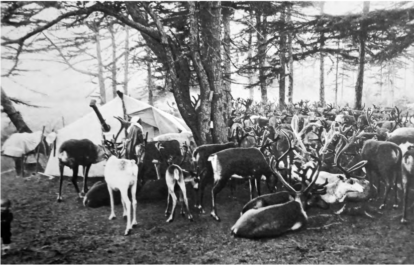
Figure 7.4. A reindeer herd near Otasu.