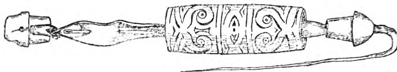
Figure 7.7. Uilta needle case, early twentieth century.

steel sewing needles. The traveller Charles Hawes, who visited a Uilta community at Chaivo on the east coast of Sakhalin at the beginning of the twentieth century, described how metal needles were treasured, carefully stored in special needle cases made of ornamentally carved bone, and passed down from one generation to the next as heirlooms. 67