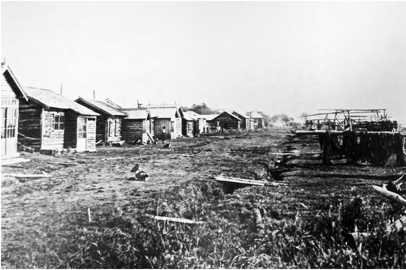
Figure 7.3. Colonial modern housing in Otasu.