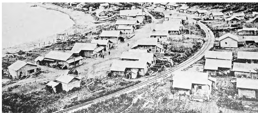
Figure 7.2. The Ainu ‘model’ village of Torandomari.

One result of this resettlement was the creation of a sharper division between Ainu and other indigenous groups in the colony. Early colonial surveys had commented on the close contacts and frequency of intermarriage between different peoples, and nineteenth-century accounts suggest that a number of hamlets on the central parts of the Sakhalin coast had mixed populations of Ainu, Uilta and Nivkh; but the drawing of the frontier and the resettlement of populations made such interactions increasingly difficult. The forced movements of Karafuto Ainu population in some cases aroused bitter protests. One important cause of distress was the fact that relocation removed people from the places where their relatives and ancestors were buried. 21 The resettlement policy did, however, provide the colonial authorities with an opportunity to superimpose their vision of civilisation and order on indigenous life.