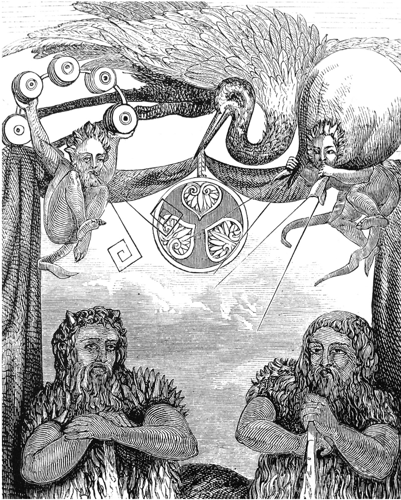
Figure 8.1. Illustration from Charles MacFarlane's Japan .

Source: Charles MacFarlane, Japan: An Account Geographical and Historical (London: George Routledge and Co., 1852).