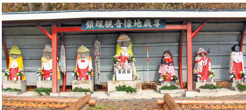
Figure 8.3. Memorial for convict labourers near Abashiri.