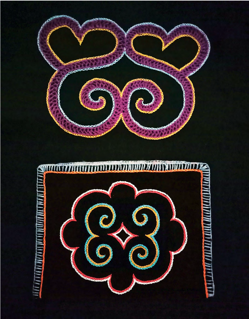
Figure 8.5. Uilta embroidery: (above) by Kitagawa Aiko's Japanese students; (below) by Kitagawa Aiko.