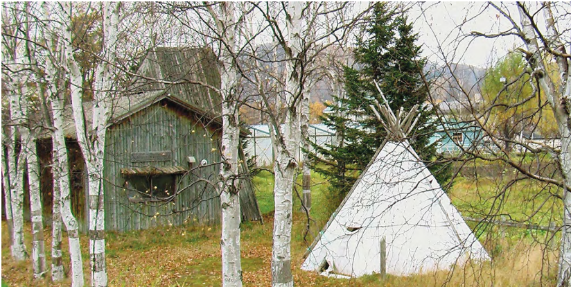
Figure 8.4. The Jakka Duxuni, Abashiri, 2011.