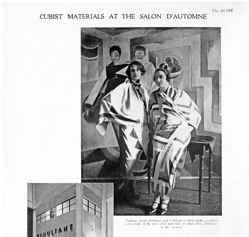
Figure 3: 'Cubist Materials at the Salon d'Automne', Home , February 1925, 24.

The Home's art critics were often conservative in their tastes, denigrating women's art as decorative and privileging the more stereotypically 'masculine' landscape genre. 47 In 1926, the Home reproduced Elioth Gruner's 'Serpentine Hill' and extolled him as 'one of Australia's foremost landscape painters'. 48 By way of contrast, when the Home reported on Sonia Delaunay's cubist fabrics shown at the 1925 Paris 'Exposition des Arts Décoratifs', the magazine paid more attention to the 'feminine' and decorative qualities of the fabric than to their innovative Orphic cubist design. 49 While Helen Topliss has argued that this focus on Delaunay's work is a positive example of the Home's promotion of artistic modernism,