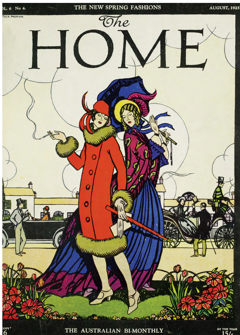
Figure 1: Thea Proctor, Cover Design, Home , August 1925.