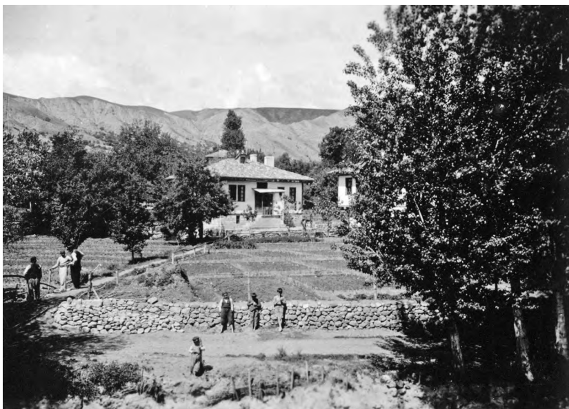
The house in Çankiri Village, Turkey, in which Helga was born.