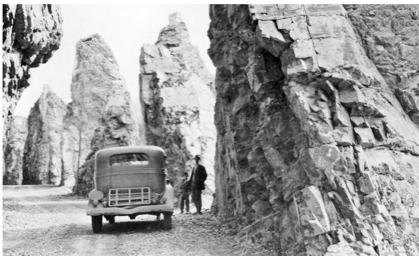
Cliffs by the road outside Karind, Iran, July 1941.