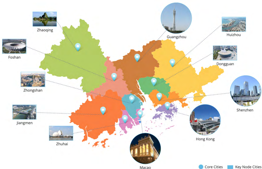
Map of the Greater Bay Area. Hong Kong Constitutional and Mainland Affairs Bureau.

officially decommissioned in 2010 (O'Donnell and Wan 2017: 44). In some ways, Shenzhen residents who had long been able to use the Hong Kong–China border to their advantage could now benefit from their position between the international border and the internal ‘second line’. The Shajing oystermen, for example, sold their wares on the Hong Kong side and purchased electronics and other manufactured goods, to be resold in Shenzhen and onwards to Dongguan and Guangzhou. With access to boats, navigational skills, and familial networks, they moved everything from electric wire to waterpipes, and bricks to concrete, when first Shenzhen and then the Pearl River Delta was ‘one big construction site’ (Bai 2012: 180, 150–51, 231, 269, 285–86).