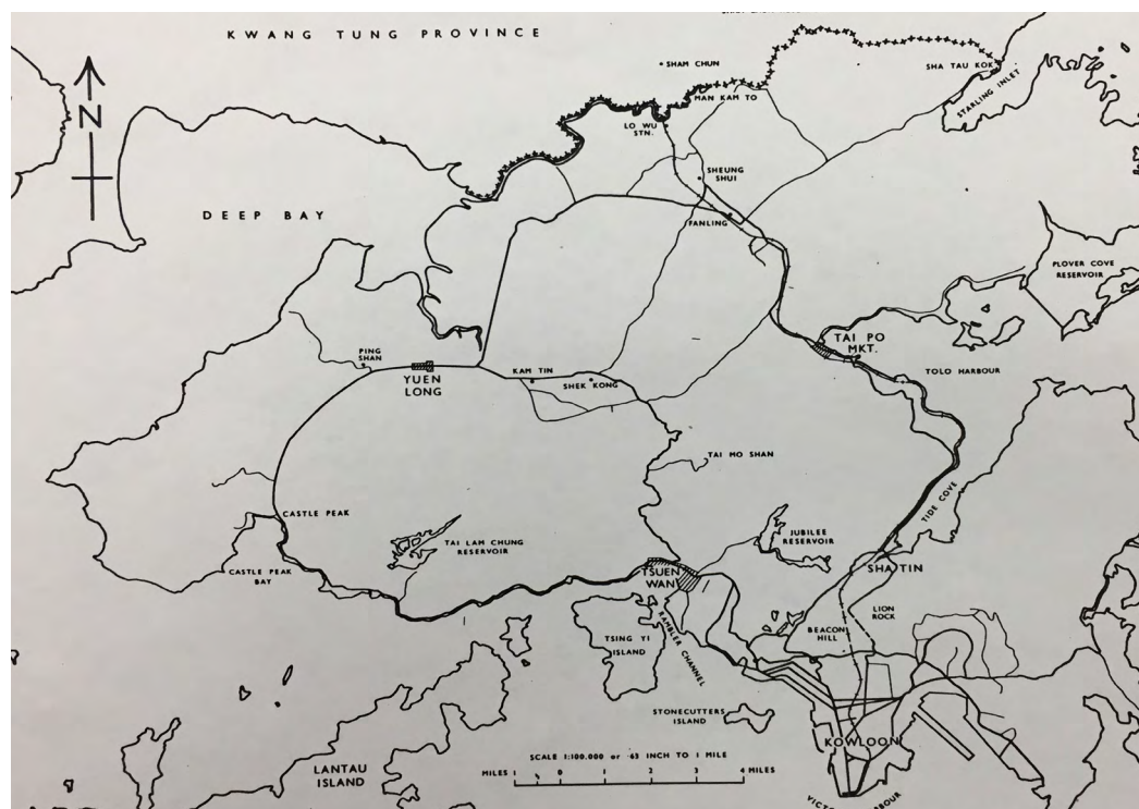
Map of Hong Kong's New Territories with border checkpoints and frontier, 1968. In Hong Kong Disturbances, 1967 (Hong Kong Government Printer, 1968).

the Hong Kong side, policemen were stationed at border posts. There were occasional flare-ups at the border, most notably at Shatoujiao/Sha Tau Kok in 1967. But everyday life along the frontier was characterised as much by porousness as by a boundary. Smuggling was pervasive, from China's encouragement to evade the Korean War blockade to streams of commodities that crossed in travellers' luggage (Thai 2018: 244, 253–59). Farmers on both sides of the border made daily crossings to work land on the other side—for example, Bao'an County peasants worked an estimated 4,000 mu (about 162 hectares) of land in the New Territories (Shenzhen Museum 2014: 247). In 1961, Bao'an County's Party Committee made small-scale cross-border trade a matter of policy, permitting residents within 10 kilometres of the border to make five trips a month, with