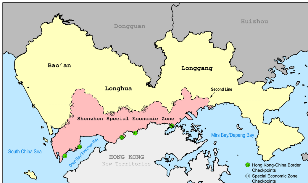
Map of the Shenzhen Special Economic Zone and its Second Line.

paint existing holes to make them more visible (Hong Kong Public Records Office, HKRS 156-1-3766; HKRS 934-6-107).