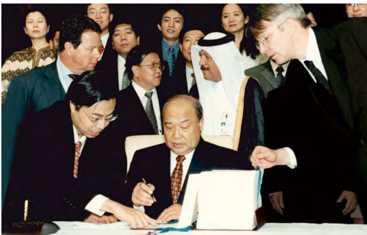
Signing ceremony for China's Accession to the WTO

To join the WTO, China made unparalleled commitments. Then US Trade Representative (USTR) Charlene Barshefsky observed that the concessions it made ‘far exceeded what anyone would have expected’. 7 To date, China’s obligations remain the most extensive and onerous among all WTO members, and many go far beyond those demanded of the most developed nations. 8 To implement these obligations, China made tremendous efforts, including amending numerous laws and regulations, significantly reducing tariff and non-tariff barriers, opening up a range of service sectors