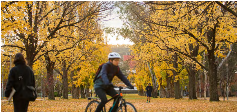
Students on the ANU campus

Chinese students make up more than one-quarter of the country's international student population. According to Department of Education, Skills and Employment data, there were 653,539 international students