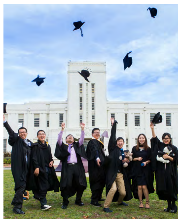
Graduates from English-speaking countries ‘retain an advantage in China’s crowded graduate labour market’

On 24 August, 27 percent of the 307,038 student visa-holders enrolled in Australian higher education institutions remained