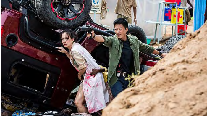
Chinese films like Wolf Warrior 2 focused on the Chinese government's extraction of citizens from crises abroad