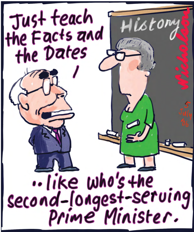
Figure 9. John Howard on history, facts and dates, 5 July 2006.

Source. © Peter Nicholson (Rubbery Figures Pty Ltd) 2006 ( nicholsoncartoons.com.au/ ). Reproduced with permission.