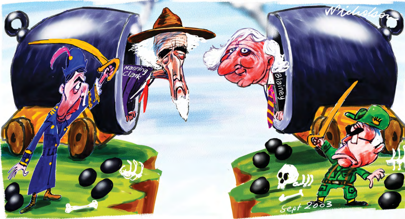
Figure 8. Paul Keating and John Howard squaring off.

Two visions of Australia were in conflict during the 1990s. Both had their prime minister, and each was identified with an historian—Manning Clark and Geoffrey Blainey, respectively.