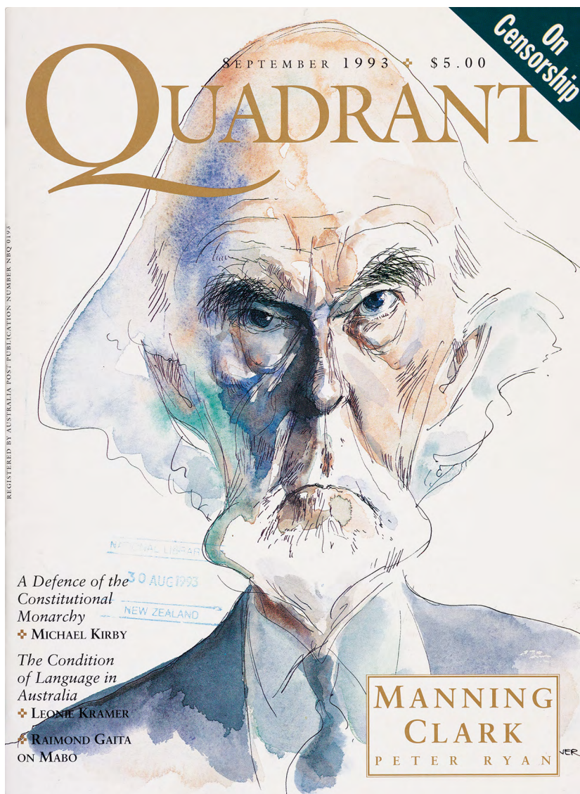
Figure 1. Caricature of Manning Clark on the front cover of Quadrant , September 1993.