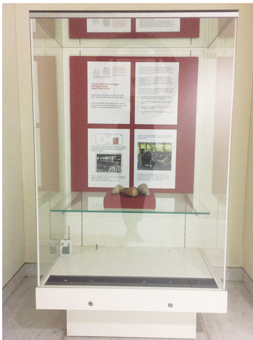
Figure 1.3. Carved Conus shells on display at the British Museum.