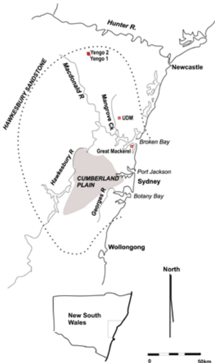
Figure 9.1: The four shelter art sites excavated for this research.

The four sites excavated for this research (chapters 6-8) all contained evidence for the episodic production of the pigment art. Yengo 1 also contained an engraved panel partially covered by occupation deposit. The two Yengo sites, located only 10m apart, contained very different art assemblages. Different degrees of direct and indirect association between the art and the deposit were demonstrated in these four sites.