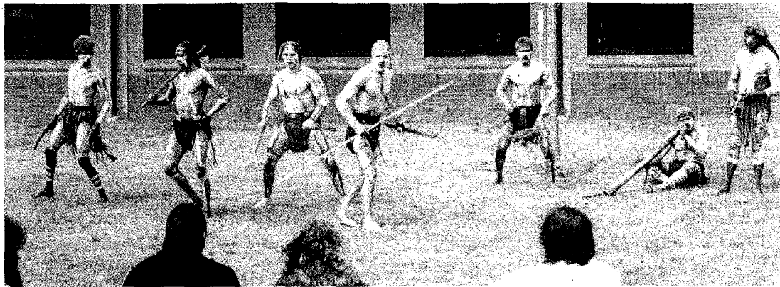
The Yarrabah Dance Company perform as part of the welcome ceremonies for the conference.