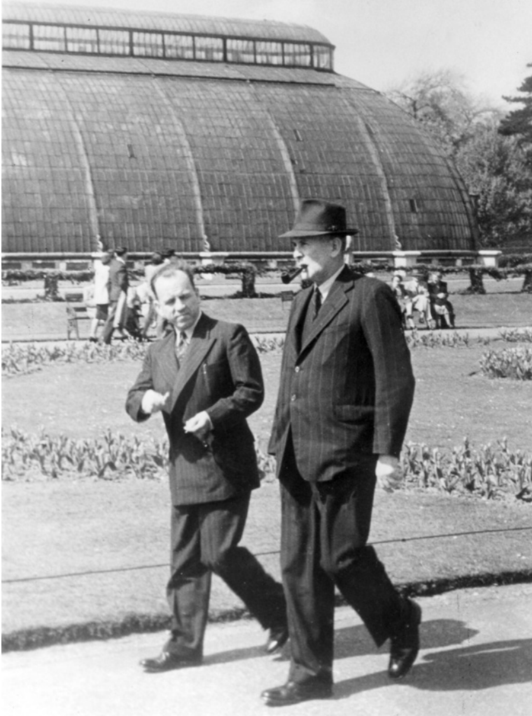
Figure 1.1 Combs and Chifley in front of Palm House at Kew Gardens, London, 1946

beginning to see the limitations of an 'old' country like Britain and was realising that the long-term future of the Commonwealth lay in newer countries like Australia, where 'fresh thinking about academic and technological activities' was possible. 15