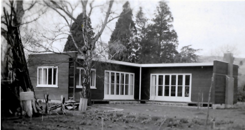
Figure 1.9 Frankel House, Opawa, Christchurch, c. 1940