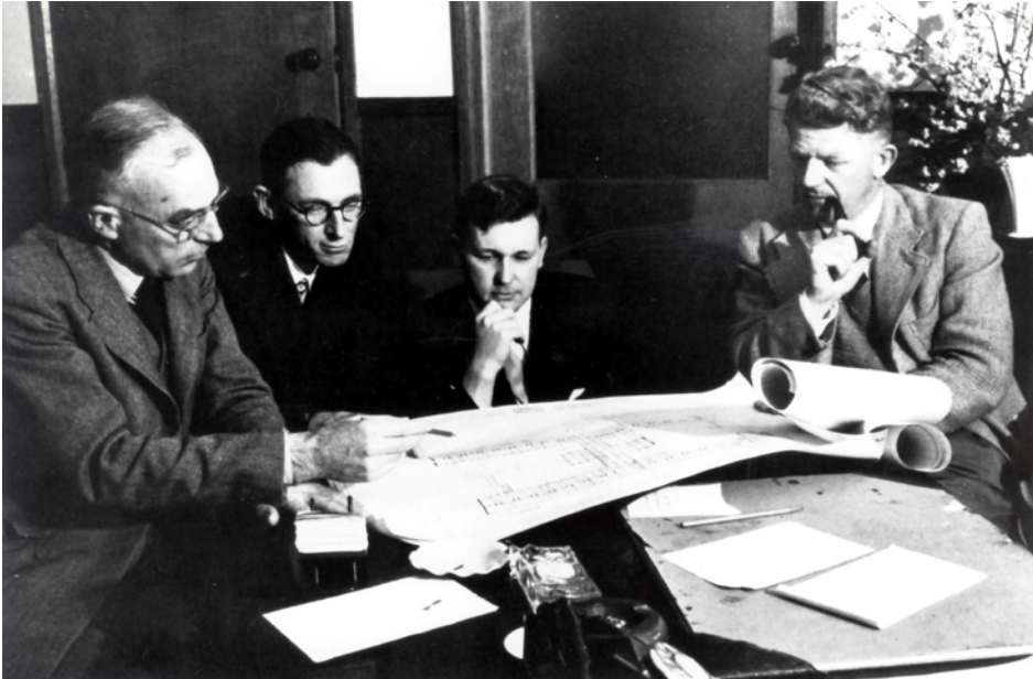
Figure 1.4 The four medical professors—Eccles, Albert, Fenner and Ennor—study plans for the John Curtin School of Medical Research, Canberra, August 1950