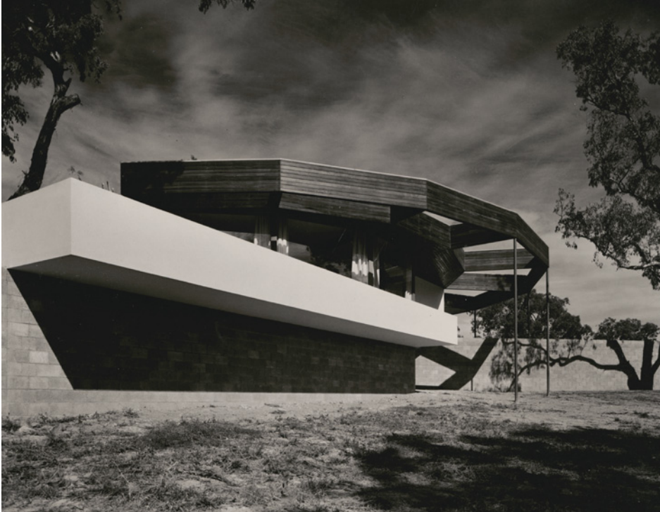
Figure 1.11 Benjamin House, view from north-west

own aesthetic judgment, and he would not hesitate to back his own opinion when it came to questions of architectural language and form. These qualities were what led to the mutual respect, and close friendship, that he developed with Grounds—a working relationship that underscored (and survived) their collaboration on a number of houses and buildings.