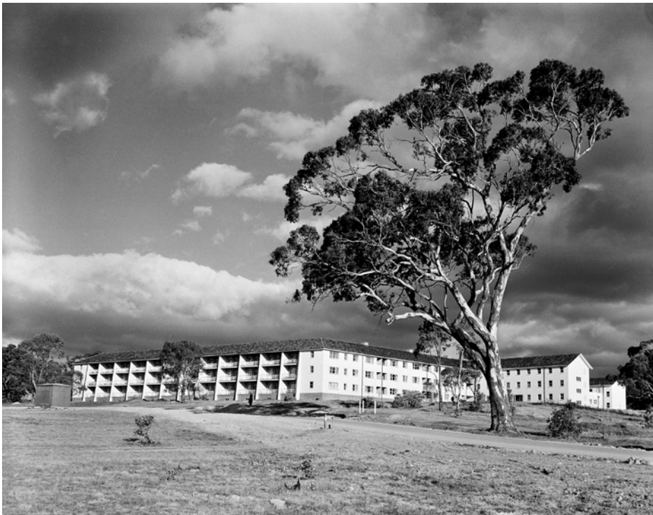
Figure 1.3 University House, The Australian National University, 1954

a variety of formal and informal spaces for dining, meeting and study. As the centre of academic social life and the most frequented building on campus, it was to be a showcase of contemporary Australian art and design, demonstrating that while the university maintained Oxbridge traditions, it also supported contemporary Australian culture. 46 Melbourne-based designer Fred Ward—whose furniture design Boyd had praised in Victorian Modern in 1947 47 —was commissioned to design furniture and fittings in local timbers, and Australian paintings were hung on the walls. Lewis had recruited Ward to teach interior design in the Architecture Department at the University of Melbourne, and his design approach—a restrained, modernist interpretation of the English Arts and Crafts style, underscored by a sound knowledge of Australian timbers and construction methods—was the perfect match for his own architecture. University House was Lewis's most successful building in Canberra, earning him a Sulman Medal in 1953.