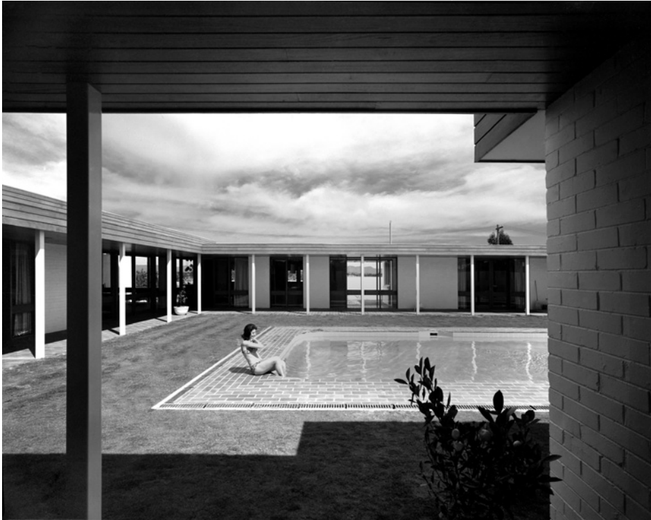
Figure 1.5 Birch House, central courtyard with swimming pool

into the internal courtyard, and a clear sightline was maintained from the front door right through the centre of the building to the landscape beyond. 65 When the family relocated to Canberra, Jessie was a frequent visitor to the building site and was involved in the selection of finishes, fittings and furniture.