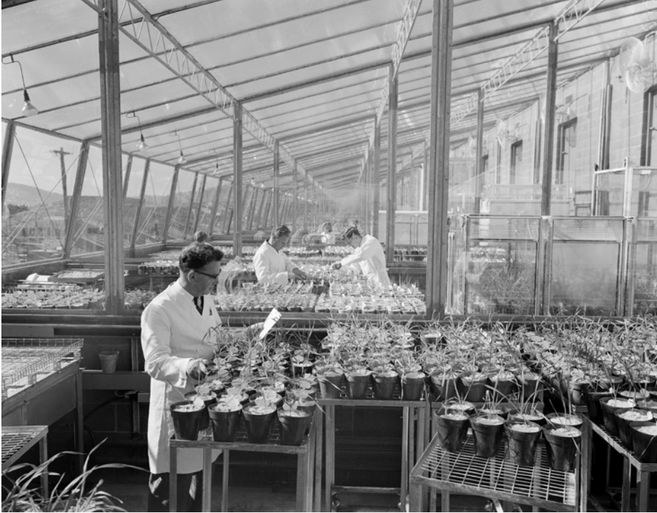
Figure 1.10 Phytotron hothouse, Commonwealth Scientific and Industrial Research Organisation, Canberra, 1962

Photograph: National Archives of Australia. NAA: A1200, L42101