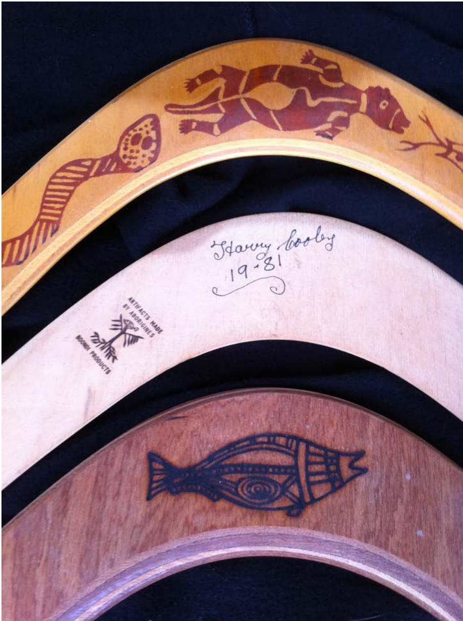
Figure 5.2: Finished boomerangs with Harry's signature.