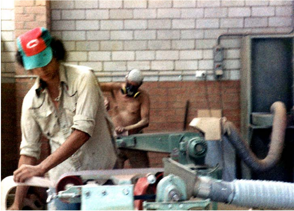
Figure 5.1: The boomerang-making team working in the co-operative factory.