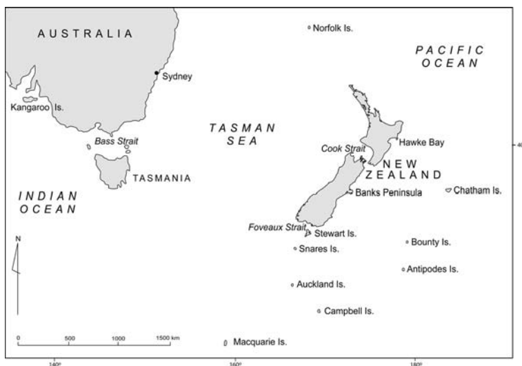
Figure 1. New Zealand and southeast Australia.