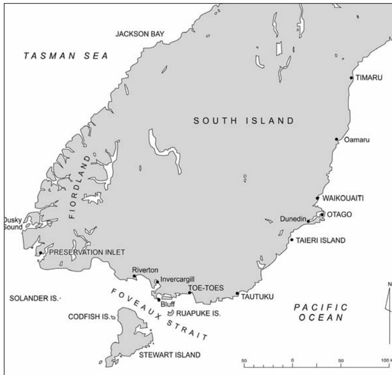
Figure 2. Southern New Zealand.