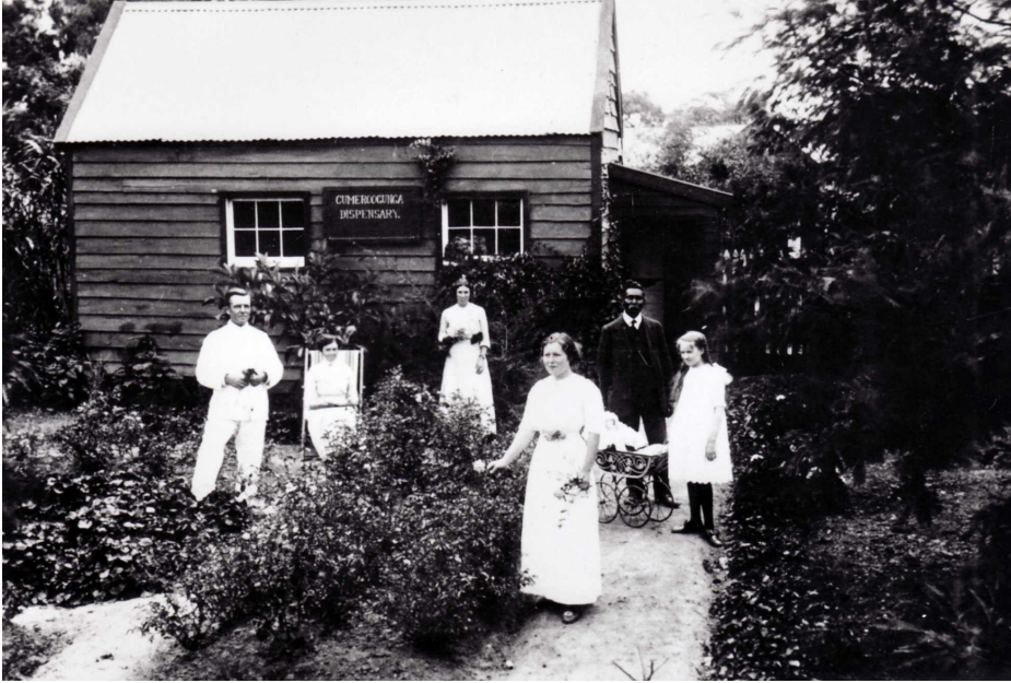
Grampa and others in front of the Cummera Dispensary.

Grampa also established and ran the dispensary at Cummera and Maloga Missions and dispensed a combination of treatments to those in need.