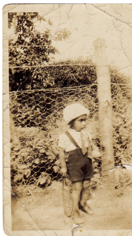
Me with my cricket bat at five years old.