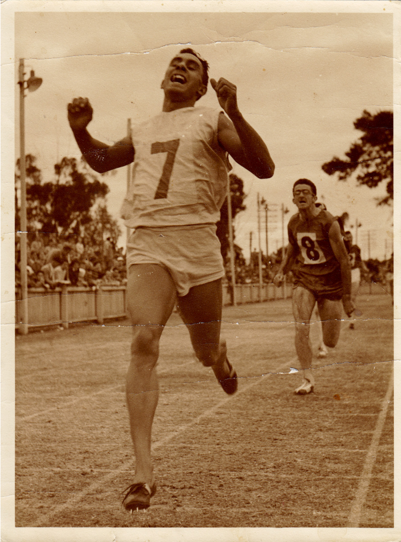
Me crossing the finishing line of the Stawell 880 yards, 1957.