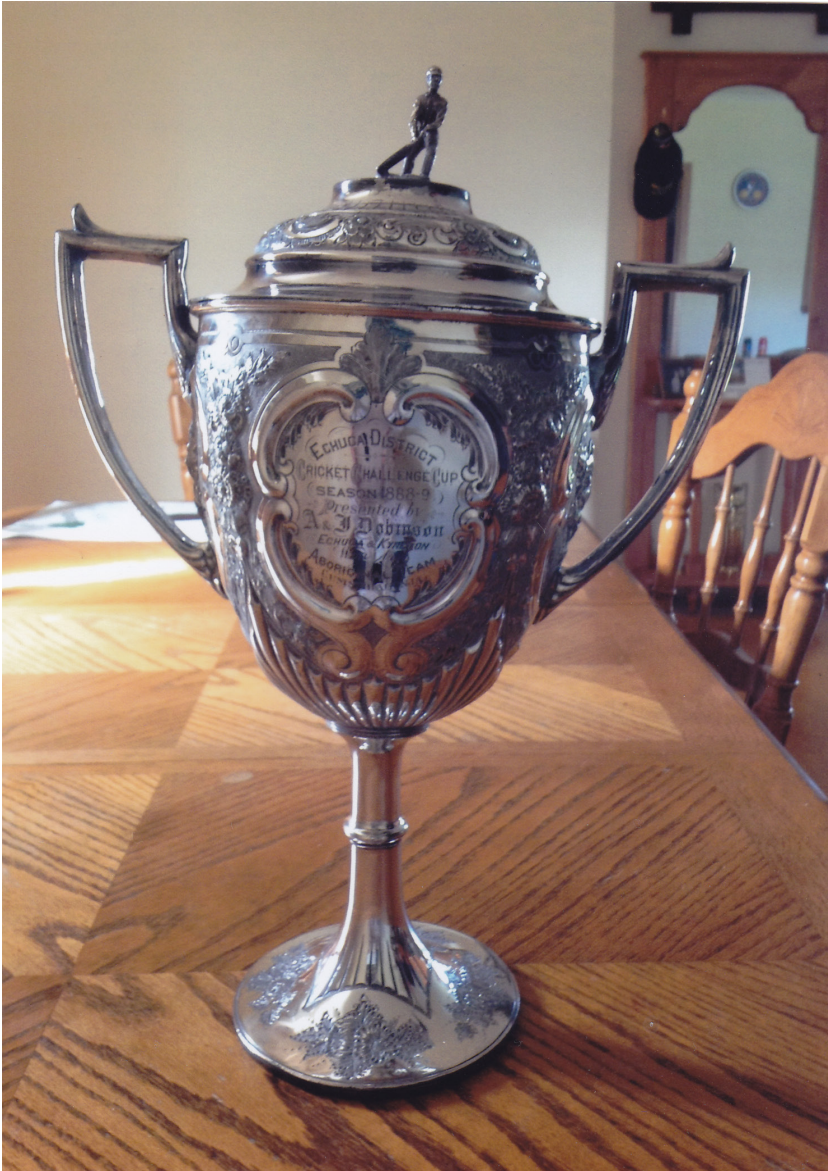
The 1888/89 Echuca District Challenge Cup won by the Cummeragunga Cricket Team.

In 1903 the Cummeragunga community held a concert in the Temperance Hall in Echuca. They often held concerts to raise funds for different causes, and this night it was to raise money for the Glee Club and the Cricket Club. The Riverine Herald article states that: