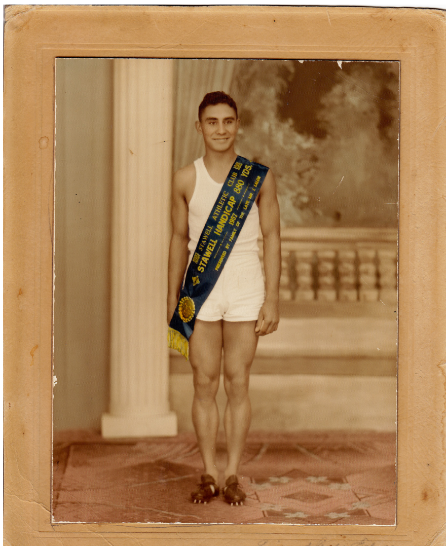
With my sash after winning Stawell 880 yards, 1957.