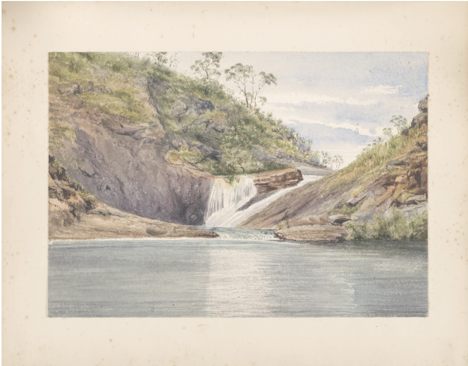
Henry Prinsep's watercolour of Serpentine Pool in the Darling Range shows a place that is still popular as a swimming and picnicking spot for Western Australians.