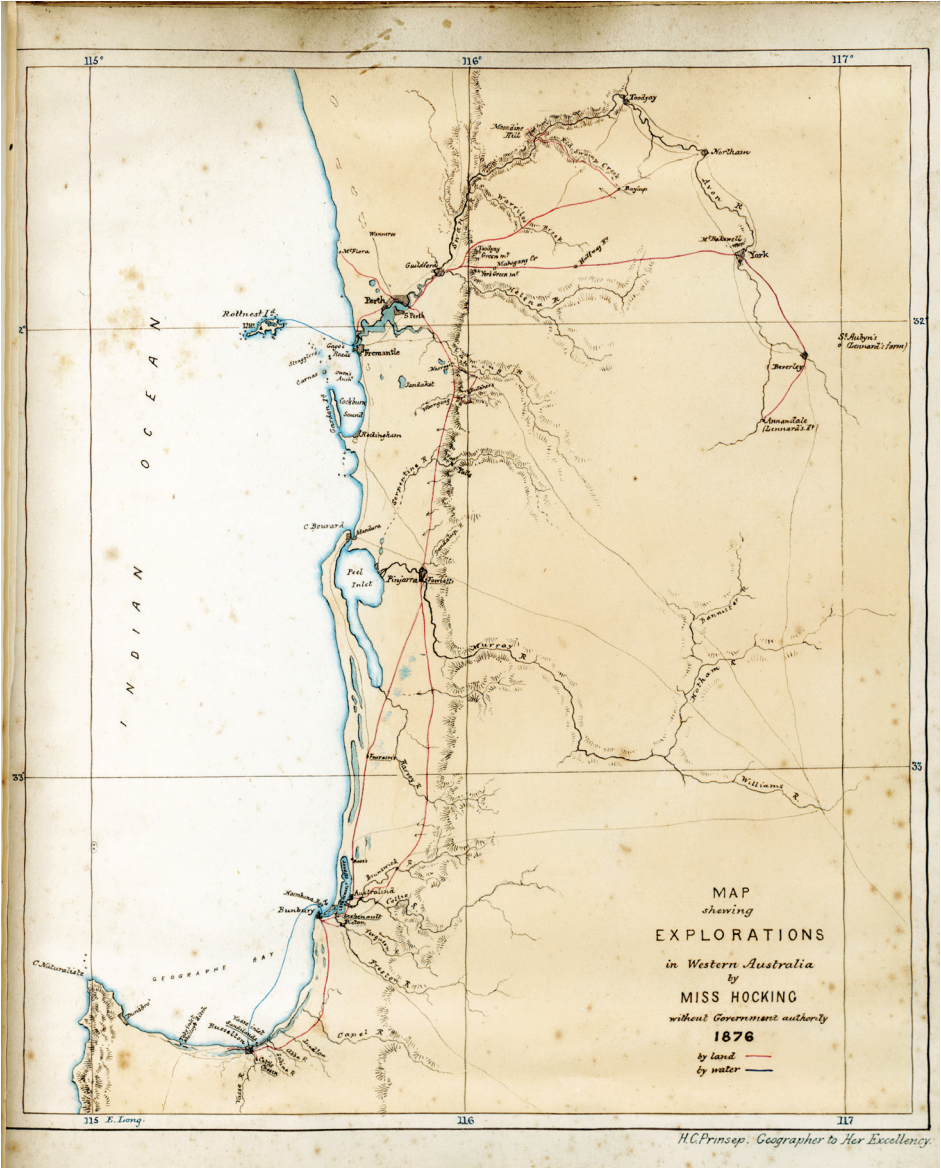
‘Map showing Explorations in Western Australia by Miss Hocking, without government authority, 1876, by H.C. Prinsep, Geographer to Her Excellency’.