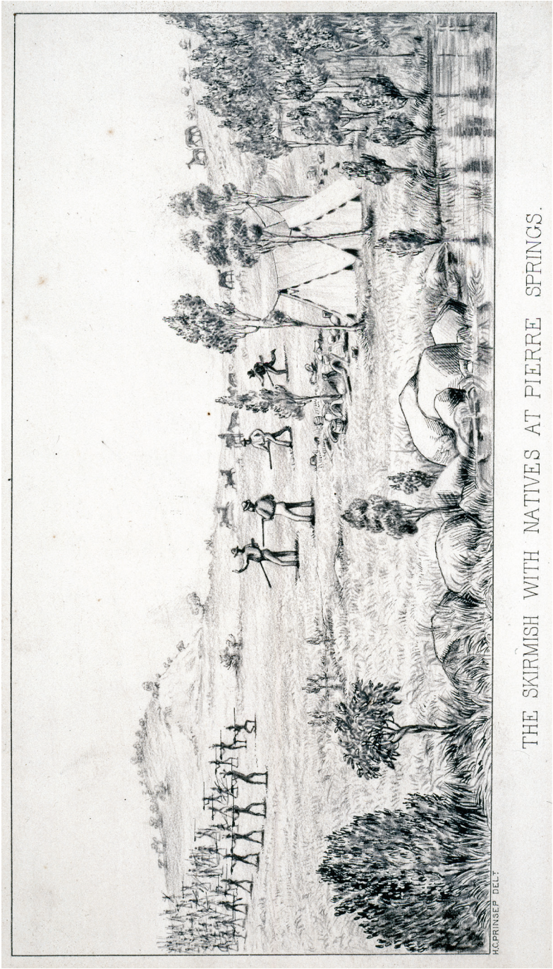
Prinsep's pen and ink illustration of a scene from John Forrest's 1874 exploration into the Central, Victoria and Western Deserts.