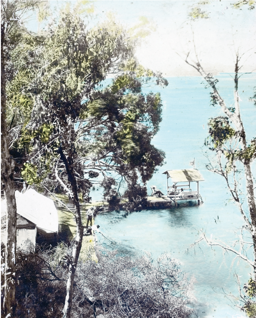
The Chine, a panorama from the low limestone cliffs behind it.