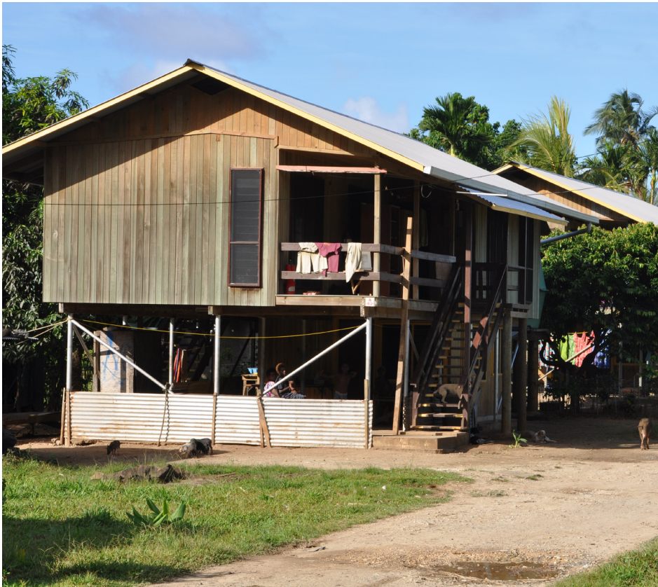
Plate 5-2: Relocation housing in Putput village, 2009.

realised that more sweeping economic changes were not about to arrive. As you drove, walked, rode or even paddled by canoe along the coastline in either direction from Londolovit townsite, there was a noticeable decline in the material standards of living with increasing distance from the SML zone. Driving along the road through Kunaie, Londolovit, and Putput, the streets are lined with power poles, there are cars in the driveways, migrant workers and their families rent houses owned by landowners, men stagger around drunk on royalties and wages, cheap plastic toys imported from Asia lie broken and strewn about the place, women and men seem to have brighter and cleaner clothes, and television sets continuously flicker with music video clips, C-grade action films, State of Origin repeats, and the national broadcaster EM TV.