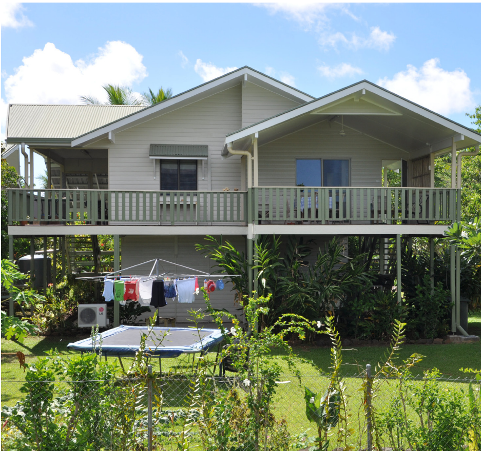
Plate 5-3: Comparatively luxurious expatriate company housing, 2009.

K200 000 in land-related payments (see Table 5-1). On closer inspection, geographic distribution is further cross-cut by social divisions and internal differentiations that are not always recognisable. In Ward 2 (Putput 1 and 2), which has received the highest amounts of compensation and royalties, there is a significant difference between different clans, sub-clans and lineages, and men's houses. For instance, in 2006 the Sianus men's house in the Likianba subclan of the Tinetalgo clan received nearly K300 000 in land-related payments. The Unapual and Lepugalgal men's houses of the Likianba subclan of Tinetalgo clan, and the Lakuendon men's house from the Lopitien clan, also received in excess of K100 000. The remaining 34 lineages from a range of clans represented in the villages of Putput 1 and Putput 2 all received less than K100 000, with the majority getting well under K50 000.