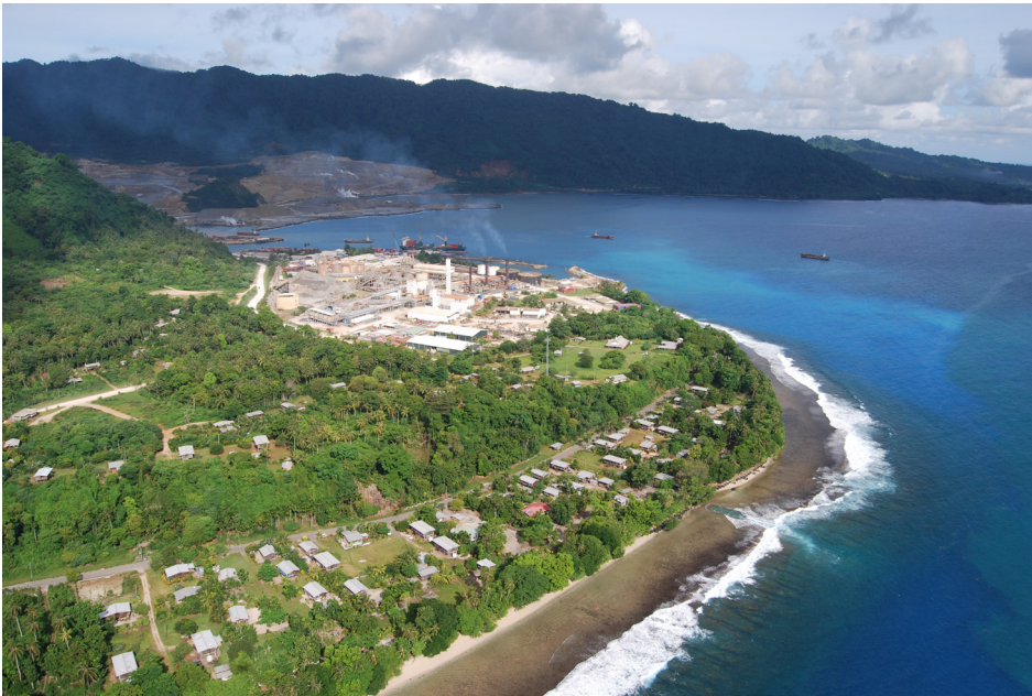
Plate 5-1: Putput village and the processing plant, 2008.

compensated financially for the lack of access to traditional men's house sites, damage to graves, and the loss of gardens and other agricultural resources. However, people not living in the affected areas soon realised that they would have been content to sit on the sidelines. Filer and Mandie-Filer (1998) noted that the split between the 'haves' and the 'have-nots' was particularly acute around the border areas like Putput 2. These people found themselves living close to their relocated relatives and their ostentatious affluence, yet they simultaneously feared the envy and resentment of the non-affected community who tended to 'lump all Putputs together as a bunch of idle, greedy snobs who deserve to have their houses burnt, their cars wrecked, and their daughters raped' (ibid.: 6). This seems excessive unless we remember that all Lihirians looked to the mine as their source of economic salvation. The humiliation that accompanied the unequal distribution of wealth was easily transformed into disillusionment and emotional hostility. The general objection that 'non-affected' Lihirians continued to have to their 'affected' relatives was the latter's refusal to share their newfound wealth.