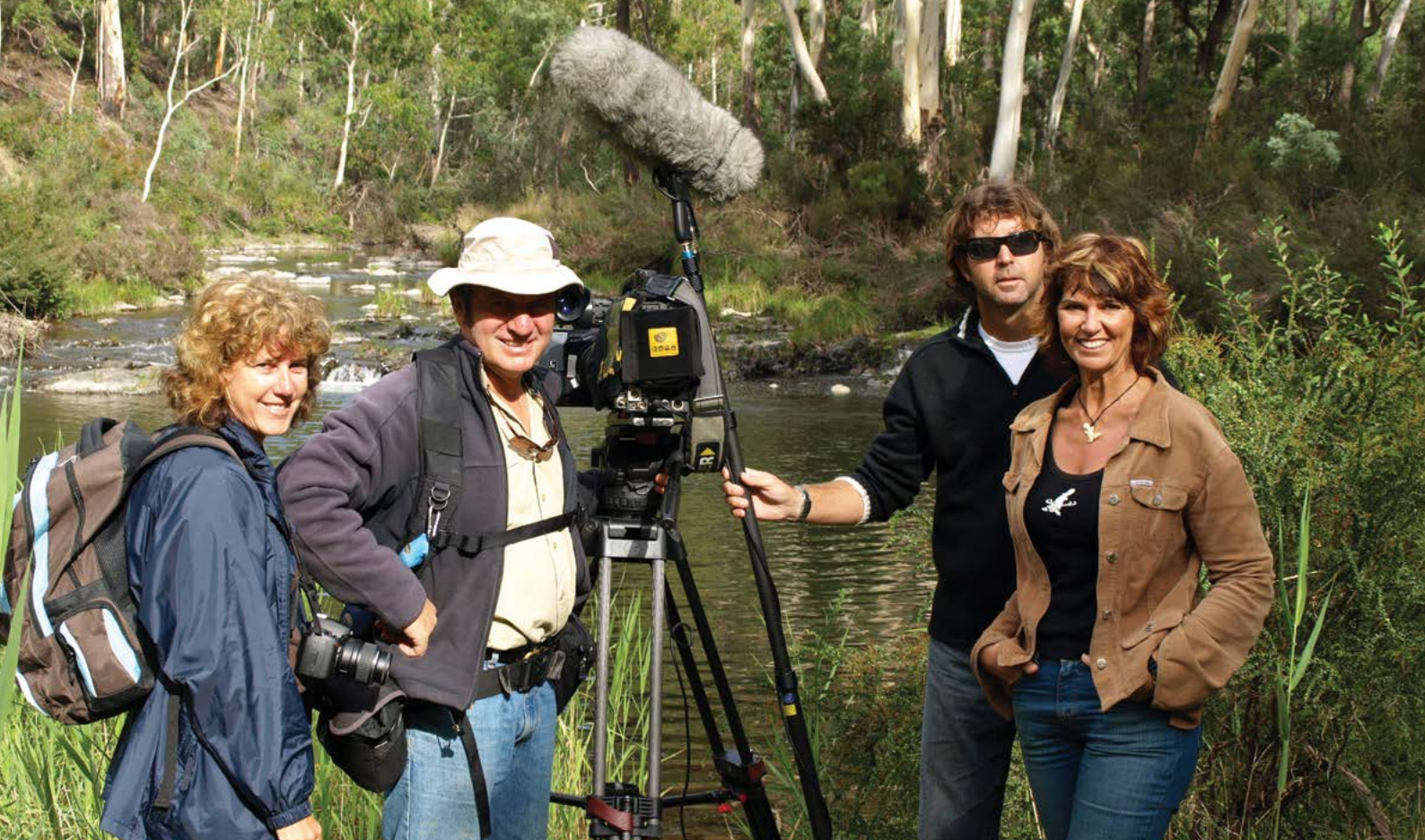
Documentary film crew, Kosciuszko National Park, New South Wales, Australia, including camera person, sound engineer, interviewer and still photographer