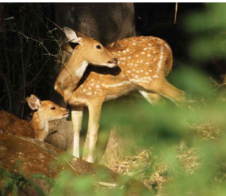
Indian spotted deer ( Axis axis ), Bandhavgarh National Park, India