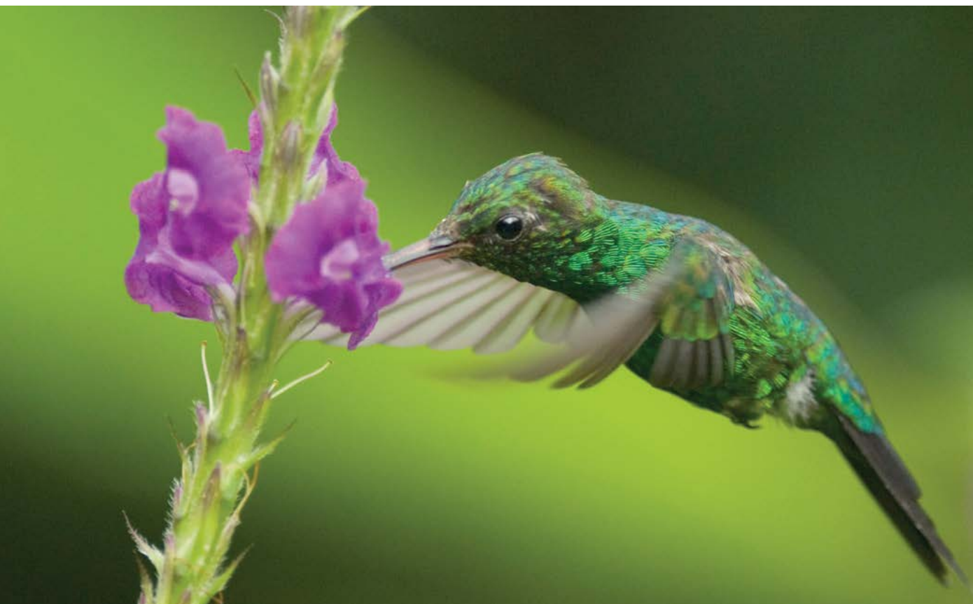
The magnificent garden emerald hummingbird ( Chlorostilbon assimilis ), an endemic species to Costa Rica and western Panama, protected area, Costa Rica