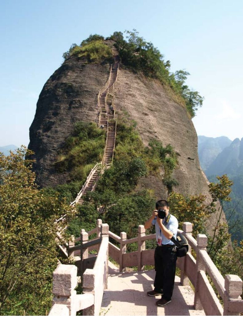
Media photographer, Langshan National Park, China