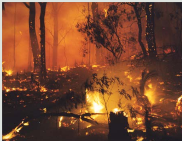
The 2003 Australian Alps fires burning in Kosciuszko National Park

This event took place in a period before apps and the highly advanced nature of the internet today. If it were to occur again tomorrow there would be a range of additional social media tools that would be deployed, but what this case illustrates is the need to find a broad range of communication channels to ensure as many people as possible can be reached with information quickly and to ensure that the team managing public information has all the resources possible to complete the task at their disposal.