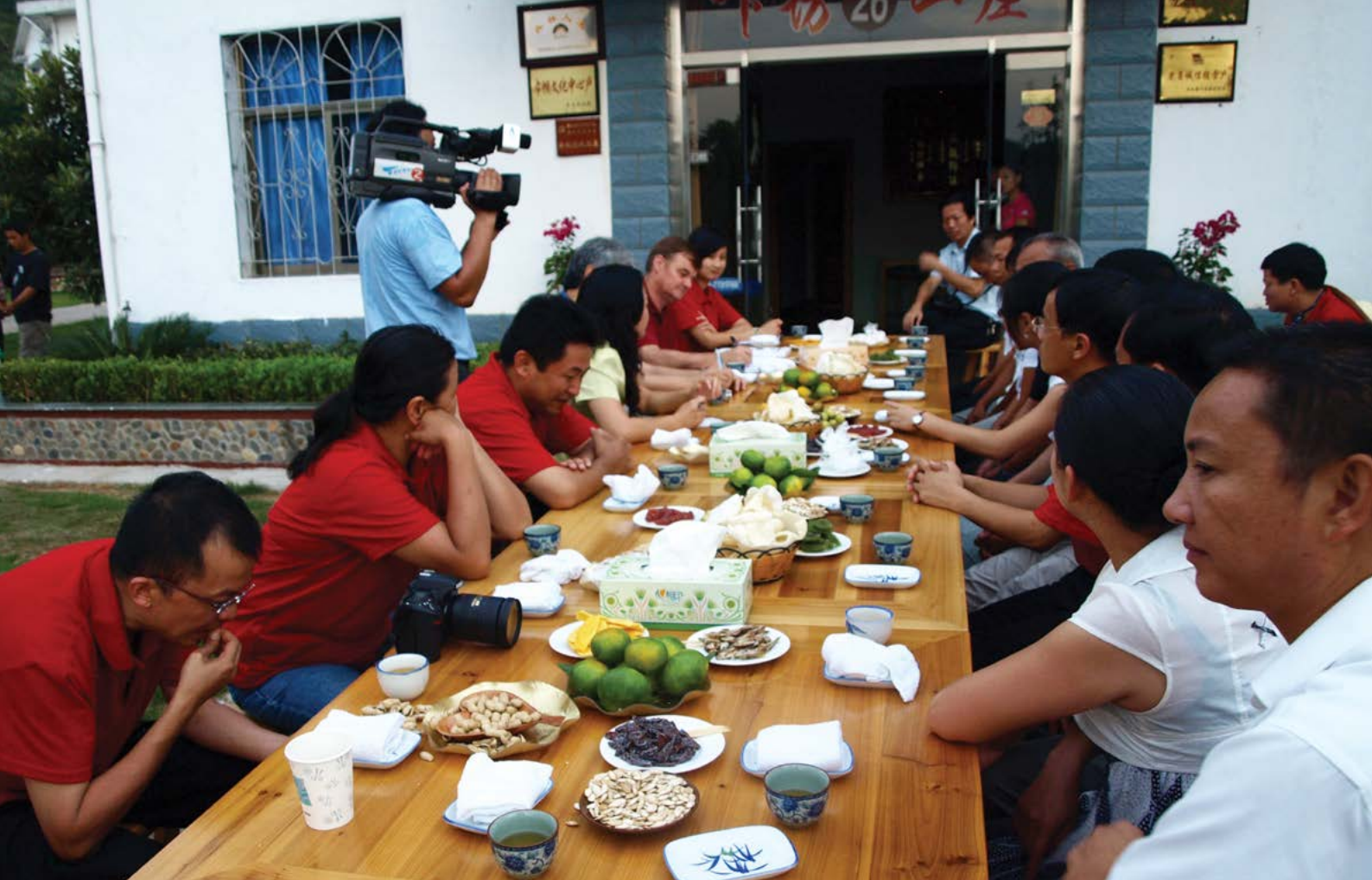
Meeting between community representatives and protected area officials, Taining National Park, China