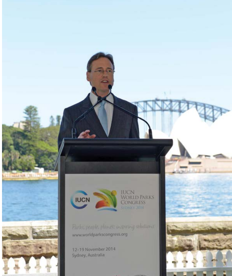
Australian Government Minister for the Environment, The Honourable Mr Greg Hunt MP, launches the official commencement of the Sydney November 2014 IUCN World Parks Congress preparation, Sydney Harbour, Australia

The process of gathering news is endless and relentless. No sooner is one story used than another must replace it in a round-the-clock process. To gather news, journalists must seek information from a wide variety of sources, analyse it quickly and decide whether it carries enough ‘news values’ for it to warrant publication or broadcast. This information comes to the journalist from a variety of sources, both formal and informal. Perhaps the most common is in the form of the ‘press release’, also