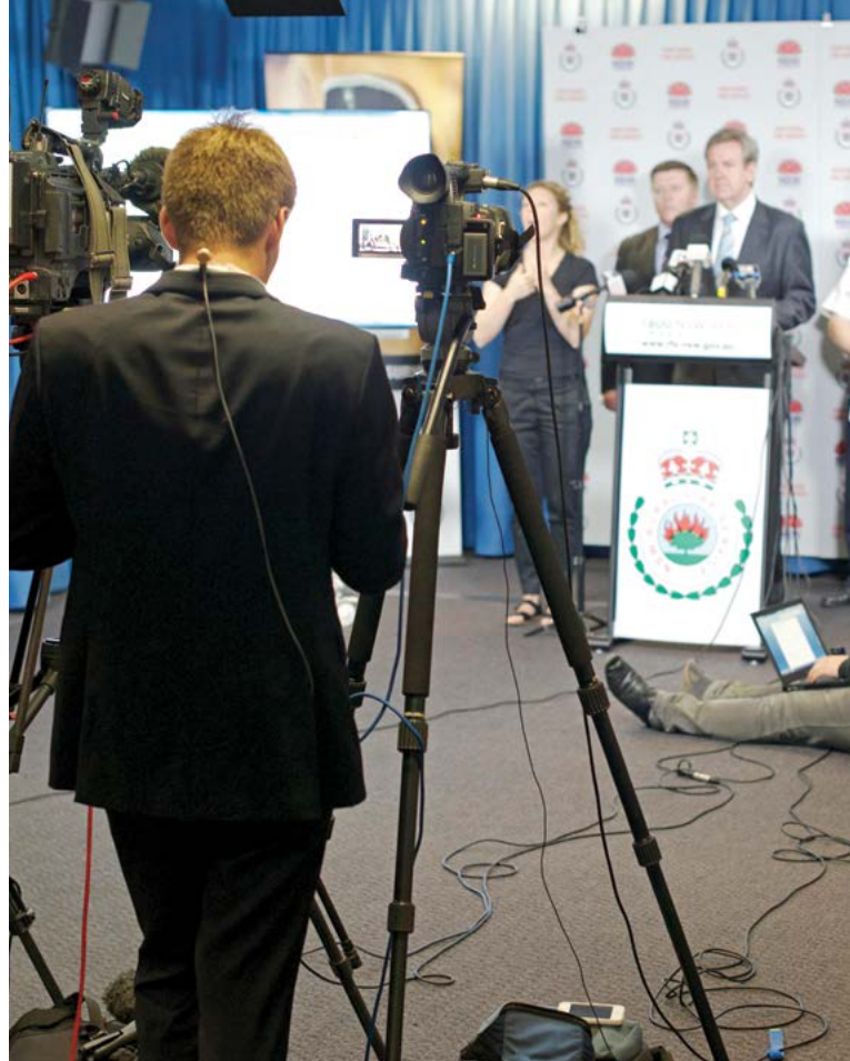
Media conference involving the Premier of New South Wales, State Operations Centre, Sydney