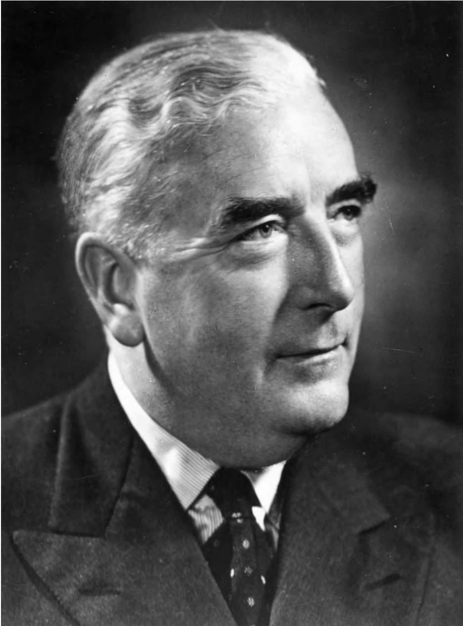
Robert Menzies, c1950