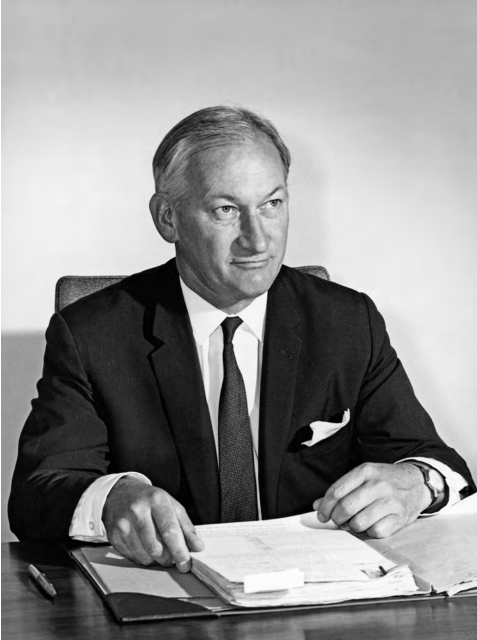
Sir Arthur Tange, 1965