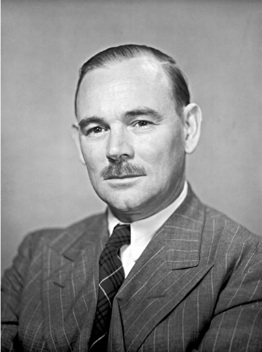
Paul Hasluck, 1954

Pacific but need not be provoked unnecessarily. Here he differed from Evatt in tone rather than substance. Hasluck was already aware that, in an international community shaped first and foremost by power relationships, Australia must use judgment in achieving effect while working within its limitations.