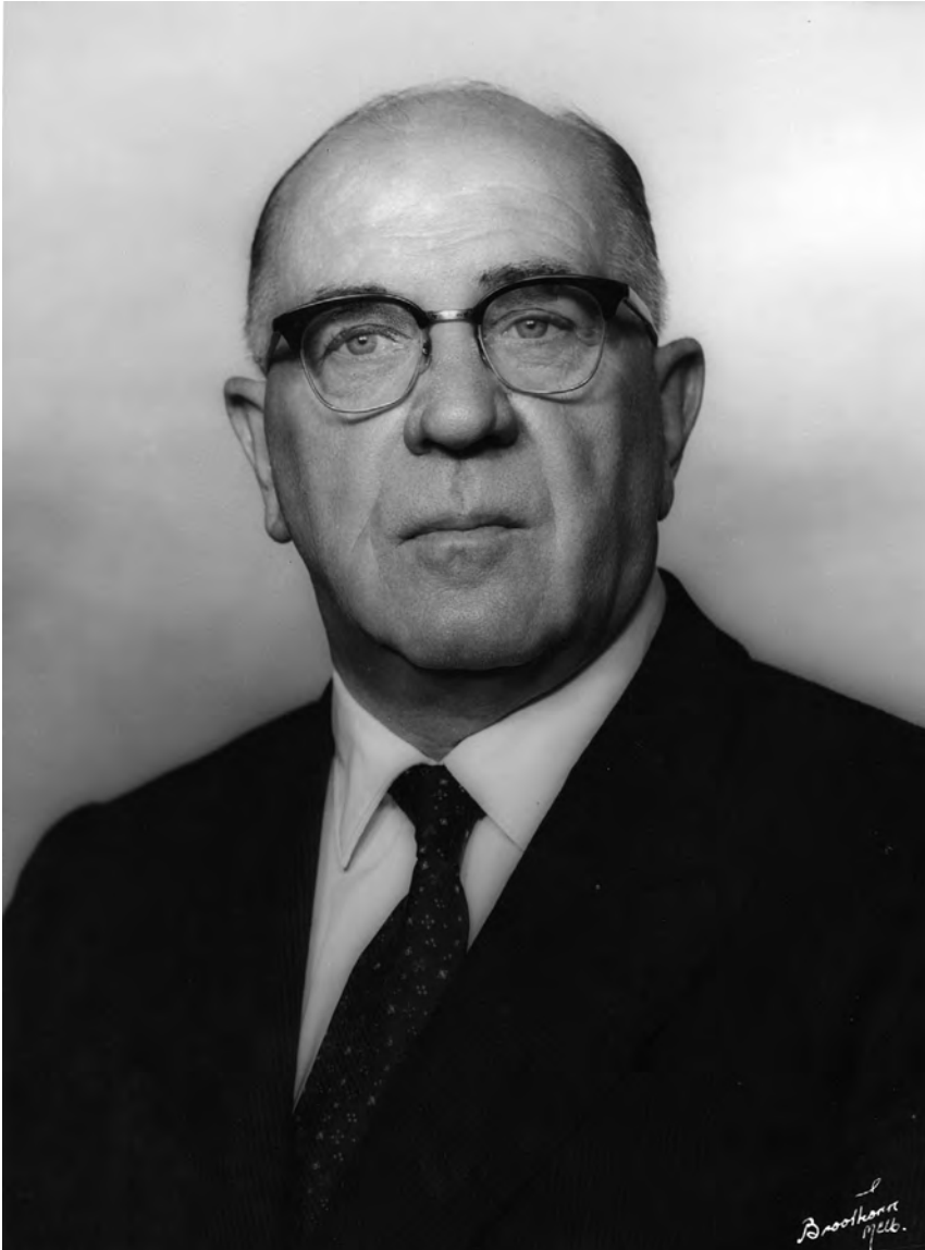
Sir Douglas Berry Copland, 1951