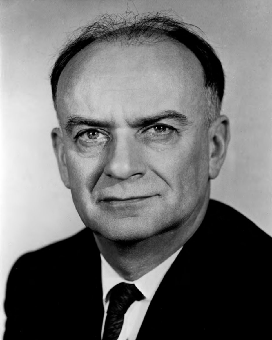
Sir Henry Bland, 1966