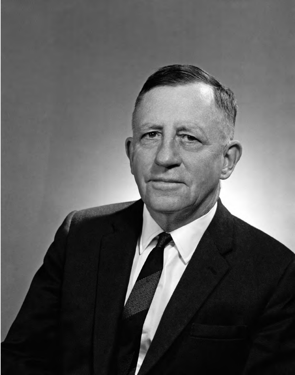
Sir Richard Randall, 1966