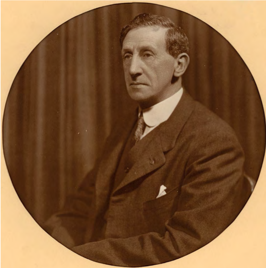
Sir Robert Garran, c1930

in 1932, however, he left a public service hostile to graduates except those with professional degrees, mainly law, engineering and medicine. It was also a public service in which the road to the top largely began at the bottom.