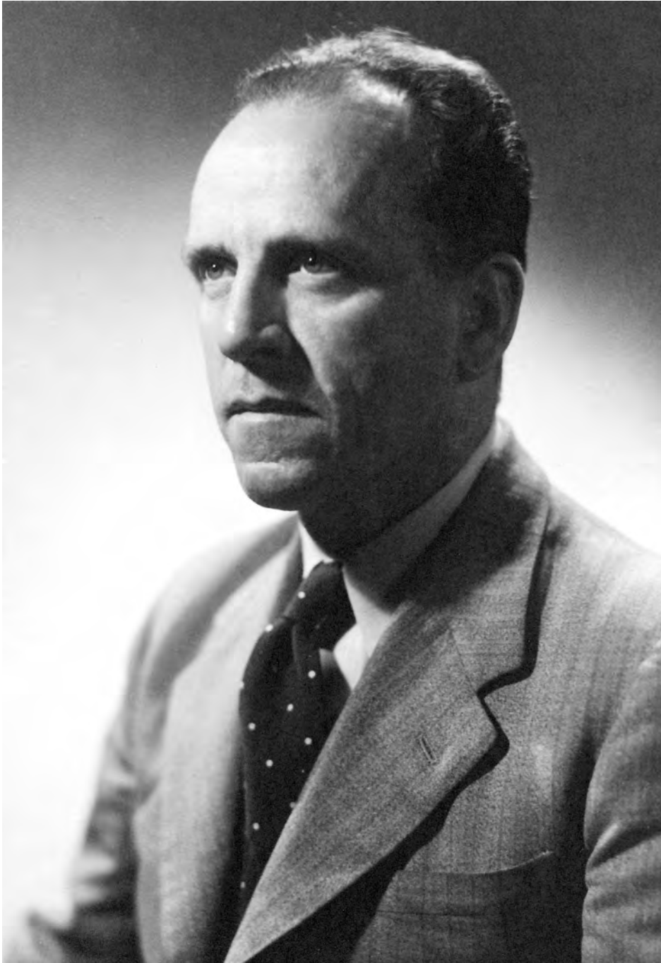
Dr H.C. (Nugget) Coombs, 1950