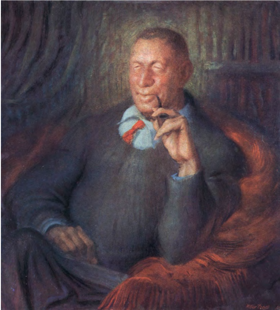
Professor L.F. Giblin, portrait by Sir William Dobell, c1945

Source: University of Melbourne Archives, UMA/I/1026