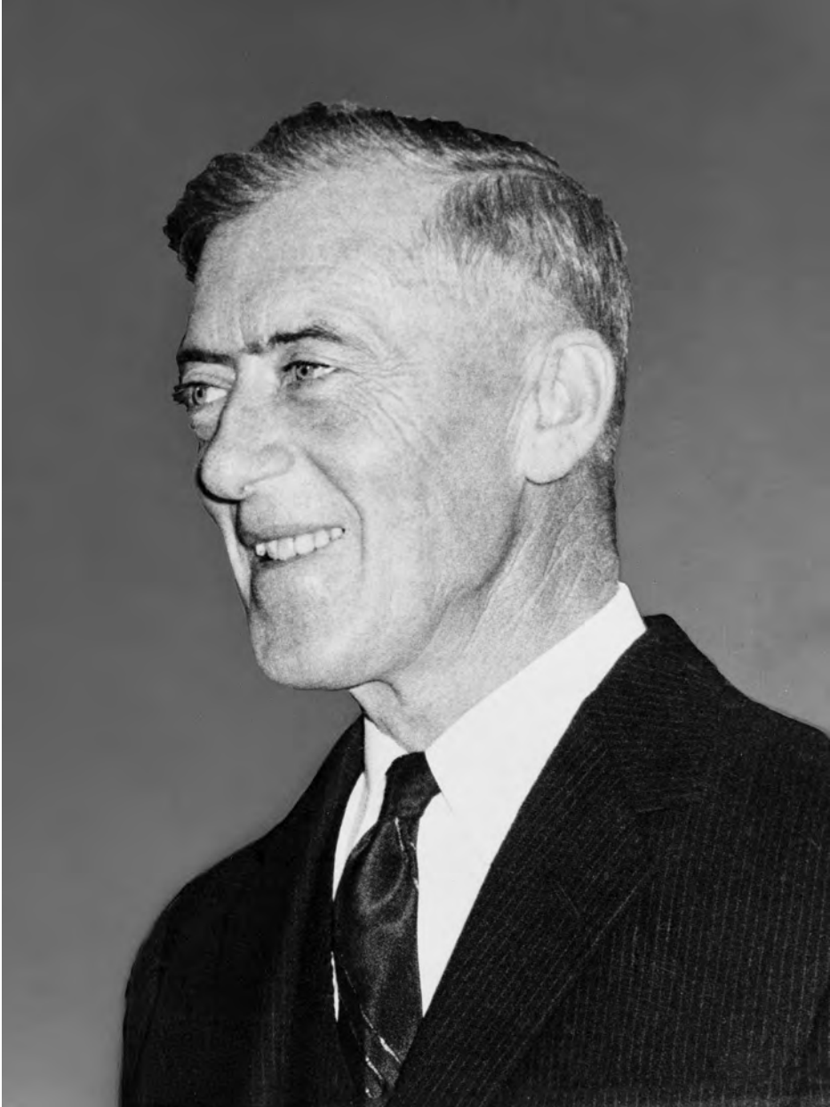
Sir Roland Wilson, 1965