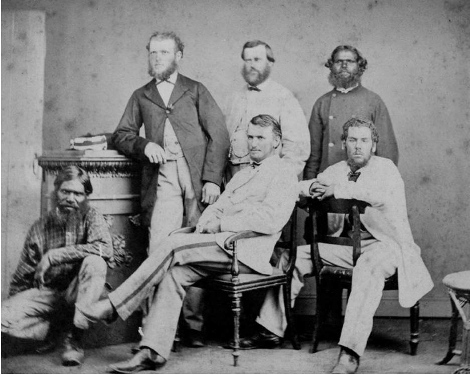
Figure 3.6 ‘Six members of the exploration party to the eastward and southward of Hampton Plains, led by Alexander Forrest’, 1871.