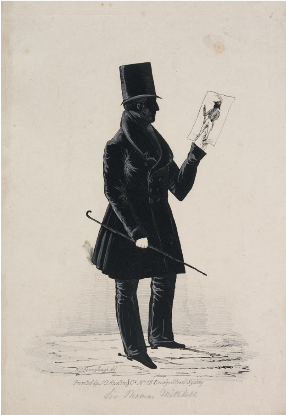
Figure 3.3 W.H. Fernyhough, 'Sir Thomas Mitchell', c. 1836.