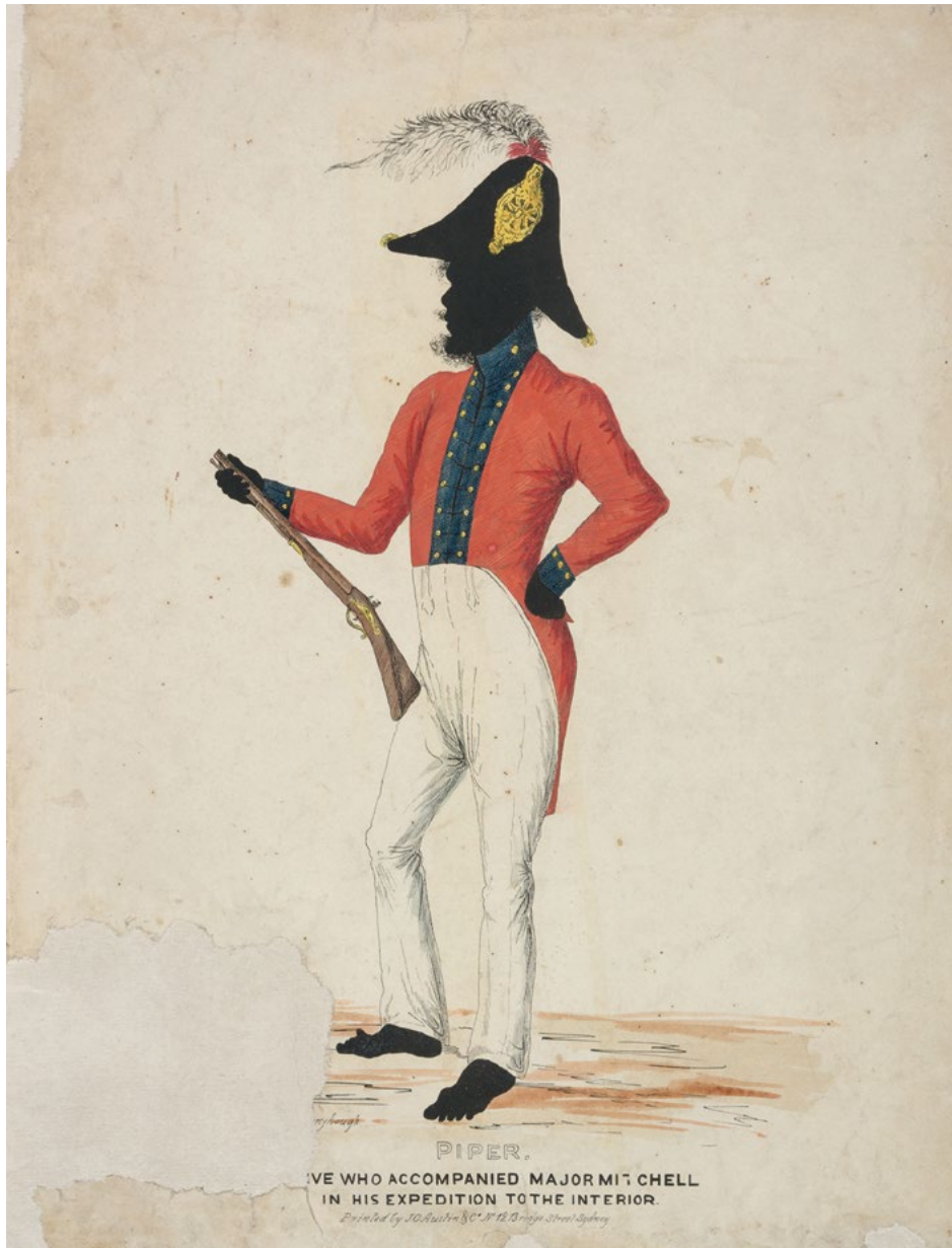
Figure 3.2 W.H. Fernyhough, 'Piper. The Native who accompanied Major Mitchell in His Expedition to the Interior', c. 1836.