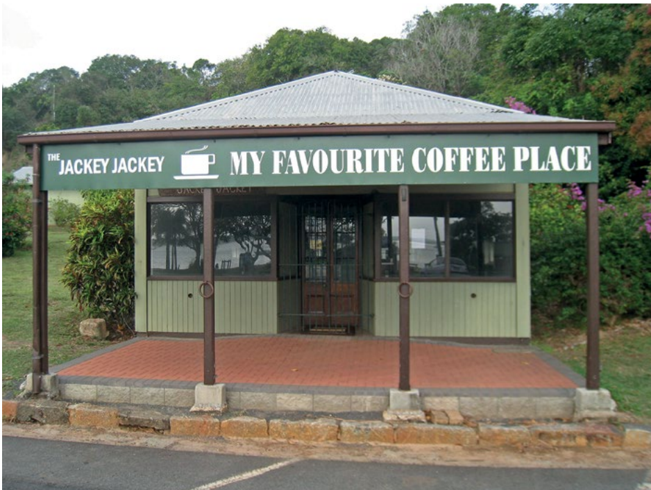
Figure 3.12: Jackey Jackey coffee shop, Cooktown, Queensland, 2010.