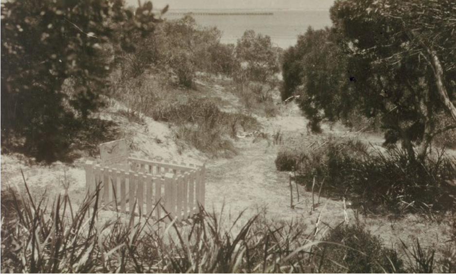
Figure 3.10 Original Windich grave with headstone, photographed 1938.