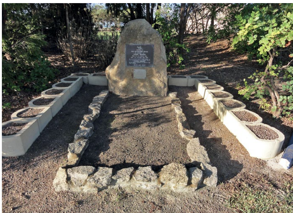
Figure 3.9 Windich 'memorial' grave, Esperance, Western Australia, erected in 1988.

a statue of Windich in a Coolgardie park. Tommy Windich's gravesite has been problematic. Tourists are encouraged to visit 'the final resting place' of Tommy Windich in the Port Authority Park, Esperance. 81 Oddly, this is not Windich's final resting place but is called a 'memorial grave' and was constructed in 1988. 82 The original grave, complete with white picket fence and granite headstone, overlooked the ocean in the sandhills on what became Port Authority property. The original gravesite, now without its original headstone or fence, sits between the Port's entry and exit roads. Recently a 'Historical Site' sign has been added. 83 The siting of the 'memorial grave' in a public park suggests both that Windich was considered important but also that, as with other public memorial sites, accessibility was sometimes more important than accuracy in determining a place of public memory. 84