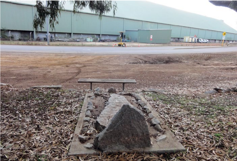
Figure 3.11 Original site of Windich's grave, as it is now, Esperance, Western Australia. The headstone is now in the Esperance Museum.