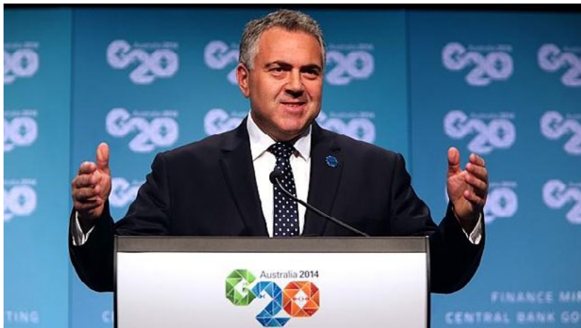
Joe Hockey at the meeting of the G20 finance ministers

roadmap to economic development convergent with the interests of other economies, including the United States.’