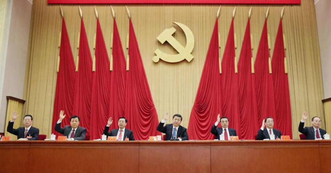
The Third Plenum of the Chinese Communist Party's Eighteenth Central Committee concludes in Beijing

the Operation of Power' (X) and the final section on 'Strengthening and Improving the Party's Leadership over the Comprehensive Deepening of Reform' (XVI).