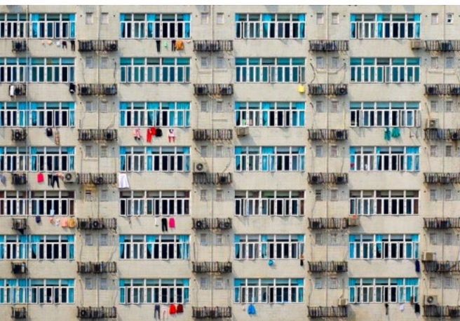
Haphazard and chaotic construction of slum-like apartment buildings

Not all rural communities have fared so badly. In ‘The Guangdong Model of Urbanisation’, the authors Him Chung and Jonathan Unger, depict village collectives that have retained collective ownership of their land by converting Mao-era socialist units into shareholding companies. The companies have capitalised on the rising value of their land, partly the result of rapid inflows of foreign direct investment into the province. While some villagers have become incredibly wealthy in the process, this