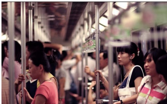
260 million migrant workers have moved to Chinese cities in recent decades

This is understandable given the enormity of the challenges in dealing with the largest migration flow in global history. A ‘big bang’ approach to granting urban residency to anyone who wanted it, in any city they wished to live, is not a realistic option. The pressure on cash-strapped, city-level governments would be far too great. Although new ways for them to raise funds are under way — including tax system reforms and the establishment of financial institutions to support infrastructure and housing — these will clearly take time.