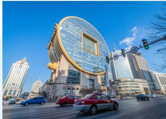
This building in Shenyang, Liaoning province, is known as the Square and Circle Mansion. It was envisioned by its Taiwan designer C Y Lee & Partners to convey the city's financial aspirations. It is in the shape of an ancient Chinese coin, known as a bi 币

Finally, China has a thriving market in Bitcoin. The Central Bank barred financial institutions from handling Bitcoin transactions in December 2013, ending a speculative boom by making it difficult for Chinese people to get cash into or out of the Bitcoin system. But the cryptocurrency itself is not illegal and there are still enthusiasts and startup Internet companies offering related services such as the Bitcoin marketplace BtcChina.com.