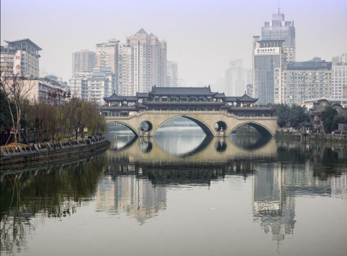
Urbanisation in Chengdu

pointed out: ‘Although the resolution’s general message is encouraging, a shopping list of reform objectives is not a strategic analysis of the contradictions that are undermining China’s development, let alone an action plan for responding to these contradictions. Indeed, for China’s new leadership, the successful completion of the Third Plenum is only the first step in a new long march toward a more stable, prosperous future.’ There will never be perfect consensus on just where that long march should finish, either within the ranks of the Party or beyond. Still, the policies of 2014 are not so different from the past. It is more useful to have realistic expectations about what the Xi–Li era can and will deliver, rather than great expectations that may well result in disappointment.