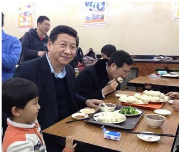
Xi Jinping eating a value meal subsequently dubbed the ‘Chairman’s Combo’

Yet if the image of Xi eating at the Qingfeng Steamed Bun Outlet seems to support small-scale entrepreneurs in the market economy, the reality is somewhat different. The Qingfeng chain is a subsidiary of the Huatian Group, a state-owned conglomerate that was co-founded by Beijing’s Xicheng District Government and the State-owned Assets Supervision and Administration Commission of the State Council. The complex relationship between the state and the market results in many such examples in which private enterprise and state ownership coexist. For example, when corporations, not official bodies, sponsor banquets, the anti-waste