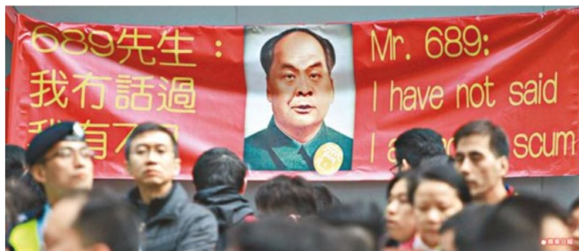
'Mr. 689' is the nickname Hong Kongers have given CY Leung, installed as Chief Executive of Hong Kong in 2012 with 689 votes by China's elite electoral committee. It became the unofficial symbol of the Hong Kong protests in 2014

During this time, the government gradually relaxed restrictions on travel by Chinese nationals to other countries. Through the 1990s, 'approved destinations' were confined to the Asia and Pacific region, with Australia and New Zealand being added to the list in 1999. Most European countries became approved destinations in 2004–2005, the United States in 2008 (by which time there were ninety-five countries on the list) and Canada in 2010. In 2013, Rwanda became the 116th country to make the list.