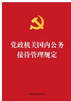
Rules on Party and Government Domestic Official Business Reception Management