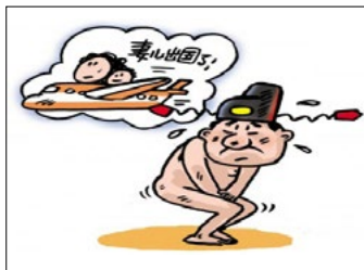
‘Naked officials’: Party and government officials who send their families and suspicious fortunes to Hong Kong or Western countries, including tax havens with no extradition treaty with China, without a legitimate work-related reason

Among the most popular cities with cashed-up Chinese investors are those where housing is the least affordable: Hong Kong, Vancouver, Sydney, San Francisco, San Jose (Silicon Valley), Melbourne, New York, London,