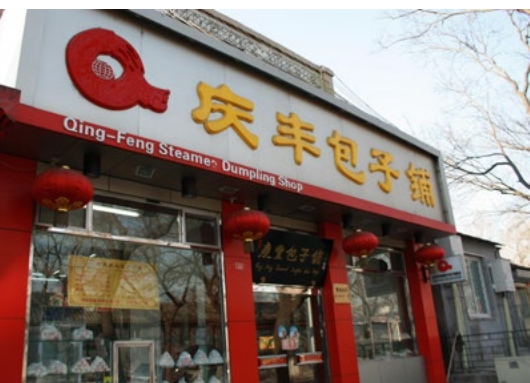
In December 2013, Xi Jinping took his austerity program into the streets, eating at the Qingfeng Steamed Bun Outlet in Beijing's Chaoyang district, one in a chain of such restaurants

frequenting or belonging to private clubs (see the China Story Yearbook 2013: Civilising China , Information Window 'Bathtime: Clamping Down on Corruption', p.104). Inspectors have identified upscale private clubs and restaurants in public parks and heritage sites for closure and corrective action. In January 2014, the Beijing Municipal Government listed twenty-four such clubs and restaurants operating in public parks, some in dynastic-era heritage buildings, including in Beihai Park