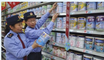
Chinese tourists are buying up infant milk powder everywhere they can get it. In Hong Kong the phenomenon has resulted in widespread shortages. Hong Kong authorities have imposed a two-tin export restriction on mainland Chinese tourists

Data source: Hurun Report 2014, People's Daily Online, retrieved 26 January 2014