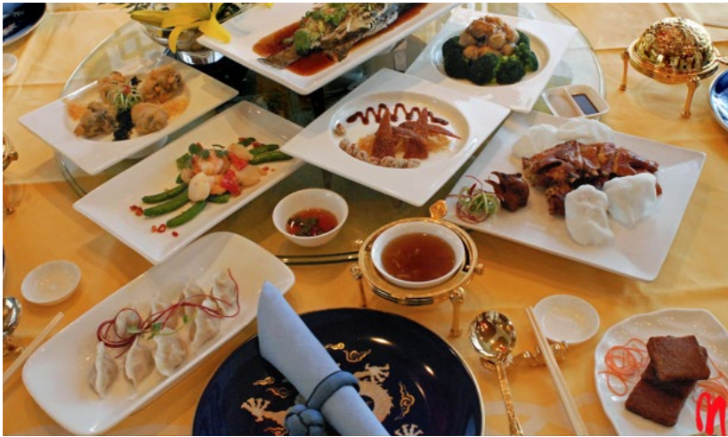
The newly approved 'Party and Government Regulations for Strict Economic Practices to Combat Waste' forbade lavish dining out, banquets and receptions, gift-giving, publically funded travel and the perks that go with it

tions of local culture and the manufacture of products that have not been approved by higher authorities. They also proscribe non-approved changes to the administrative divisions, that is, the subnational boundaries, of governing districts. They demand that officials vacate non-standard office spaces, including long-term leases in hotels, and ban the construction of large and lavish new offices. Moreover, local governments must not, as they have taken to doing on a grand scale, build flash new urban landmarks 城市地标 or large-scale plazas.