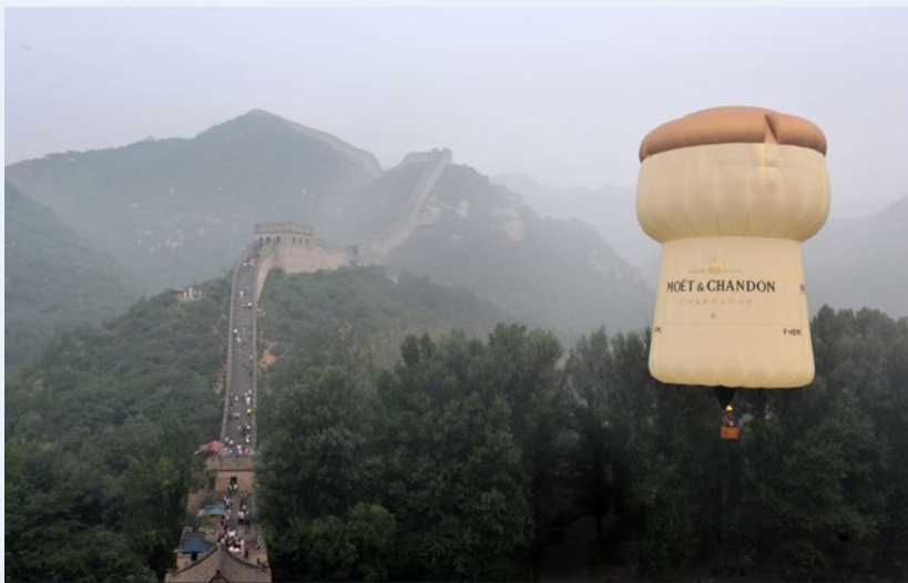
A French luxury goods conglomerate that owns Moët & Chandon and Louis Vuitton reported that sales growth in China had dropped from ten to twenty percent to just five percent in 2013

Just two years ago many foreign luxury firms had planned to expand their businesses widely in China. But sales for international brands began