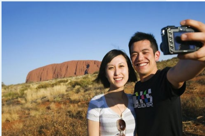
Australia was mainland China's most popular travel destination in 2013

Data source: 2013 survey by FT (Financial Times) China Confidential survey of 1,227 middle income consumers in ten first- and second-tier cities. http://www.ftchinaconfidential.com/outbound2013