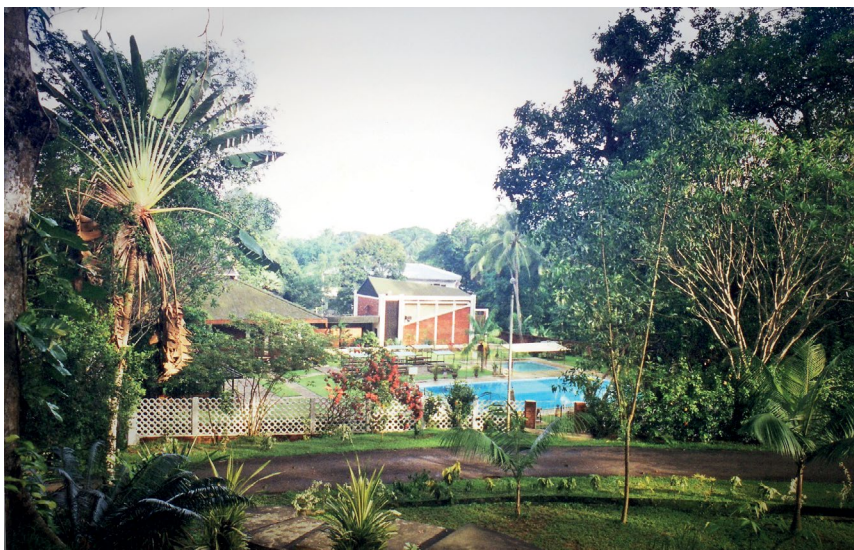
Australian Club buildings taken from Ambassadors' residence (2002)