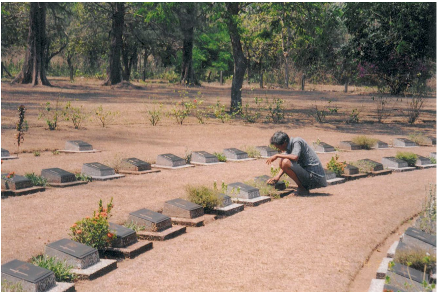
Thanbyuzayat War Cemetery gravestones (2002)