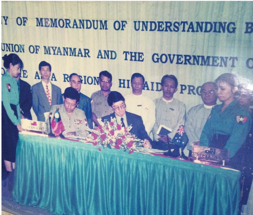
Signing MOU on HIV AIDS cooperation with Myanmar Police Force (2002)