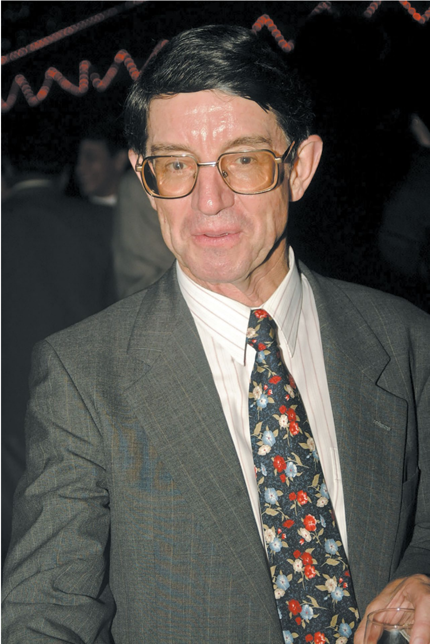
At an Australia Day Reception at the Australian Club, Yangon (2003)