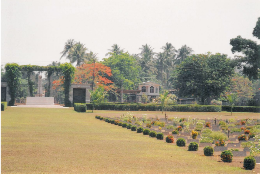
Thanbyuzayat Commonwealth War Cemetery – Entrance gate and gravestones