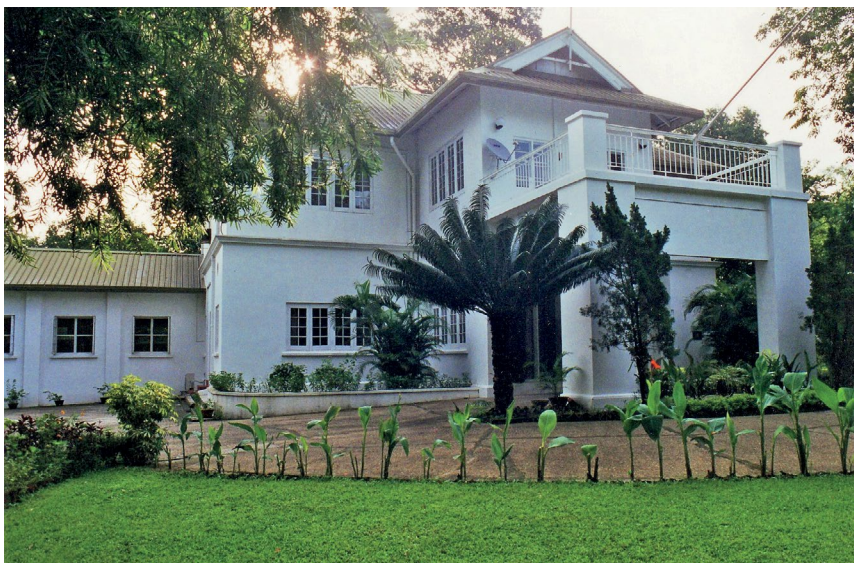
Australian Ambassador's residence and garden, Yangon (2002)