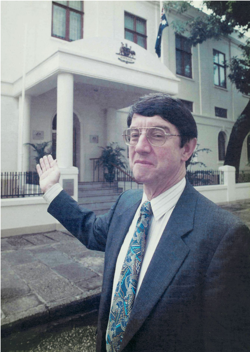
At opening of the refurbished Australian Embassy, Strand Road (2000)