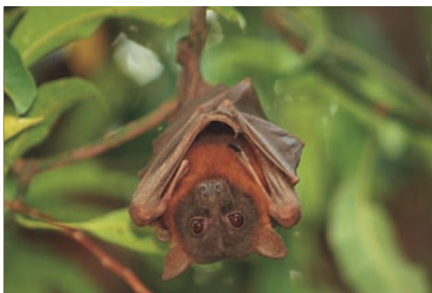
Little Red Flying-fox.