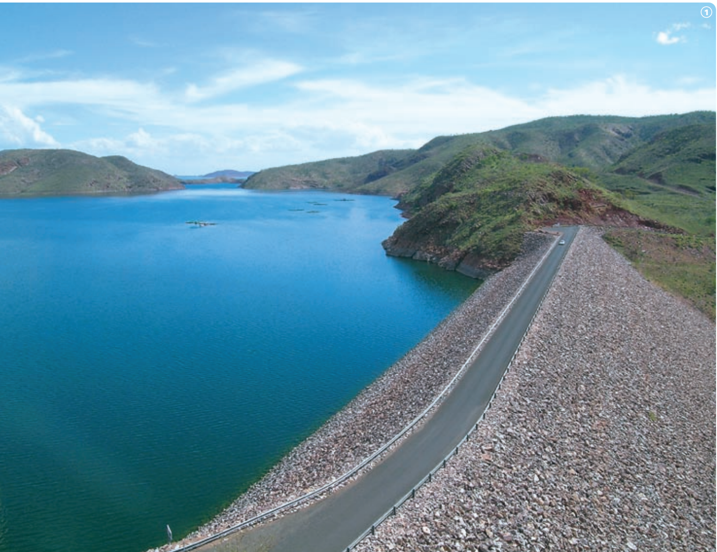
1 Ord River Dam.

for biodiversity, may be particularly vulnerable to even small rises in sea level, because they are situated in such flat and near coastal landscapes.