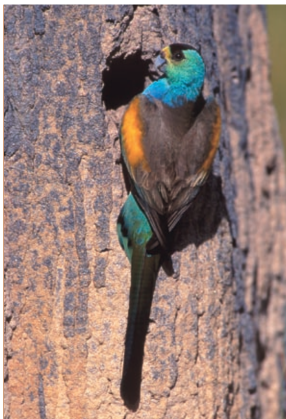
Golden-shouldered Parrot on termite mound.

Restoration of ecological function for these species and systems is not just a matter of declaring National Parks or removing land