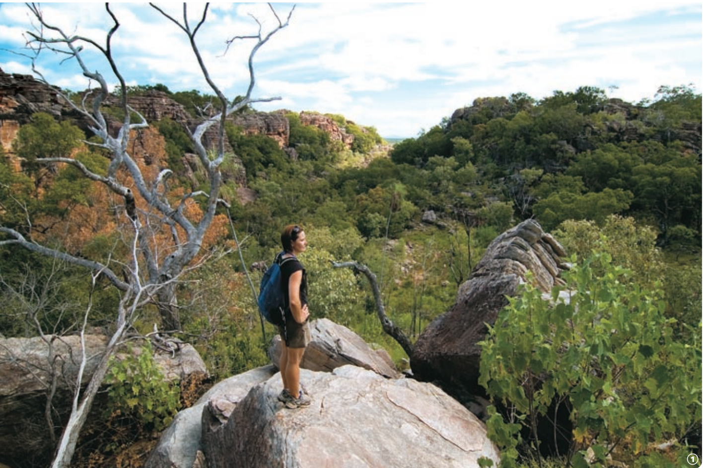
1 Gubara, Kakadu National Park, Top End.