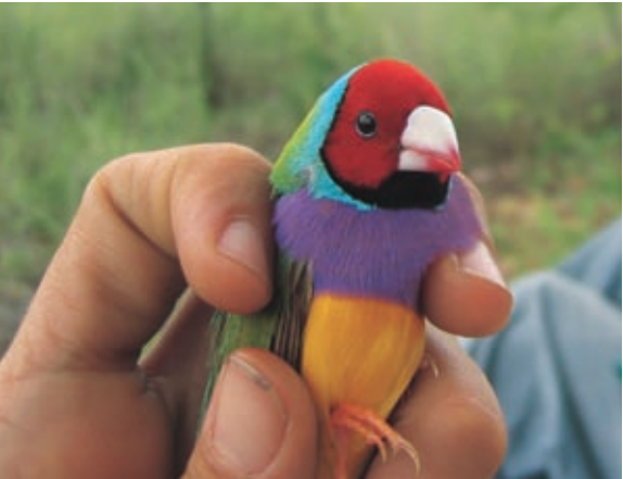
Redhead Gouldian Finch.