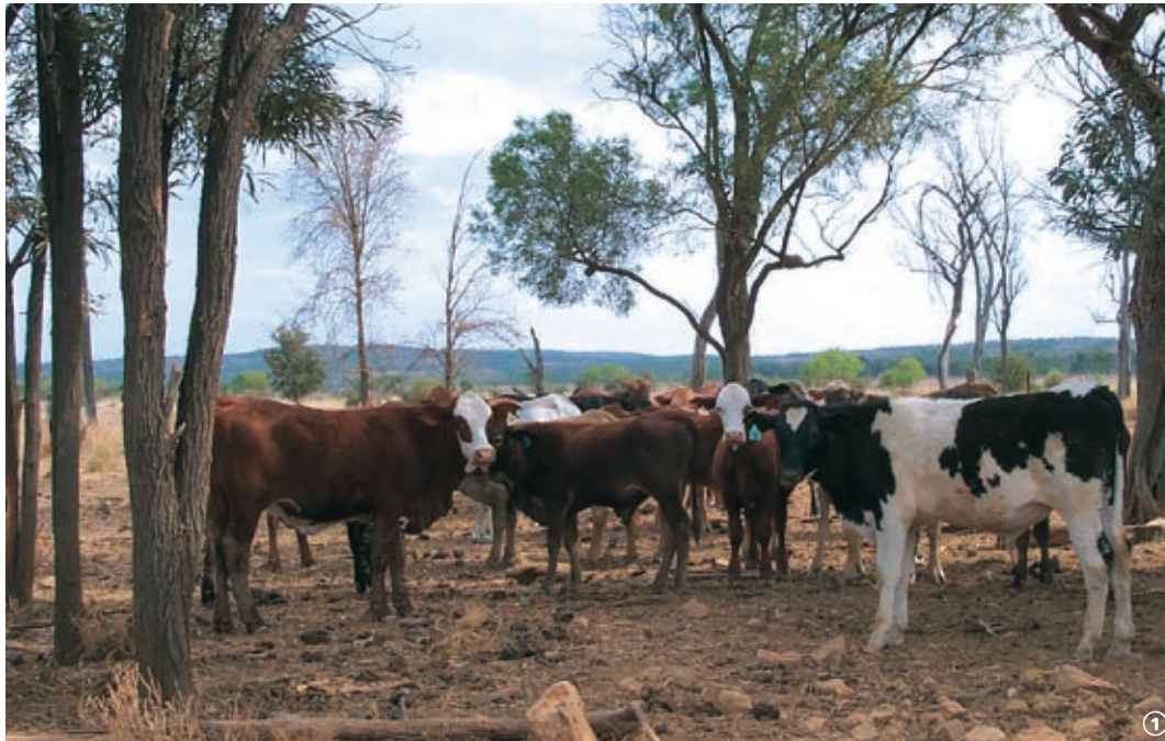
1 Overgrazing by cattle can cause significant landscape degradation.

management of about 75% of Northern Australia is now directed primarily towards improving habitat suitability for this single species, and feral cattle are present across much of the remainder of the landscape. Management activities to promote conditions for cattle include vegetation clearance, provision of artificial water sources, deliberate or consequential transformation of grass species composition (including the introduction of invasive grasses), and generally a reduction in fire frequency. Grazing itself may alter the understorey plant species composition and phenology, reduce fuel loads and hence change fire characteristics, decrease vegetative cover and hence increase run-off and proneness to erosion; and result in trampling of the tunnels and nests of ground-dwelling animals. These direct or indirect changes in environments may benefit some native plant and animal species but will also disadvantage others – perhaps many more.