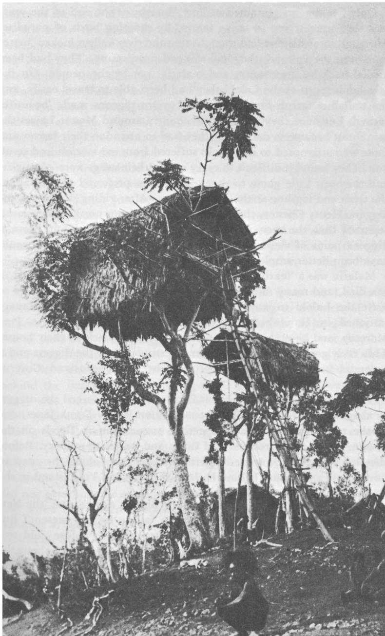
Koiari ridge-top village and tree-houses, 1885