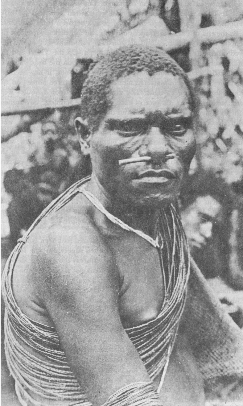
Kukukuku warrior, Lakekamu Goldfield, 1914