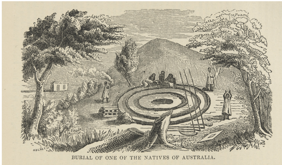
Fig 4. By the 1840s, philanthropists’ reports were becoming pessimistic. As this choice of illustration in a missionary journal shows, Indigenous Australians were increasingly portrayed as hopeless and doomed.