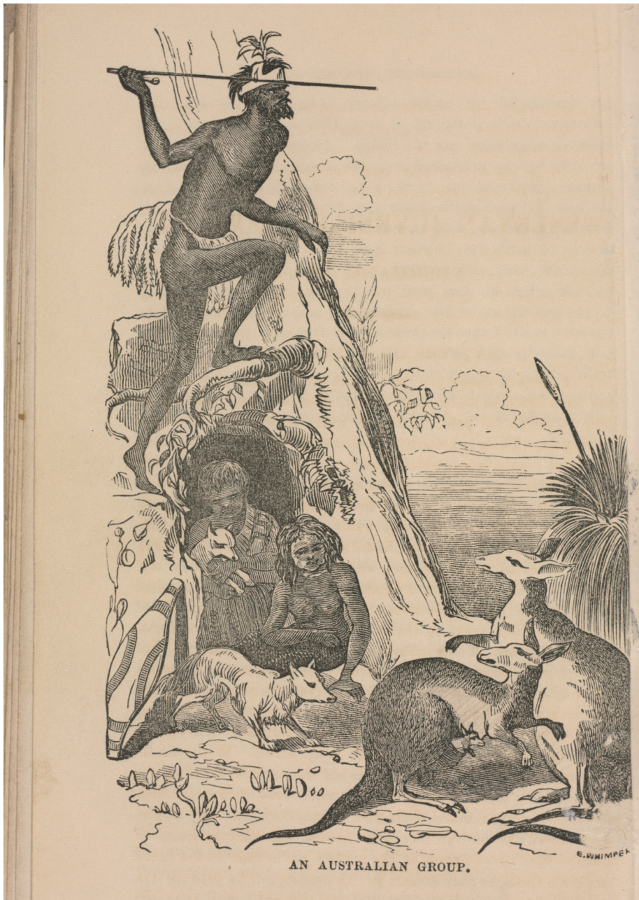
Fig 3. British missionary publications were even more dismissive of pre-colonial life than were their Australian counterparts, as this juxtaposition of Indigenous people and native animals suggests.

'An Australian Group', Wesleyan Methodist Missionary Society, Wesleyan Juvenile Offering , February 1853, Wesleyan Mission House, London. Mitchell Library, State Library of New South Wales, 266.705/W.