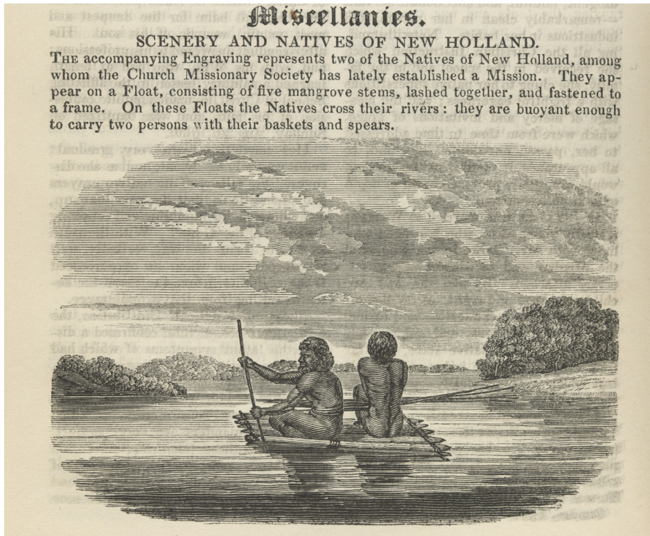
Fig 2. During the 1830s, the Church Missionary Society published tales of bush life, cultural clashes and missionary work at Wellington Valley. As the picture indicates, many aspects of traditional Wiradjuri life were continuing, to the fascination and concern of the missionaries.

Missionary Register , September 1834, L & G Seeley, London. National Library of Australia, N266.3CHU.