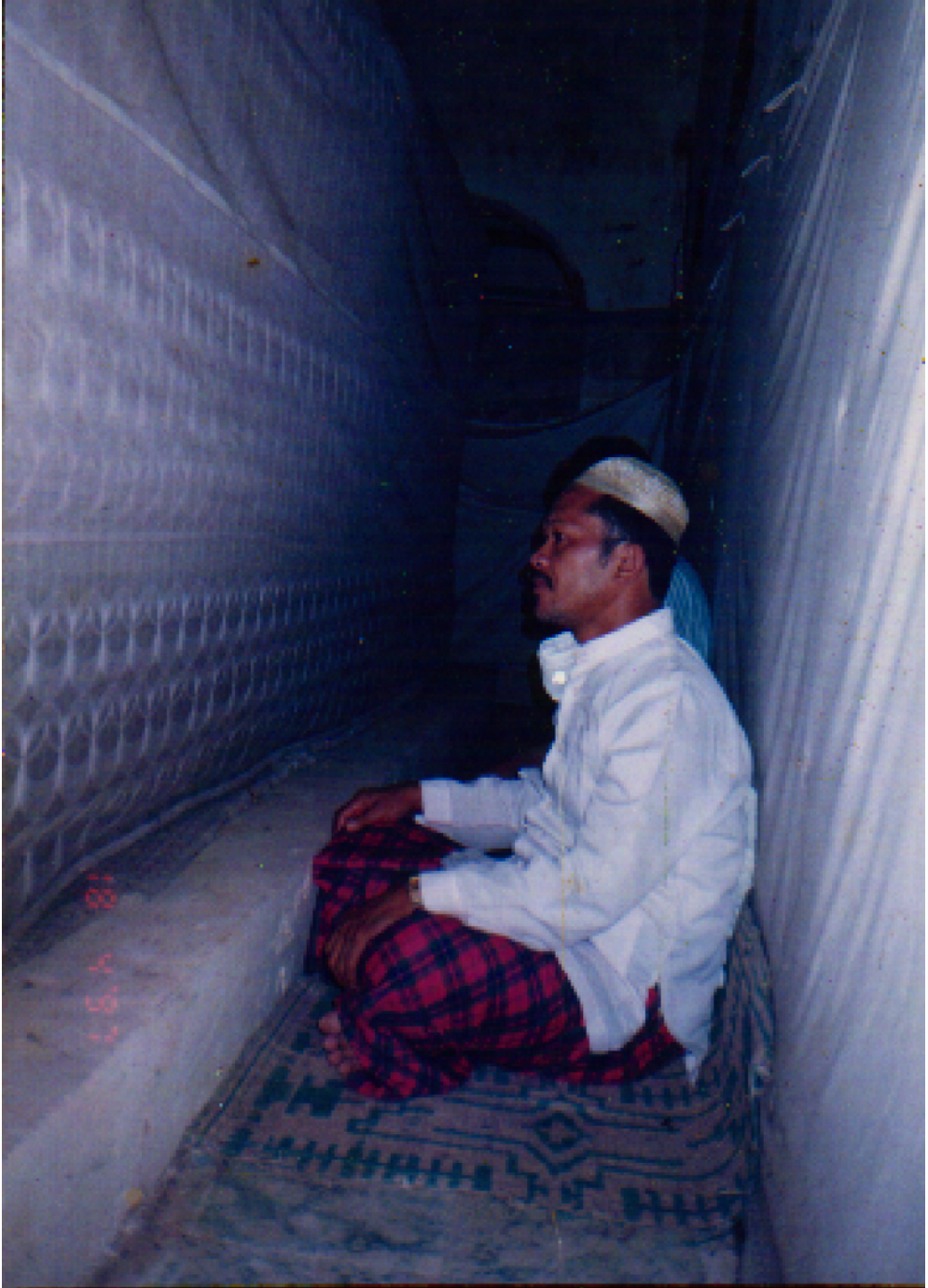
Figure 31 The custodian of Pamijahan