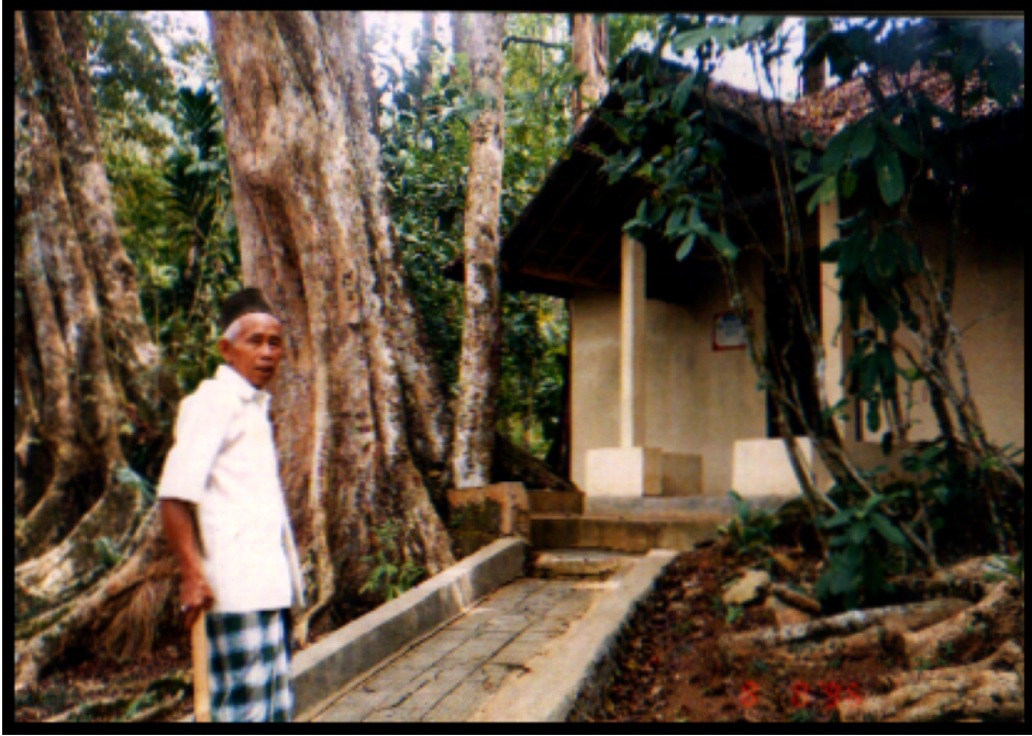
Figure 39 The custodian of Pandawa