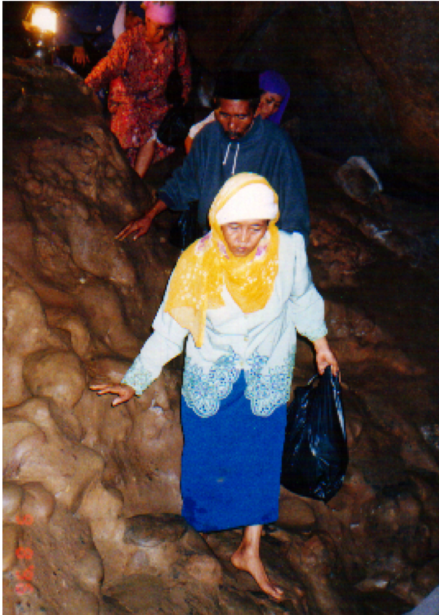
Figure 36 Pilgrims in the cave of Pamijahan (1997)