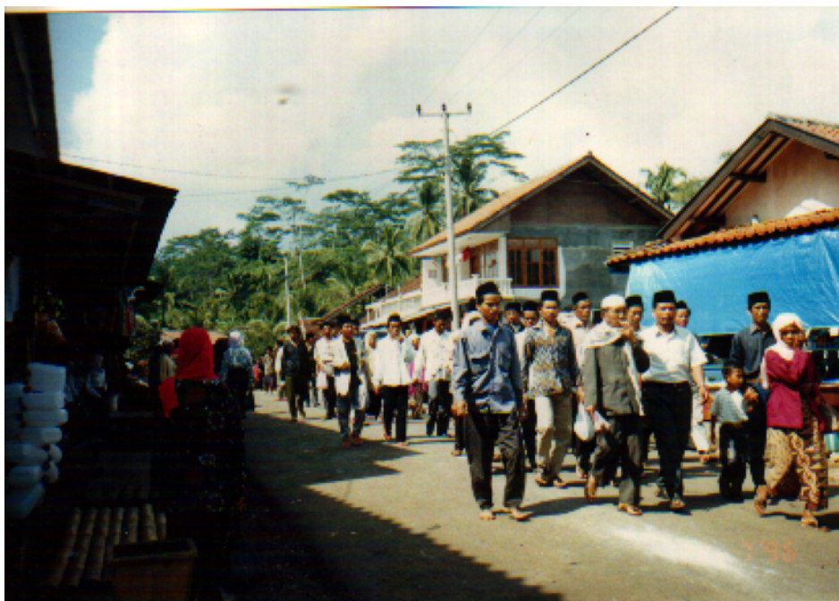
Figure 33 Peak season