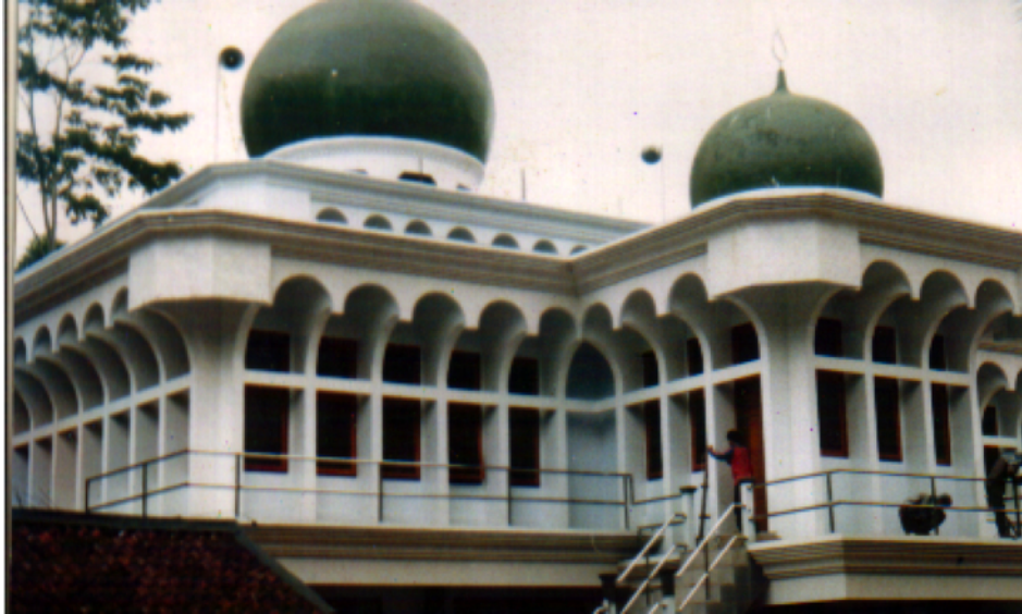
Figure 41 The grand mosque of Pamijahan in 1996