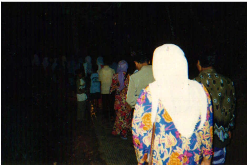
Figure 32 Heading towards the cave at 2.15 AM