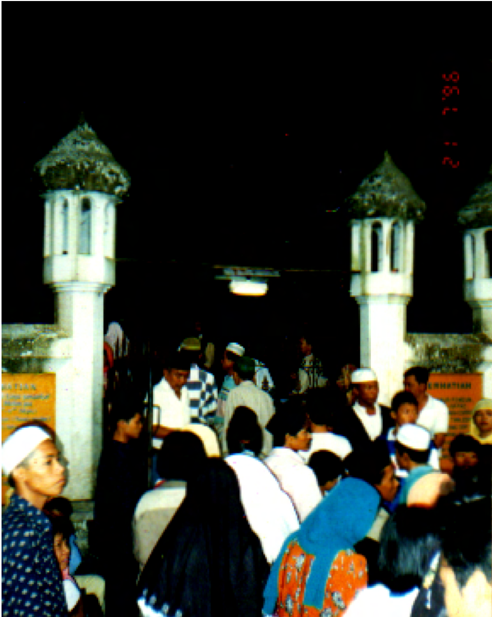
Figure 37 Pilgrims queue at the gate of the cave of Pamijahan at midnight (1996)