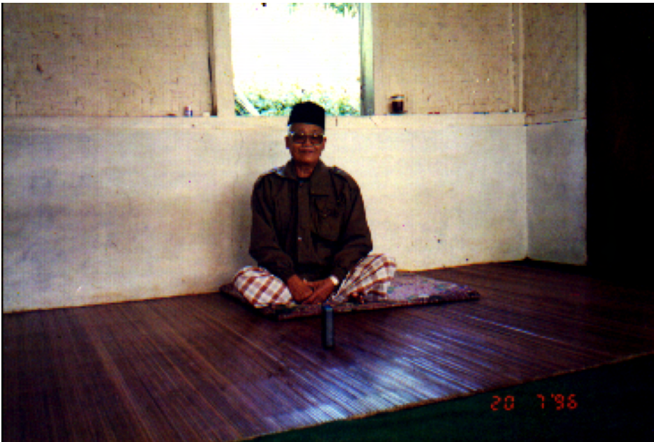
Figure 40 The custodian of Panyalahan in his office