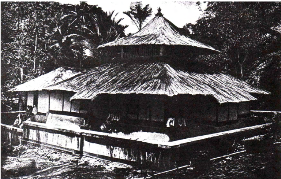
Figure 42 The grand mosque of Pamijahan in 1910 (Rinkes 1910)