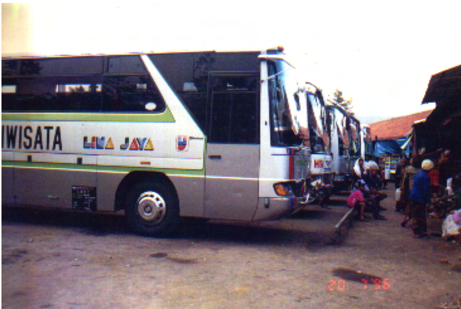
Figure 35 Pilgrims from East Java (about 800 km from Pamijahan) hired deluxe buses to reach Pamijahan (1997)