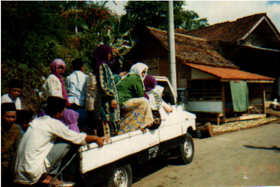
Figure 34 Pilgrims from Tasikmalaya